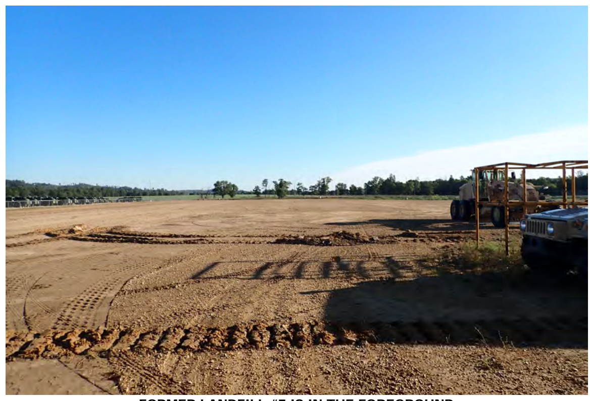
FORMER LANDFILL #7 IS IN THE FOREGROUND THE GRAVEL PILE IN THE CENTER IS THE CHAIN AND BARS FOR FLAT DRAGGING THE SITE (VIEW IS TO THE NORTH)