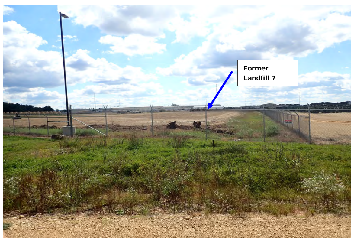
FORMER LANDFILL #7 IS PRESENT BENEATH AND EXTENDS NORTH OF THE WHITE STRUCTURE PRESENT IN THE DISTANCE (VIEW IS TO THE SOUTH)