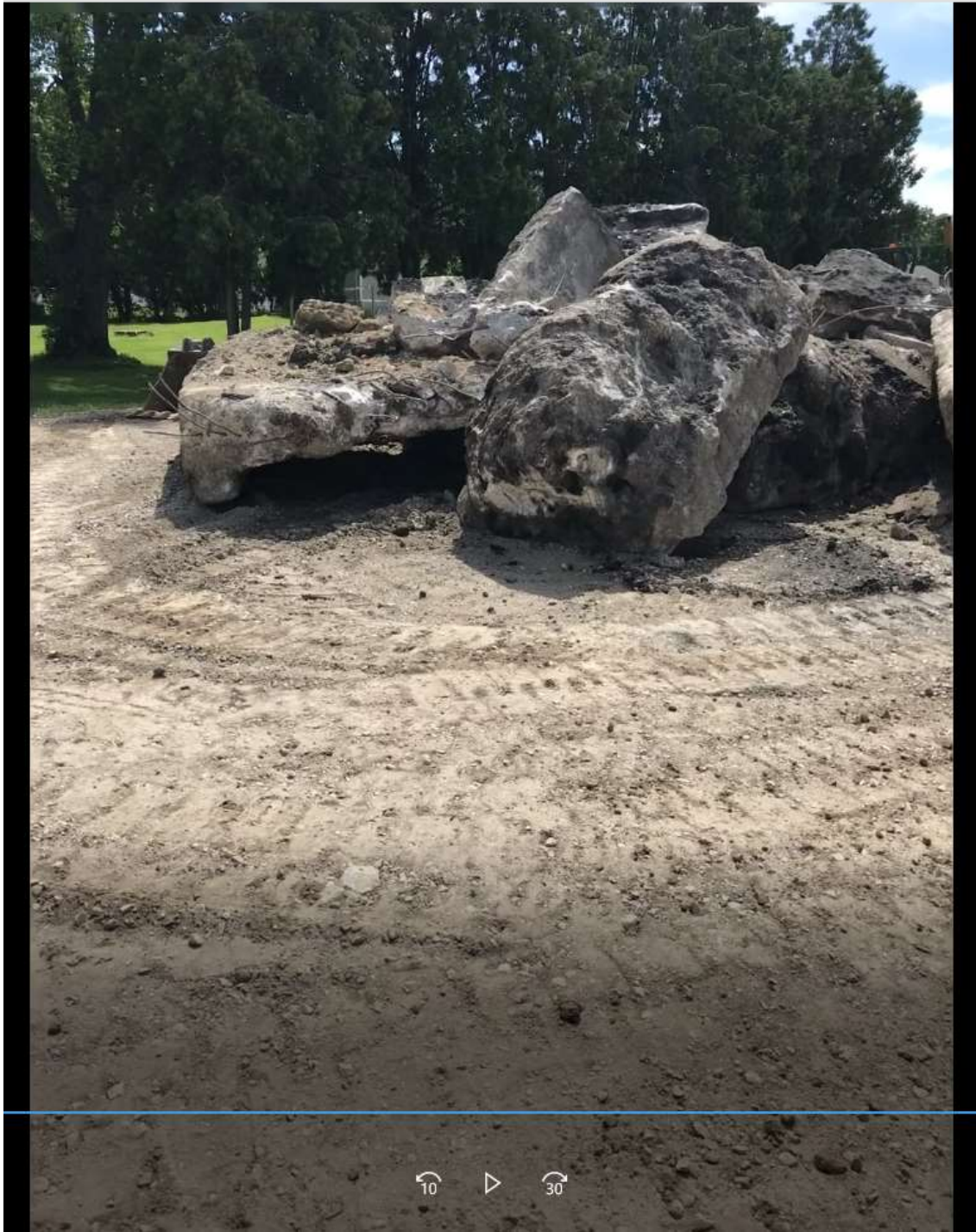
Pile of Concrete that was removed