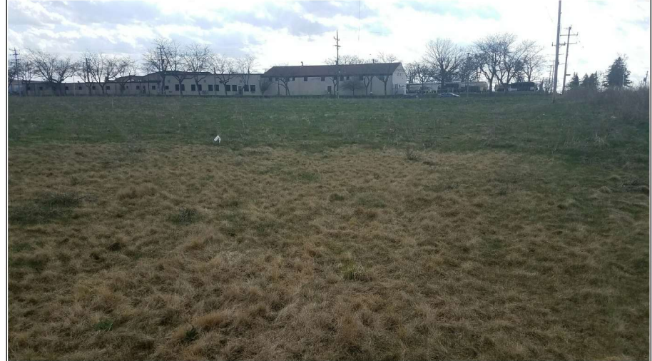
Title: vegetative cover, viewing west