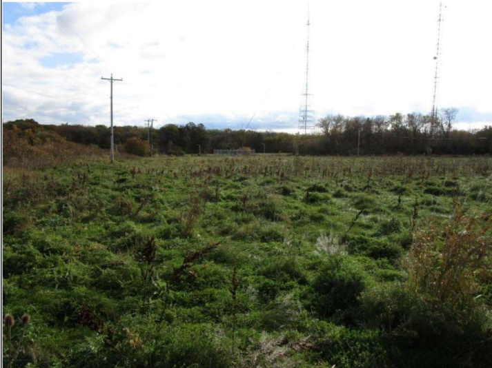
Title: vegetative cover, viewing east