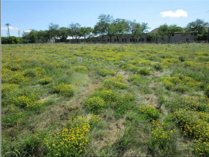
Title: disturbance to the vegetative cover, viewing west