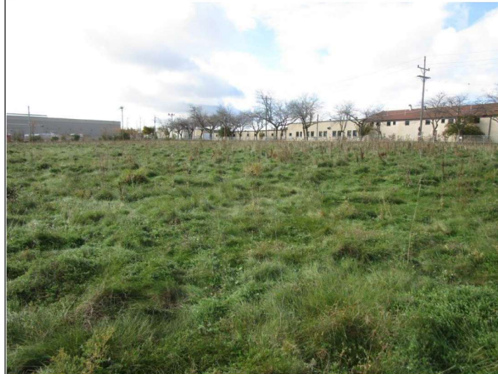
Title: vegetative cover, viewing southwest