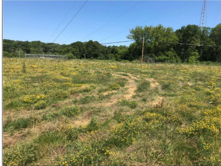
Title: vegetative cover maintenance/repair, viewing northeast