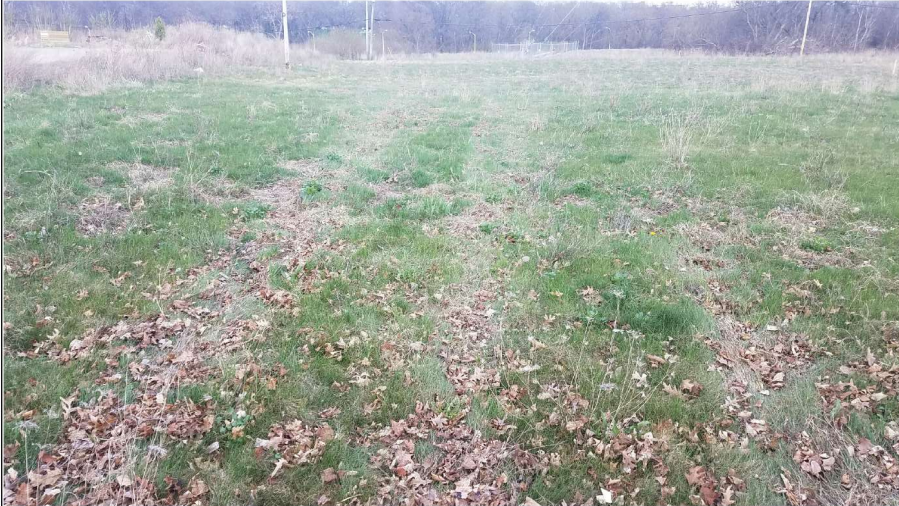
Title: minor surficial disturbance to vegetative cover, viewing east