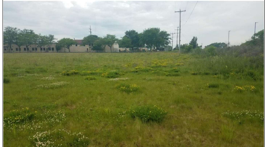
Title: vegetative cover, viewing west