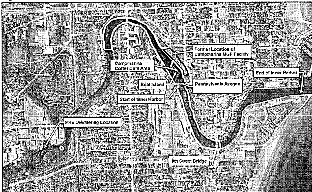
Figure 1 – Site Location

The WPSC Campmarina MGP Site is located at 732 North Water Street, Sheboygan, Sheboygan County, Wisconsin. The geographical coordinates of the Site are 43.7525140 North latitude and -87.7182090 West longitude. The Site consists of two operable units: the Upland OU and the River OU. The Upland OU encompasses an area of approximately 2.3 acres adjacent to the Sheboygan River (see Figure 1), approximately 1 mile west of Lake Michigan, and has undergone remediation under state authorities. The River OU is located immediately adjacent to the Upland OU and is approximately 4.5 acres in size (Figure 1). The River OU extends 80 feet upstream of the former northern property boundary, as much as 200 feet outward from the shoreline, and about 1,000 feet downstream of the former southern property line. The River OU is located within the limits of the larger Sheboygan River and Harbor Superfund Site, which is contaminated with polychlorinated biphenyls (PCBs). The WPSC Campmarina MGP Site is not listed on the Superfund National Priorities List but is being addressed using the Superfund Alternative Approach.