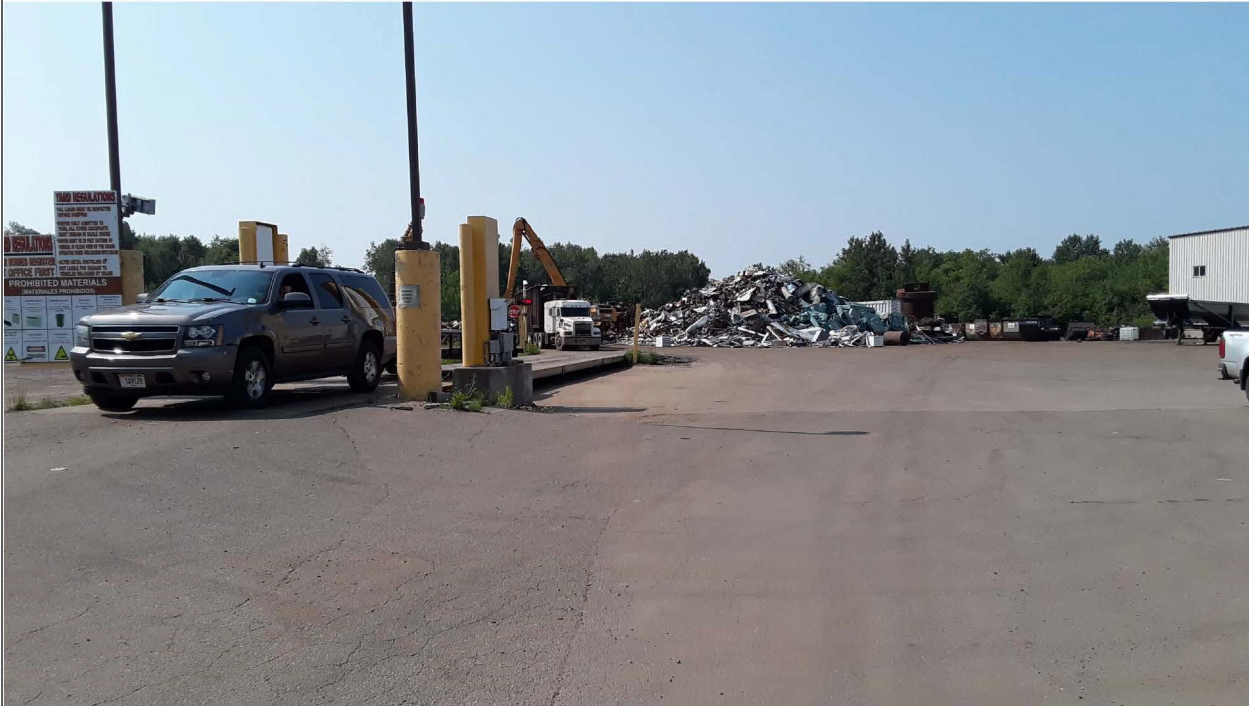
Title: Scrap Processing photo looking south

{Click to add an image file (*.bmp, *.jpg, *.gif, *.png, *.tif) For best results, insert a photo with horizontal orientation. Crop vertical photos to a horizontal orientation, if needed.} Date added: 06/19/2023