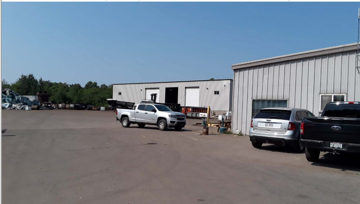
Title: Scrap Processing photo looking southwest

{Click to add an image file (*.bmp, *.jpg, *.gif, *.png, *.tif) For best results, insert a photo with horizontal orientation. Crop vertical photos to a horizontal orientation, if needed.} Date added: 06/19/2023