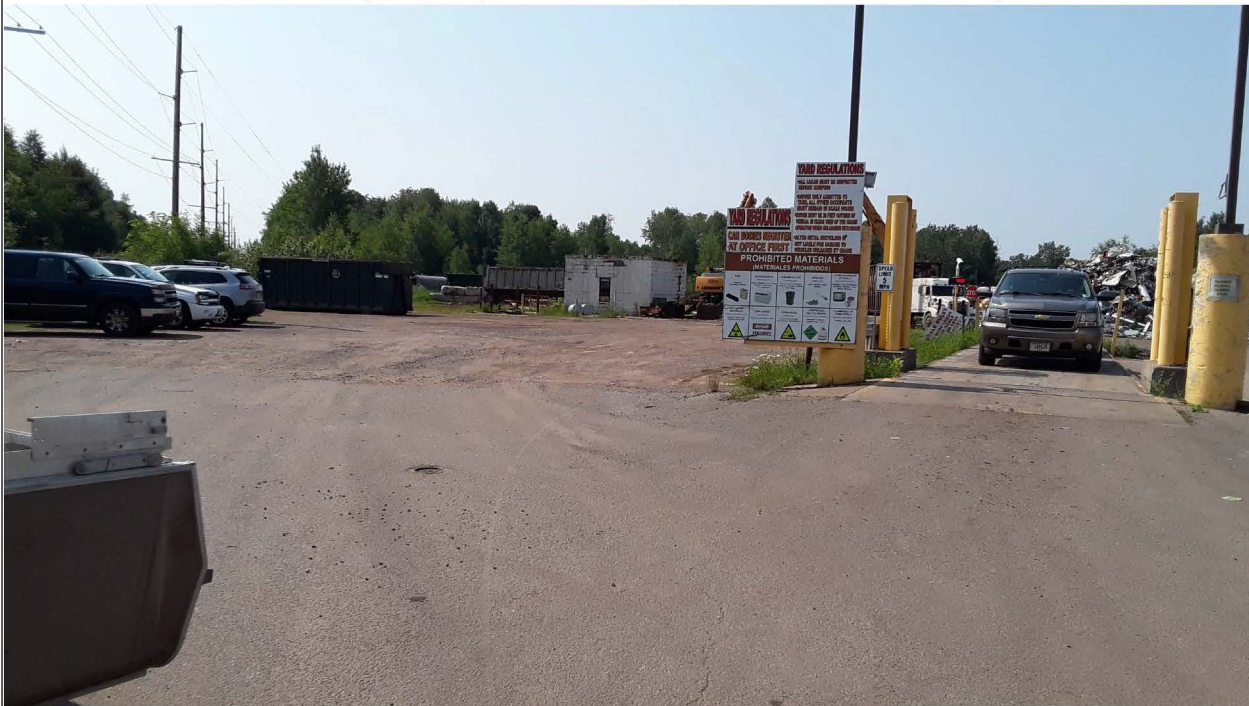
Title: Scrap Processing photo looking southeast

{Click to add an image file (*.bmp, *.jpg, *.gif, *.png, *.tif) For best results, insert a photo with horizontal orientation. Crop vertical photos to a horizontal orientation, if needed.} Date added: 06/19/2023