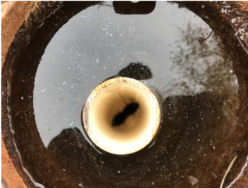
MW-4 Damaged and unable to sample