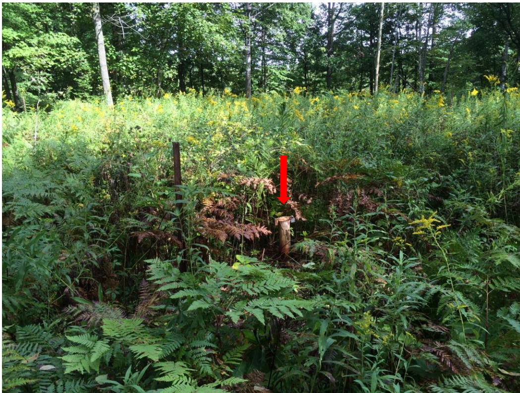
Well B-19 location, facing north