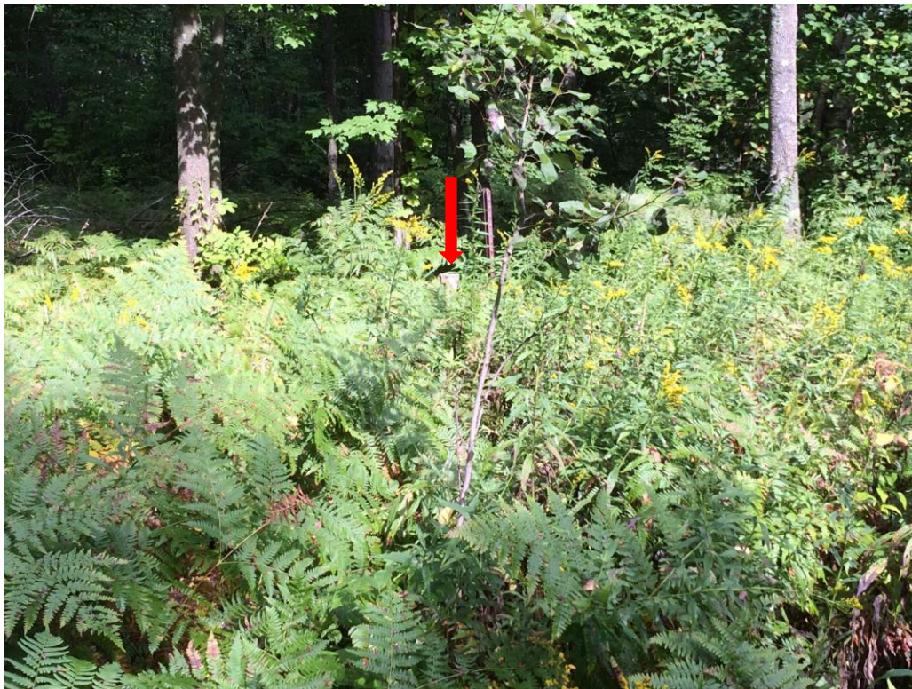
Well B-18, facing northwest