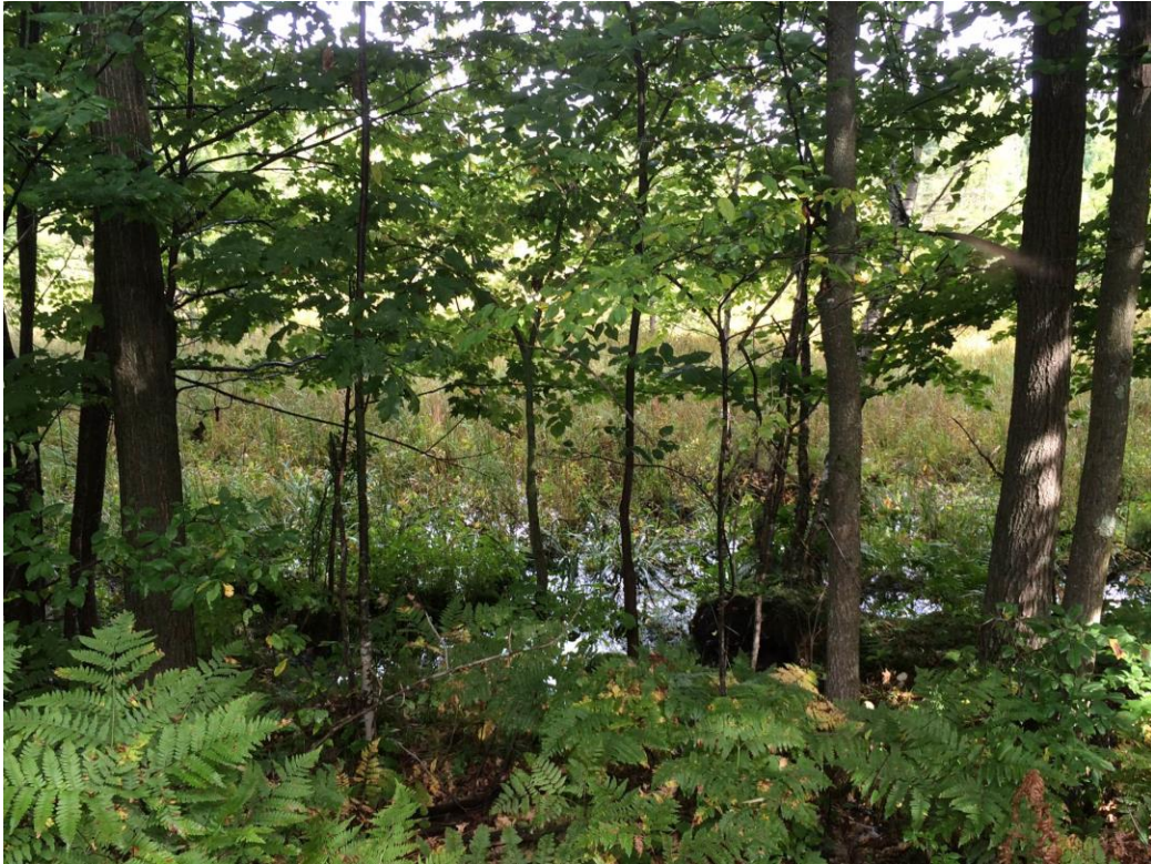
Wetland, facing north