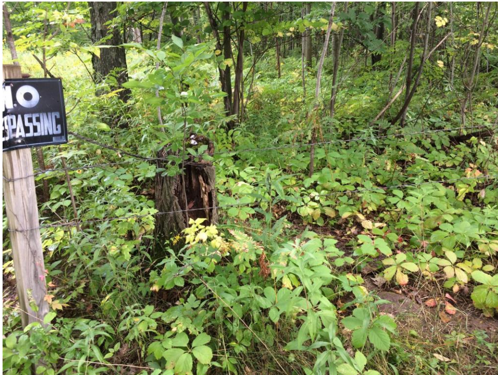
No Trespassing Sign & Woodpost/Wire Fence, Fencing was minimal, Trail by fence