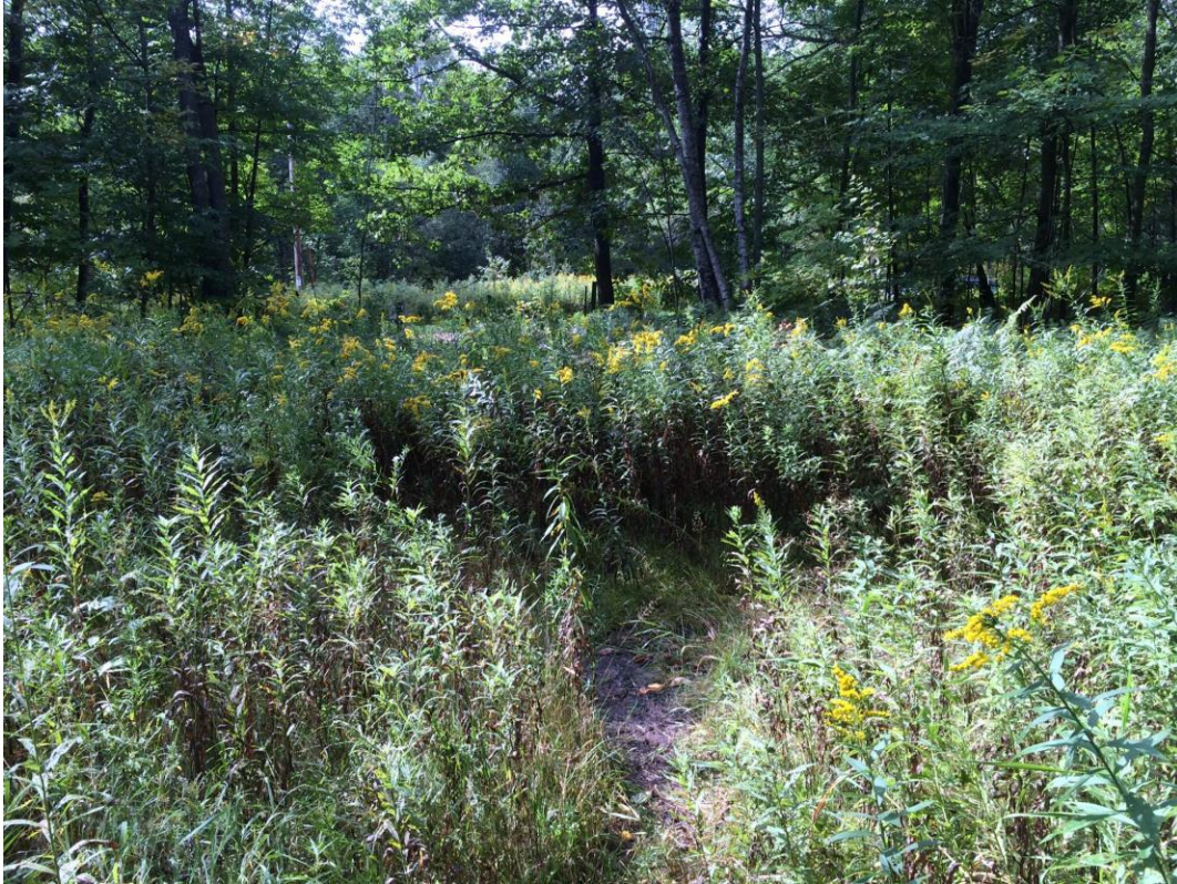
May 1984 Buried Drum Excavation Area, Trail running through this area, facing south