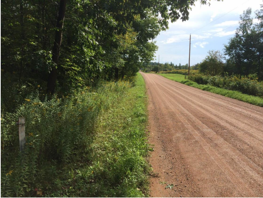
Well B-21 on left, Marsh Road, facing east