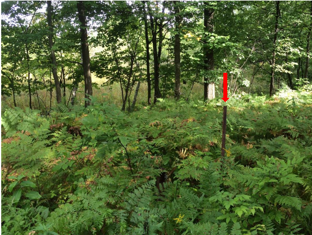
Well B-10 location, Wetland in background, facing north