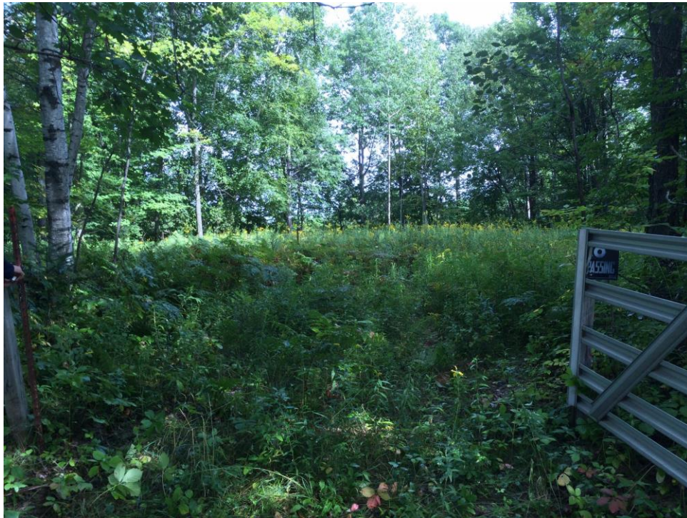
Entering property looking north at former shed and buried drum areas