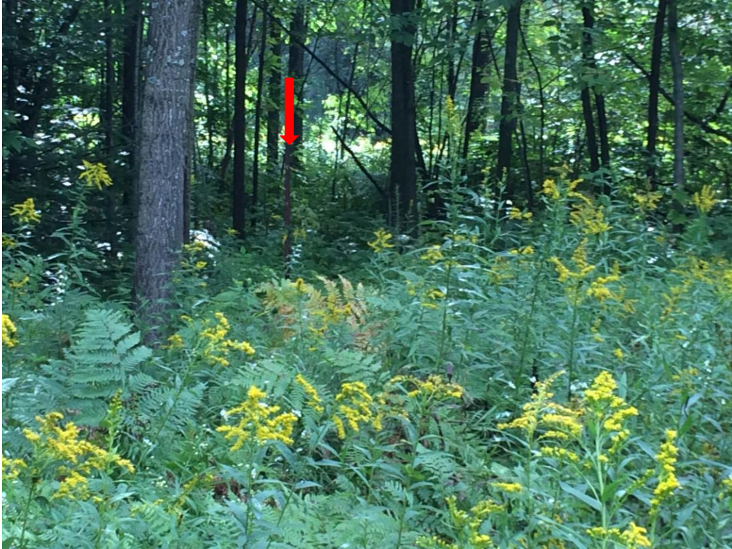
Well B-12, facing southeast