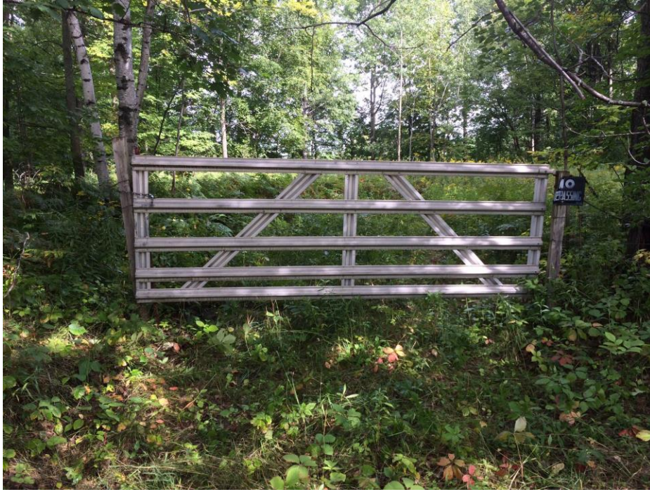
Gated entrance, Gate was unlocked, facing north