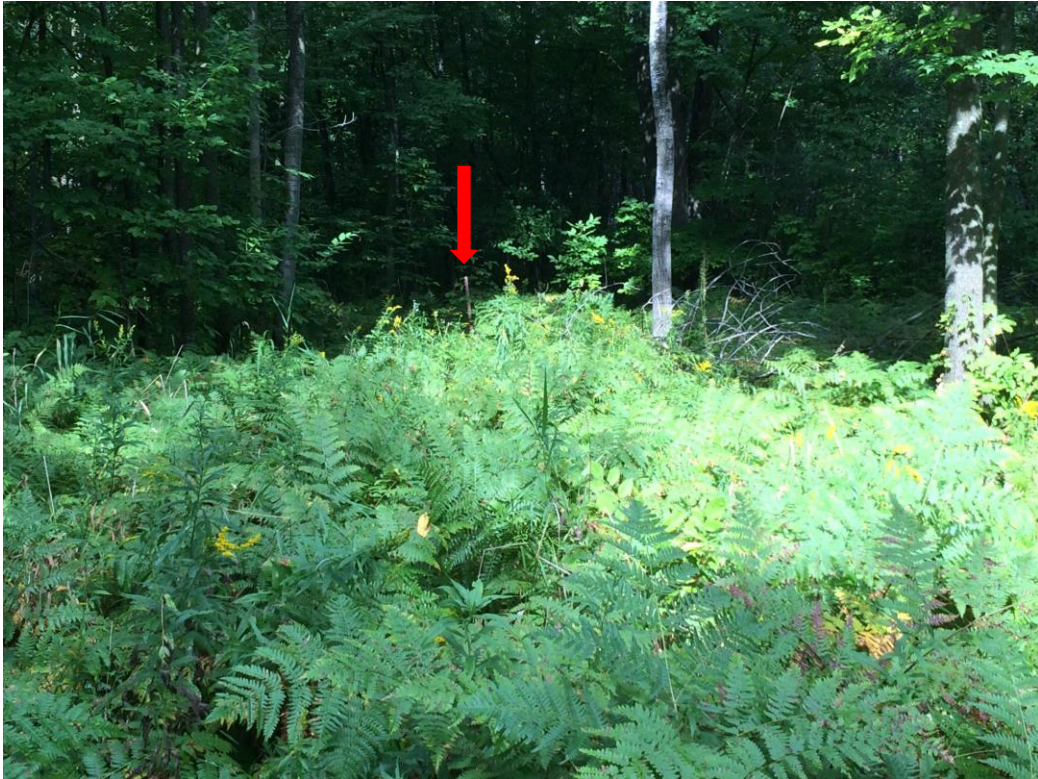
Well B-10 location, facing west-northwest