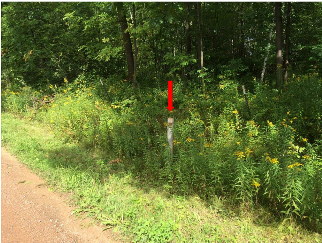
Well B-21 in Marsh Road ROW, facing northwest towards site