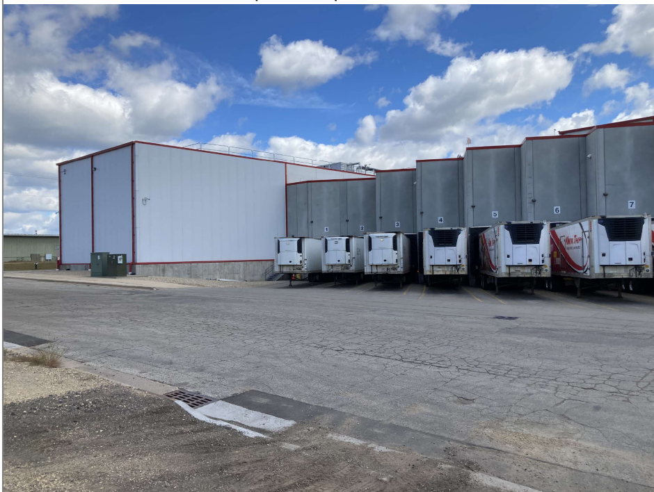
Title: Desmond's Men's Wear/0232000203/20220926/Loading dock area - west end of bakery expansion