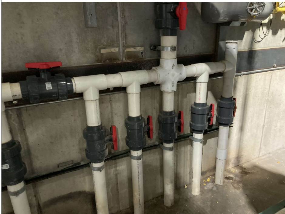
Title: Desmond's Men's Wear/0232000203/20220926/right bank of VMS manifold piping - all valves open

{Click to add an image file (*.bmp, *.jpg, *.gif, *.png, *.tif) For best results, insert a photo with horizontal orientation. Crop vertical photos to a horizontal orientation, if needed.}