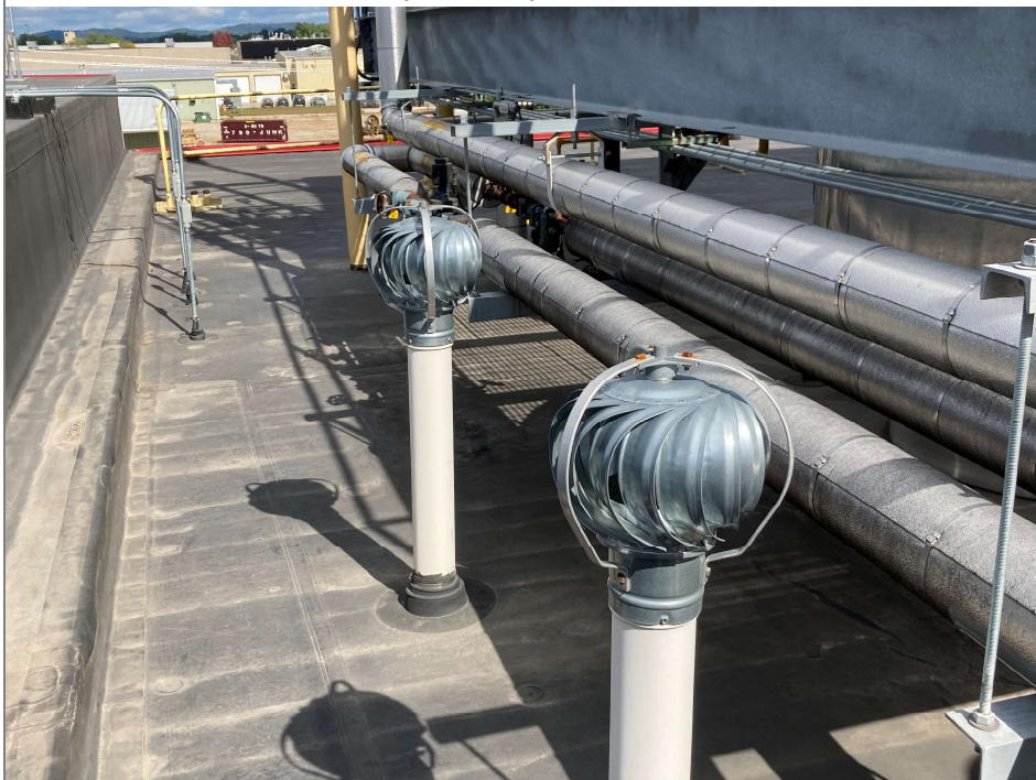
Title: Desmond's Men's Wear/0232000203/20220926/VMS exhaust with wind turbines functioning properly

{Click to add an image file (*.bmp, *.jpg, *.gif, *.png, *.tif) For best results, insert a photo with horizontal orientation. Crop vertical photos to a horizontal orientation, if needed.}