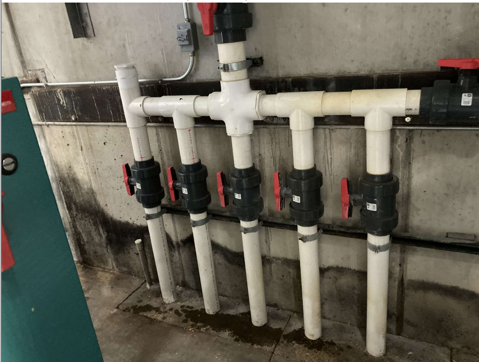
Title: Desmond's Men's Wear/0232000203/20220926/left bank of VMS manifold piping - all valves open

{Click to add an image file (*.bmp, *.jpg, *.gif, *.png, *.tif) For best results, insert a photo with horizontal orientation. Crop vertical photos to a horizontal orientation, if needed.} Date added: 09/28/2022