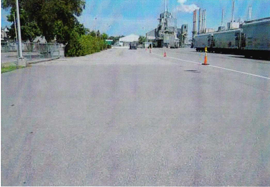
PHOTOGRAPH 1: July 24, 2012 - IMG-1552.