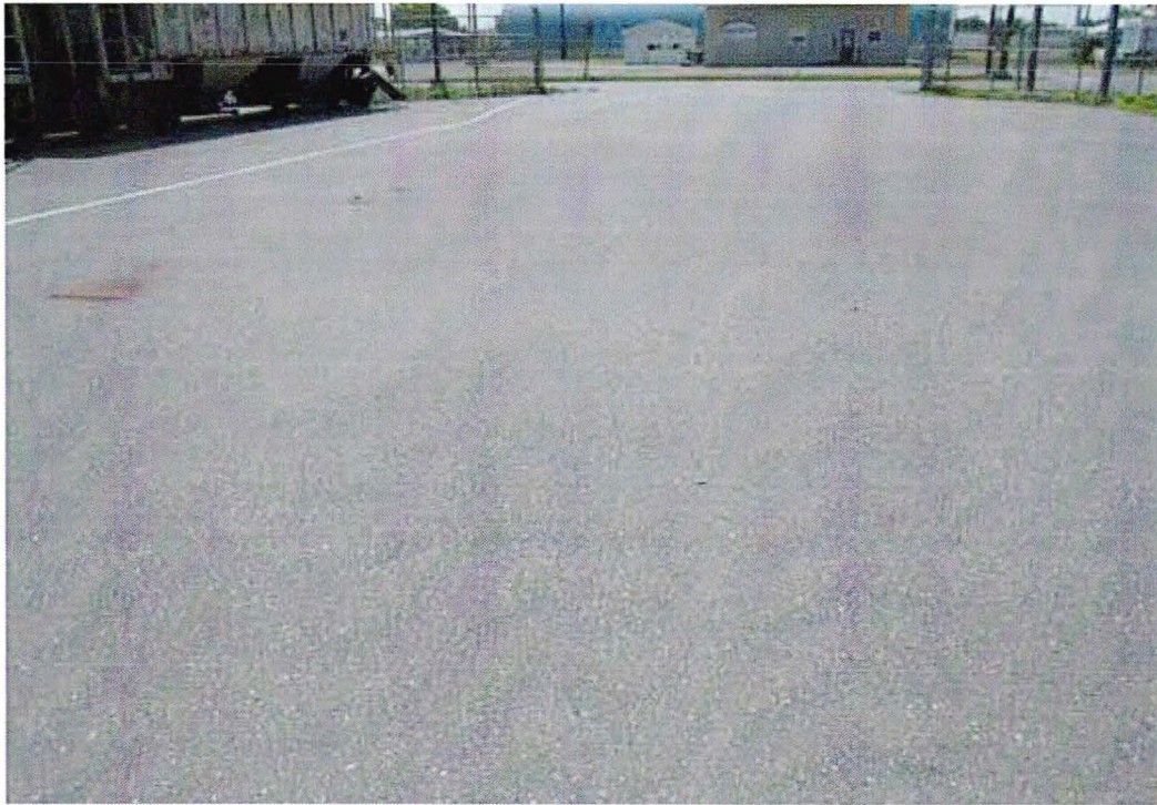
PHOTOGRAPH 2: July 24, 2012 - IMG-1553.