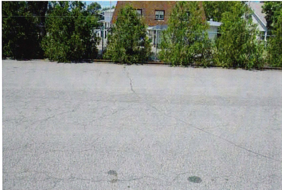
PHOTOGRAPH 4: July 24, 2012 - IMG-1555.