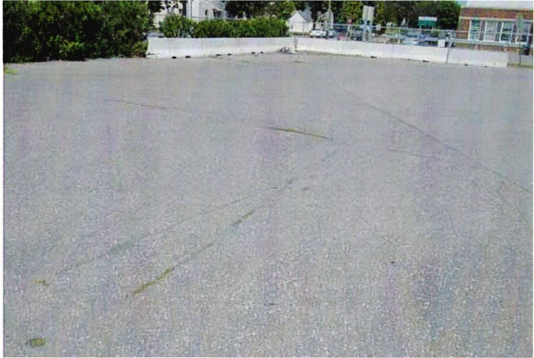
PHOTOGRAPH 5: July 24, 2012 - IMG-1560.