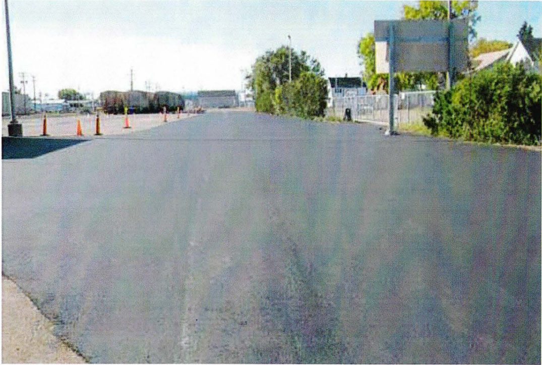
PHOTOGRAPH 1: September 14, 2012 - IMG-1632.