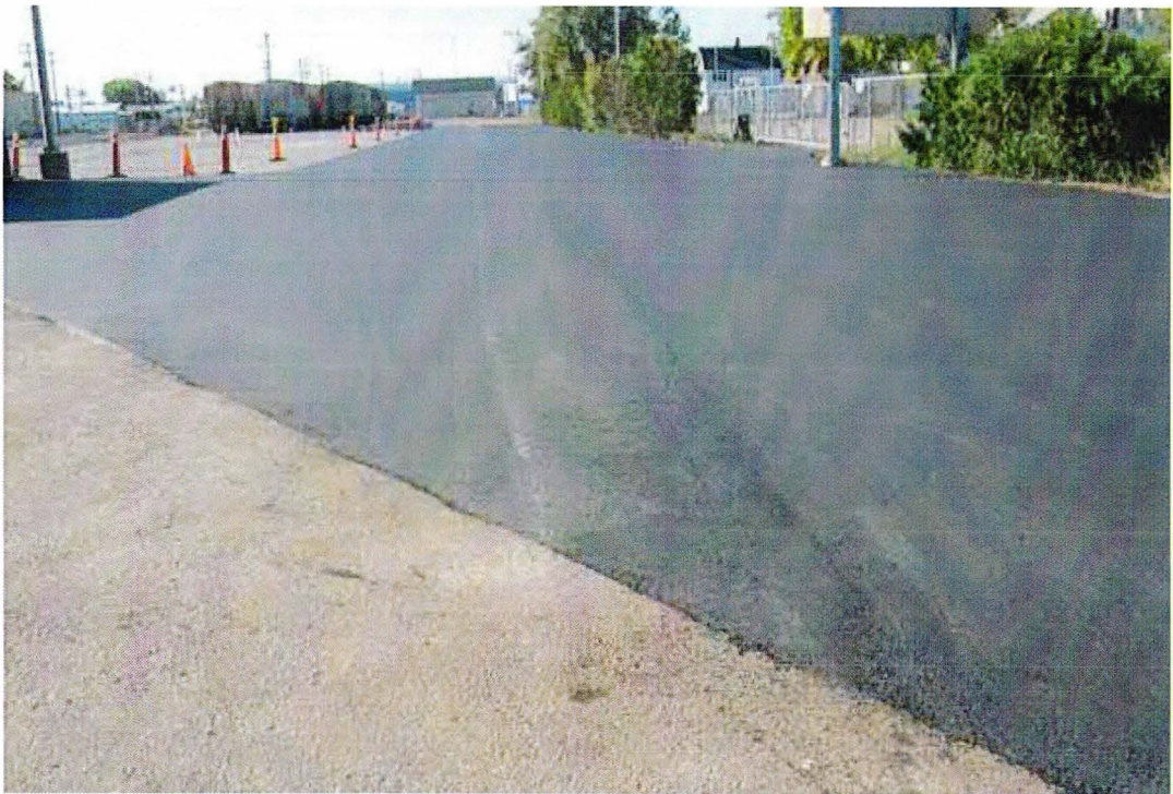
PHOTOGRAPH 2: September 14, 2012 - IMG-1633.