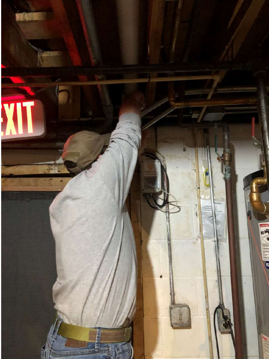
VaporSafe installing tubing into piping to measure vacuum.

Susies Restaurant (Former) LGU WI DOT 02-36-000516 Telemetry System Install – Josie Schultz Notes Photo Log from January 20, 2023