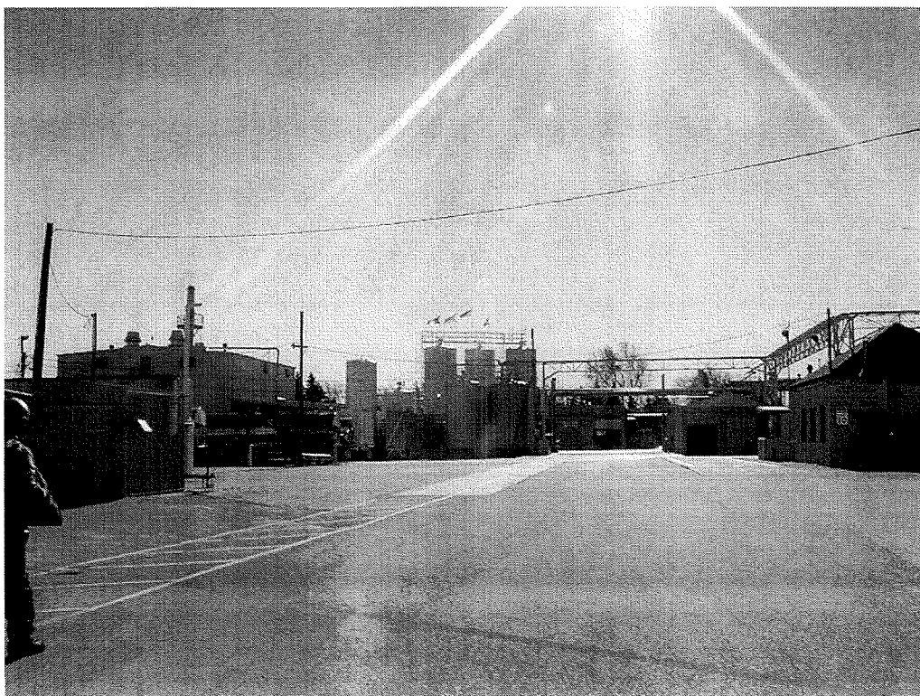
CCP Saukville, looking south from the south exit of the office building. This shot is just left of the panarama above. The soil vapor extraction system building can be seen in the foreground on the left with the small white stack. It was running when we were there.