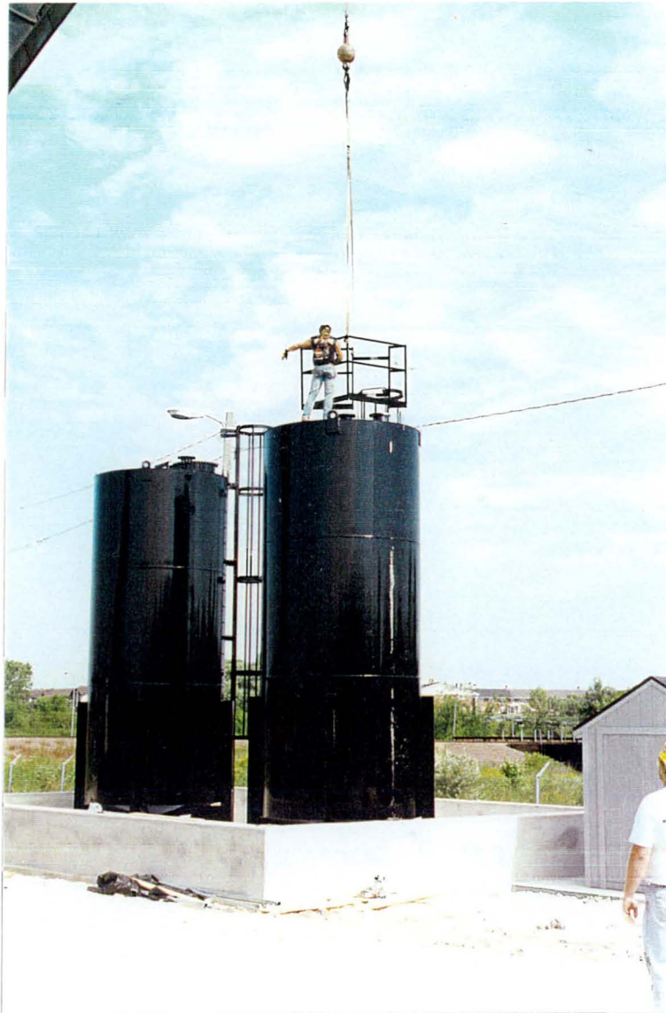
PHOTO #3: DUAL 10,000 GALLON STORAGE TANKS WITH SECONDARY CONTAINMENT.

Progress Photographs Moss-American Site Free Product Recovery and Removal System September 1995