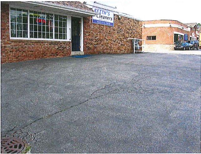
Pavement cover – facing southwest from the northeast corner of the property