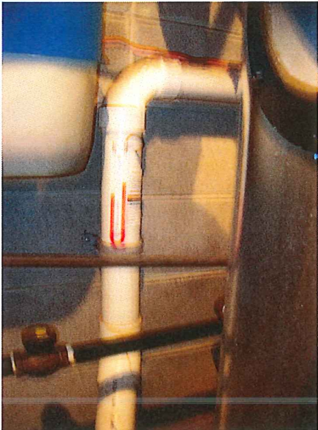
Vacuum-measuring site tube in the back room - southwest corner of the building

Jomblee, Inc. (Keith's Cleaners) BRRS 02-41-543523 and BRRS 03-41-543524 Photographs taken on August 13, 2014