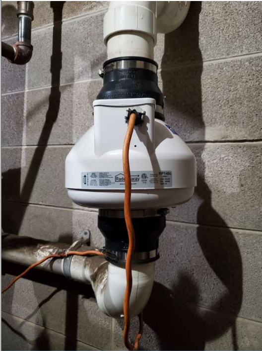
Title: Blower Fan

{Click to add an image file (*.bmp, *.jpg, *.gif, *.png, *.tif) For best results, insert a photo with horizontal orientation. Crop vertical photos to a horizontal orientation, if needed.}