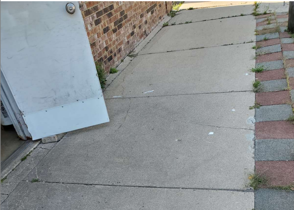
Title: Front Pavement Looking Northwest