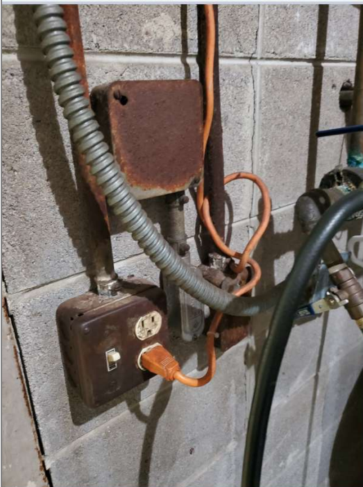
Title: Blower Fan Plug In