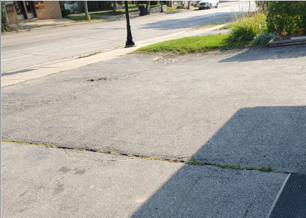
Title: Front Pavement Looking Northeast

{Click to add an image file (*.bmp, *.jpg, *.gif, *.png, *.tif) For best results, insert a photo with horizontal orientation. Crop vertical photos to a horizontal orientation, if needed.}