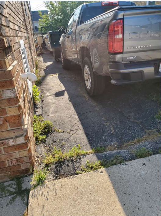
Title: Rear Pavement Looking East