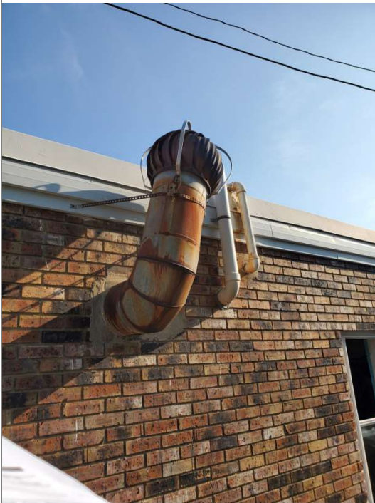
Title: VMS Exhaust Stack, (White PVC) Rear of Building