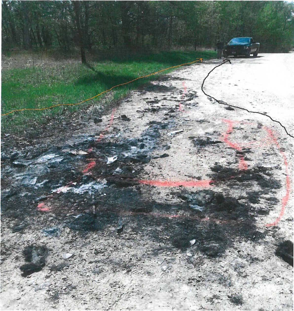
Spill on top of hill going downhill towards the truck. Debris left from the fire.