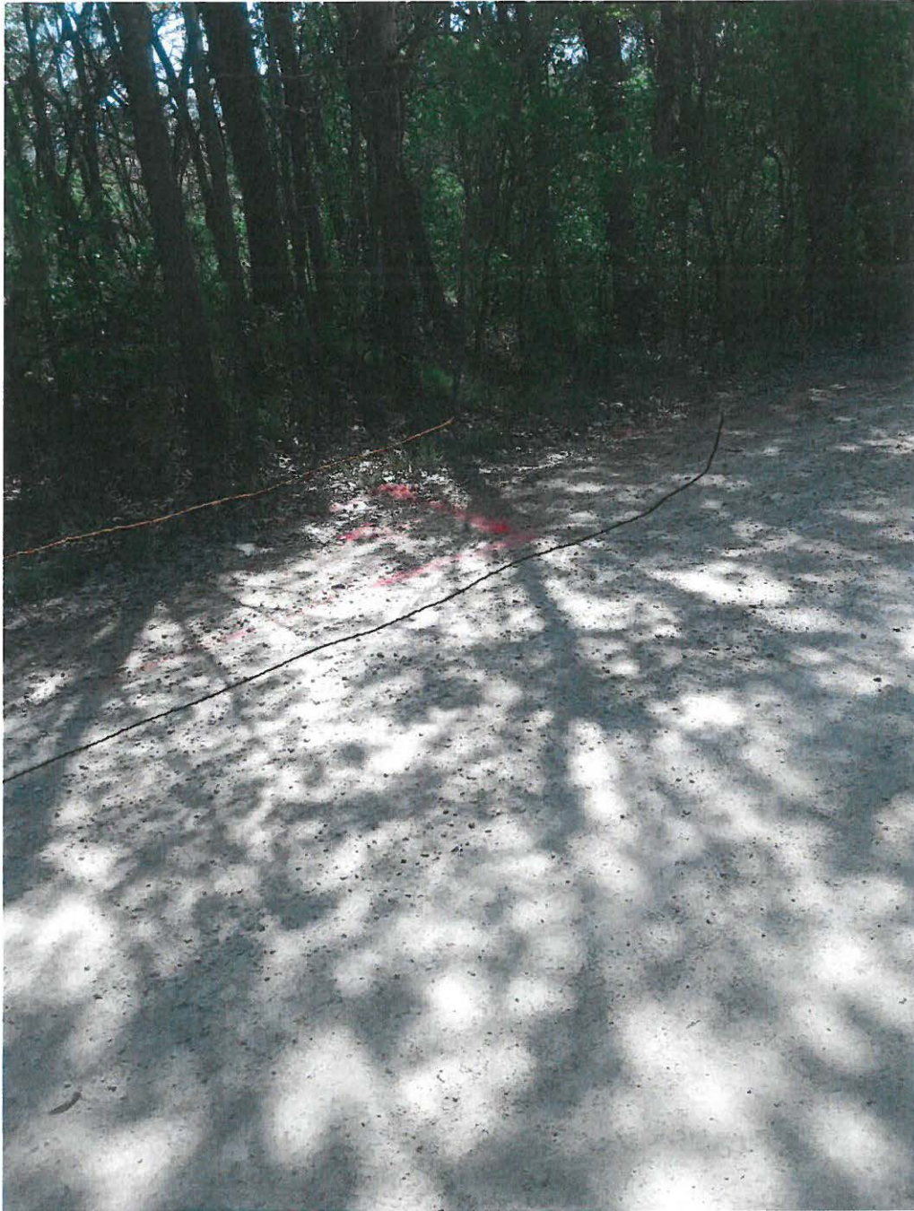
Spill ran down into forest following ditch line.