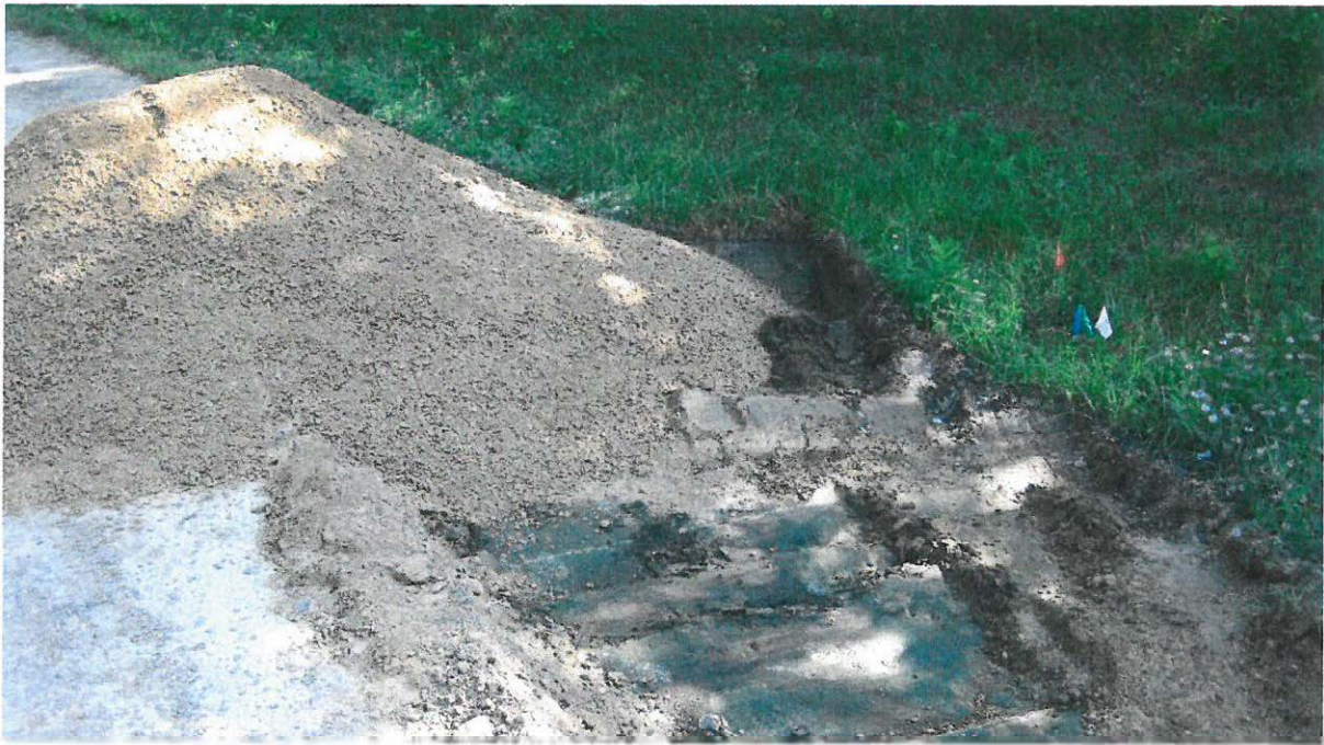
Back filling with gravel