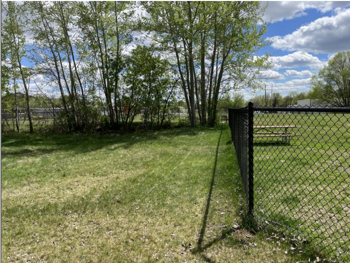
Title: View south along fence.