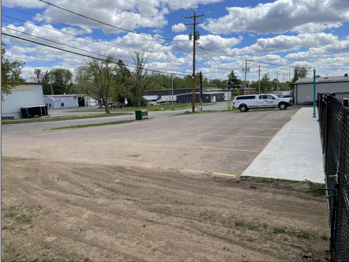
Title: Overview of parking area. View towards the south-southeast.