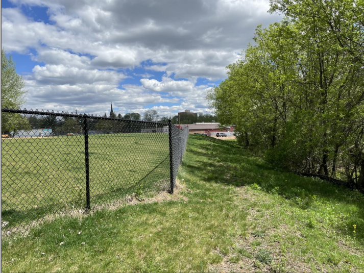
Title: View southeast along southwest portion of fence.