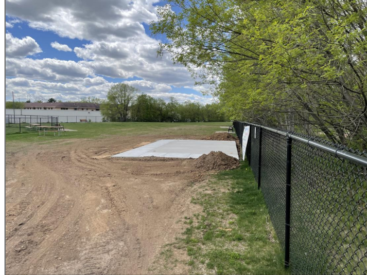
Title: View west along northern fence.