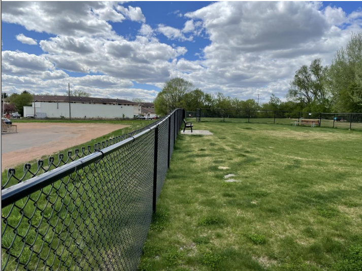
Title: View west along southern fence.