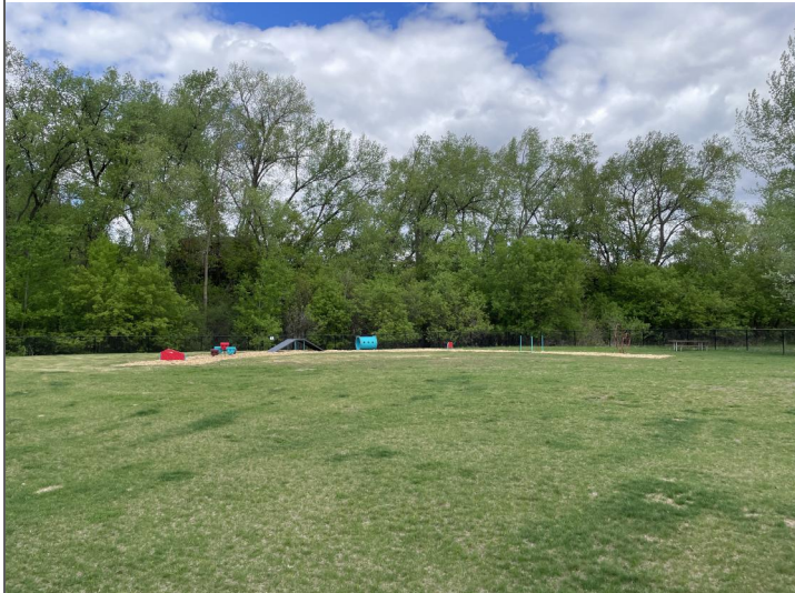
Title: Overview of fence in portion of dog park. View towards the north.