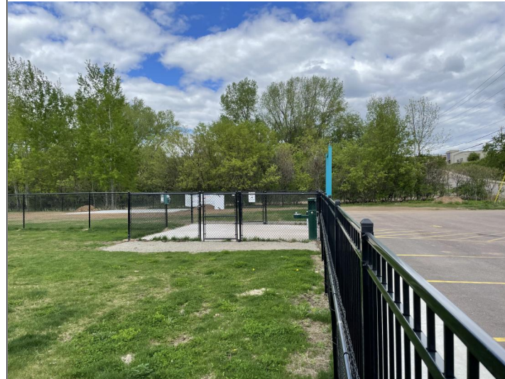
Title: View north along eastern fence.