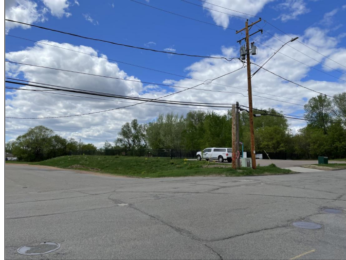
Title: Property overview. View towards the northwest.