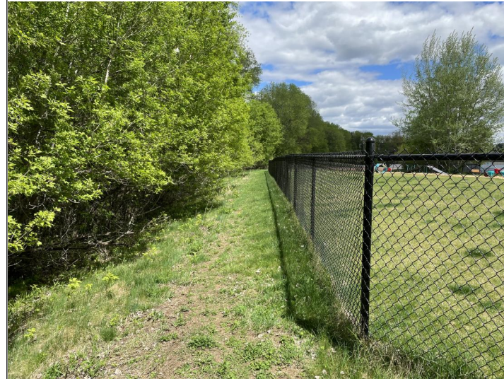
Title: View northeast along northwest portion of fence.