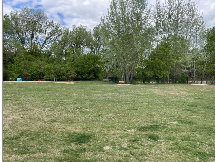
Title: Overview of fence in portion of dog park. View towards the north.