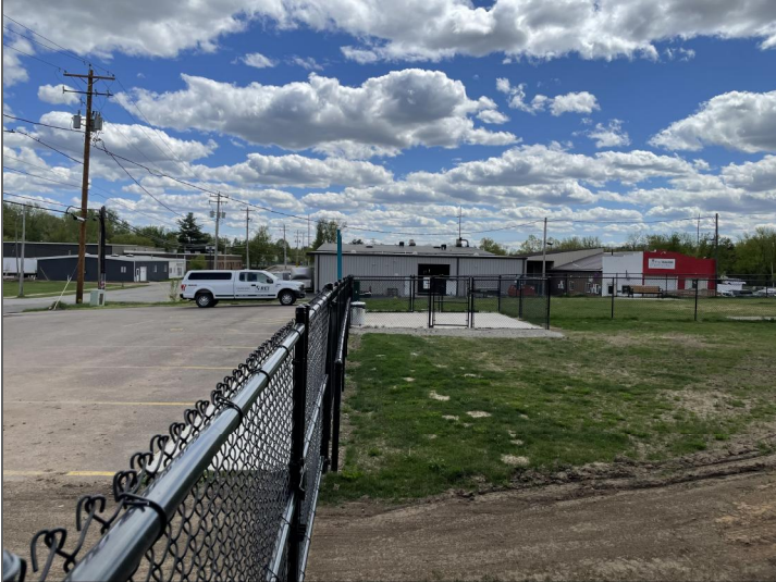
Title: View south along eastern fence.