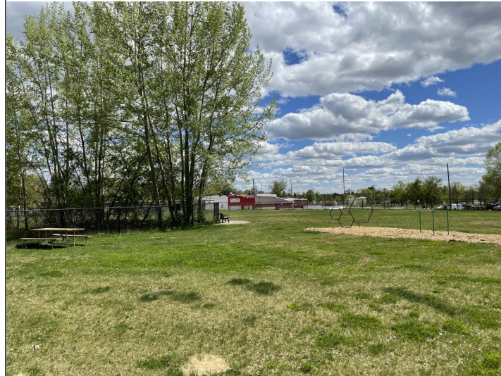
Title: Overview of fence in portion of dog park. View towards the southeast.