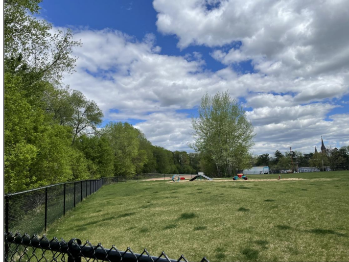
Title: Overview of fence in portion of dog park. View towards the east.