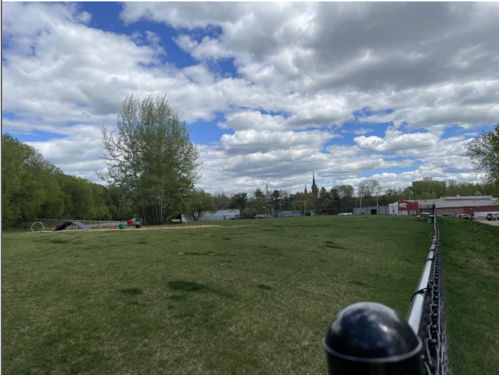
Title: Overview of fence in portion of dog park. View towards the east.