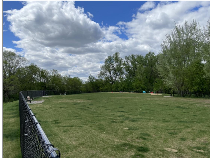
Title: Overview of fence in portion of dog park. View towards the northwest.