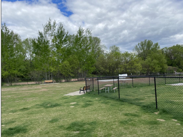
Title: Overview of fence in portion of dog park. View towards the northeast.