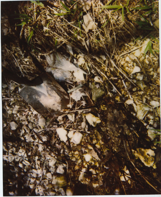
LIME KILN PARK — 5-1-97 CAC GW SEED 95 PACES, ALONG GRAVEL DRIVE FROM POND, SOUTH