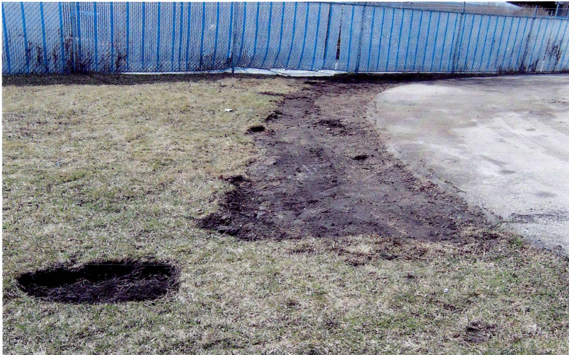
Figure 4: Lawn area following removal of stained soil.

Onyx Special Services, Inc. PO Box 367 N104 W13275 Donges Bay Road Germantown, WI 53022 Tel: 262.236.8130 Fax: 262.236.8140