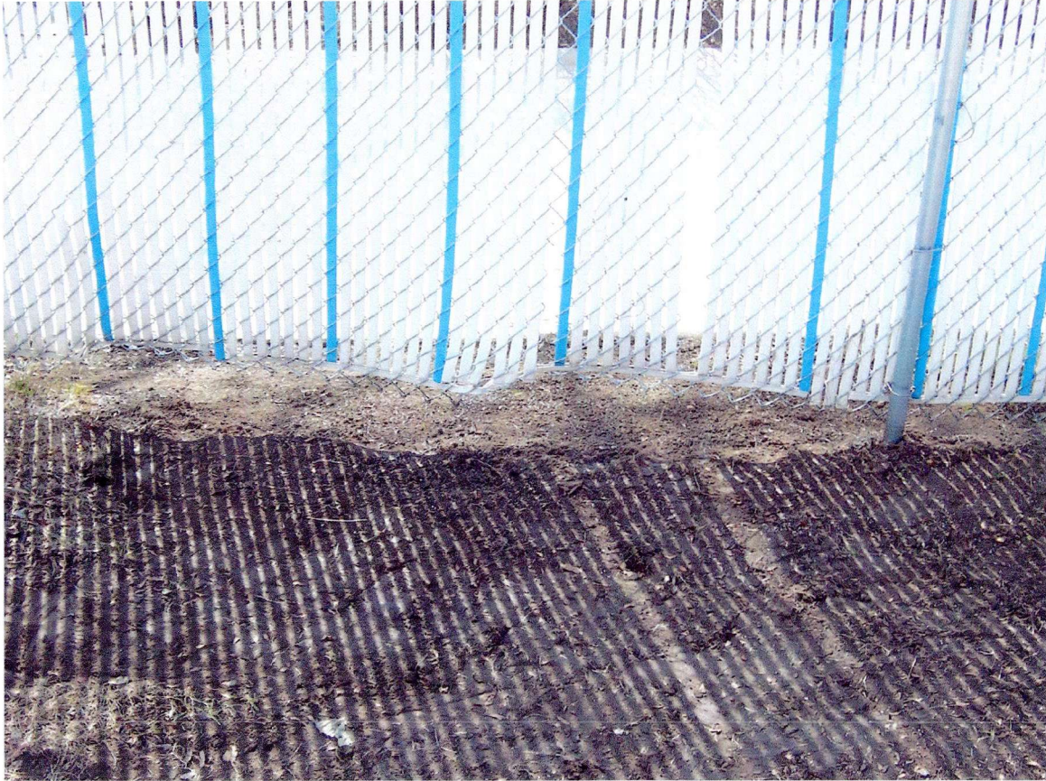
Figure 5: Lawn area under and past the fence following the clean up.