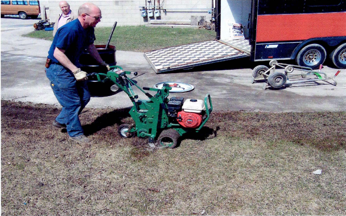
Figure 3: Sod cutter removing stained grass.