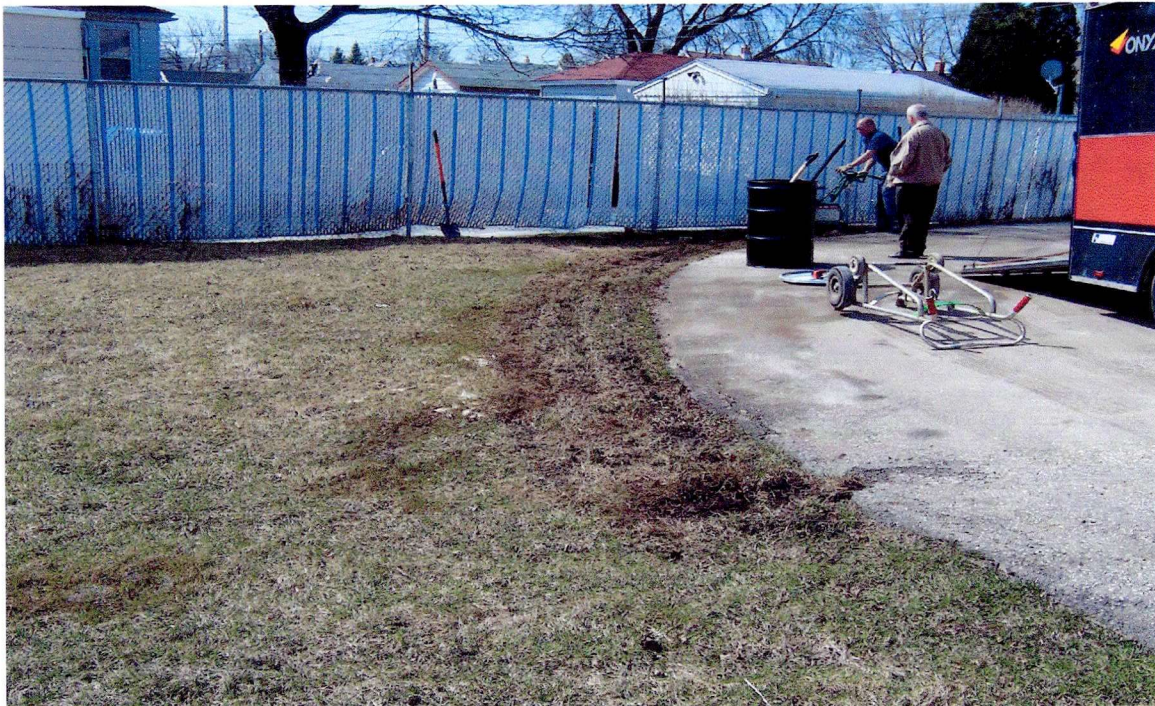
Figure 2: Impacted lawn area.

Onyx Special Services, Inc. PO Box 367 N104 W13275 Donges Bay Road Germantown, WI 53022 Tel: 262.236.8130 Fax: 262.236.8140