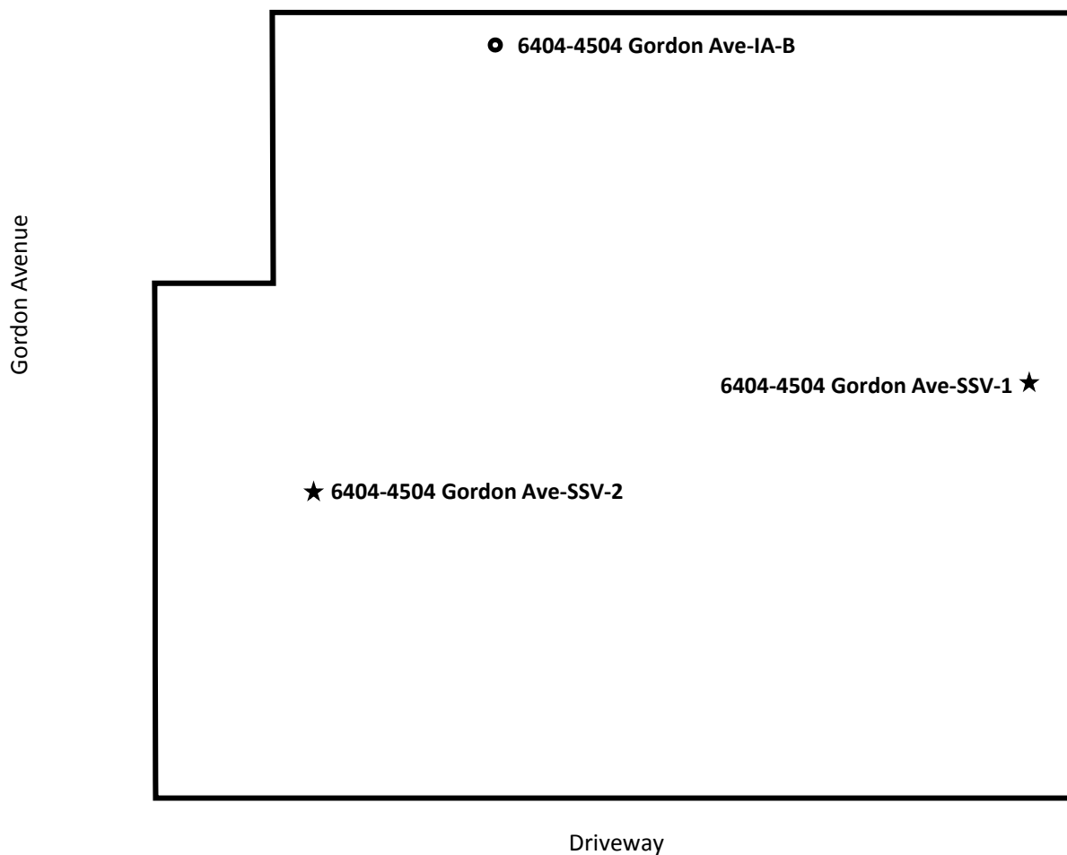
FIGURE 1 VAPOR INTRUSION SAMPLE LOCATIONS 4504 Gordon Avenue, Monona, Wisconsin