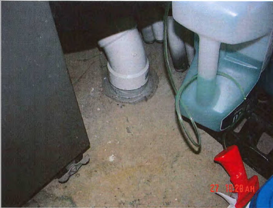
Title: Holiday Village Coin Laundry/0230553765/07272016/Piping sealed suction pint

{Click to Add/Edit Image File (*.bmp;*.jpg;*.gif;*.png;*.tif)}