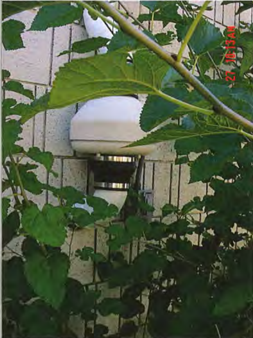
Title: Holiday Village Coin Laundry/0230553765/07272016/Radonaway RP145 Blower