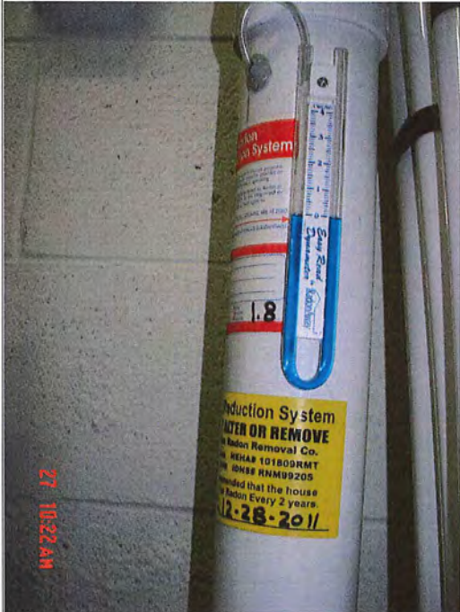
Title: Holiday Village Coin Laundry/0230553765/07272016/Vapor System Vacuum gauge