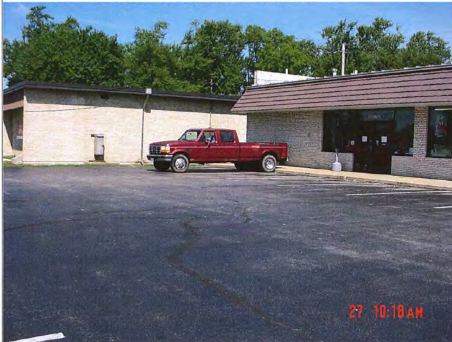
Title: Holiday Village Coin Laundry/0230553765/07272016/Front of building cover