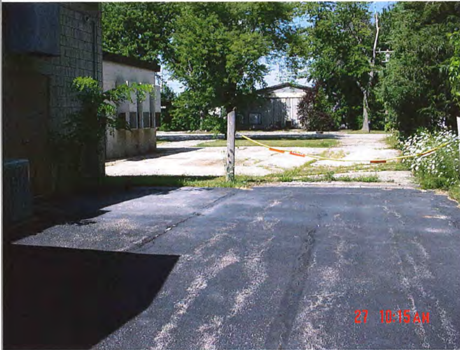
Title: Holiday Village Coin Laundry/0230553765/07272016/Back of building and neighboring property cover

{Click to Add/Edit Image File (*.bmp;*.jpg;*.gif;*.png;*.tif)}