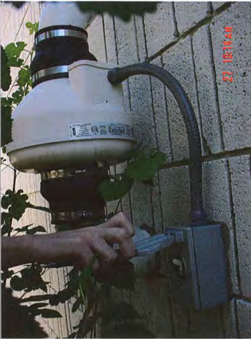
Title: Holiday Village Coin Laundry/0230553765/07272016/Radonaway RP145 Blower and outdoor switch

{Click to Add/Edit Image File (*.bmp;*.jpg;*.gif;*.png;*.tif)}