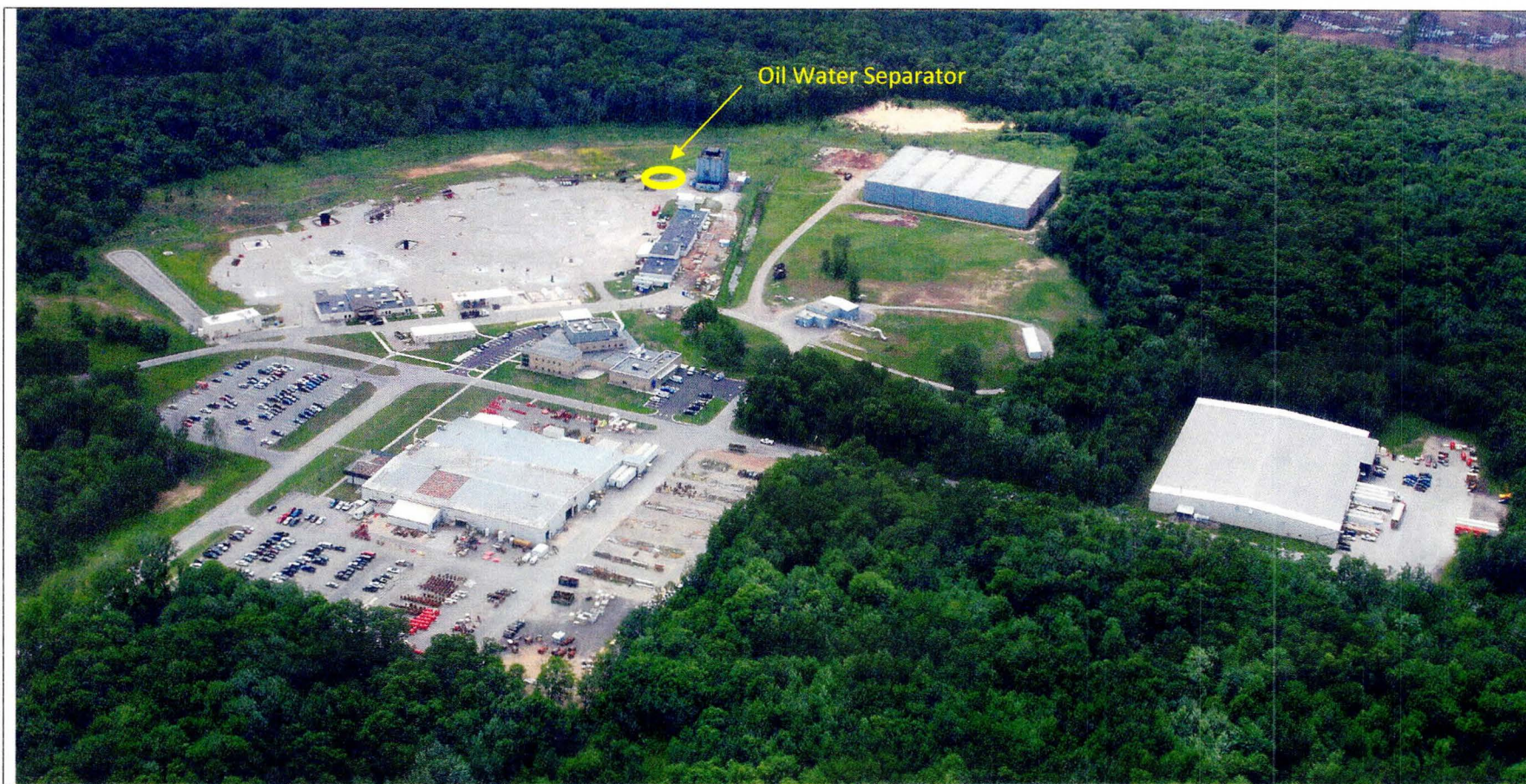
Figure 1: Oil Water Separator Location at 2700 Industrial Parkway