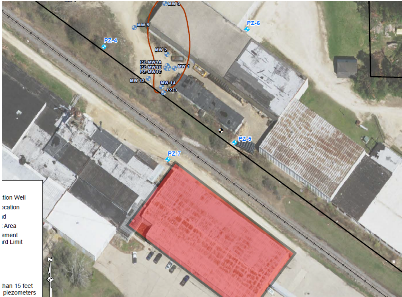
FV Steel - Red shaded exhibit.png