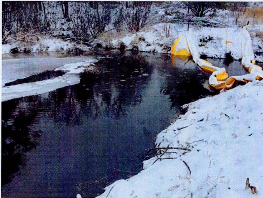
Turbidity Barrier downstream of hydraulic oil release