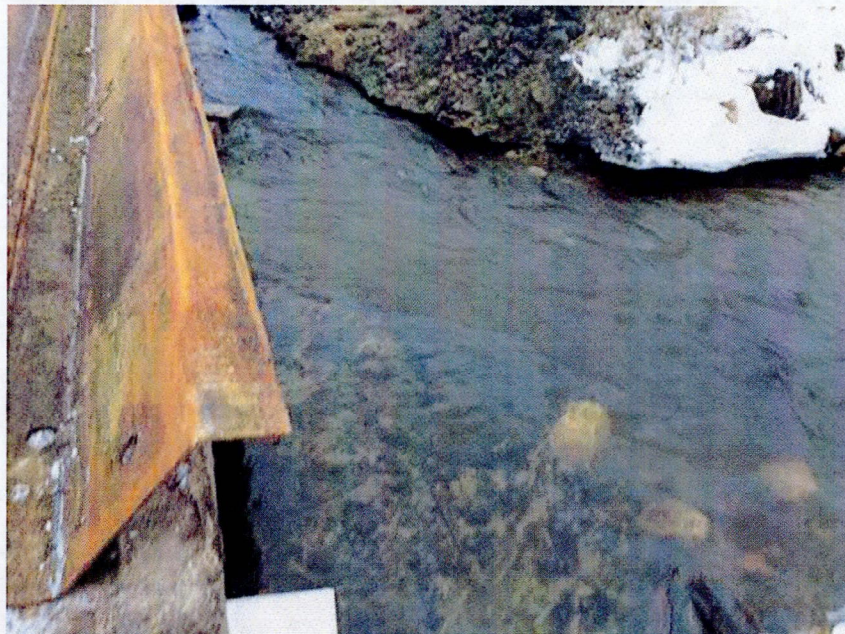
Slight Sheen visible downstream of hydraulic oil release