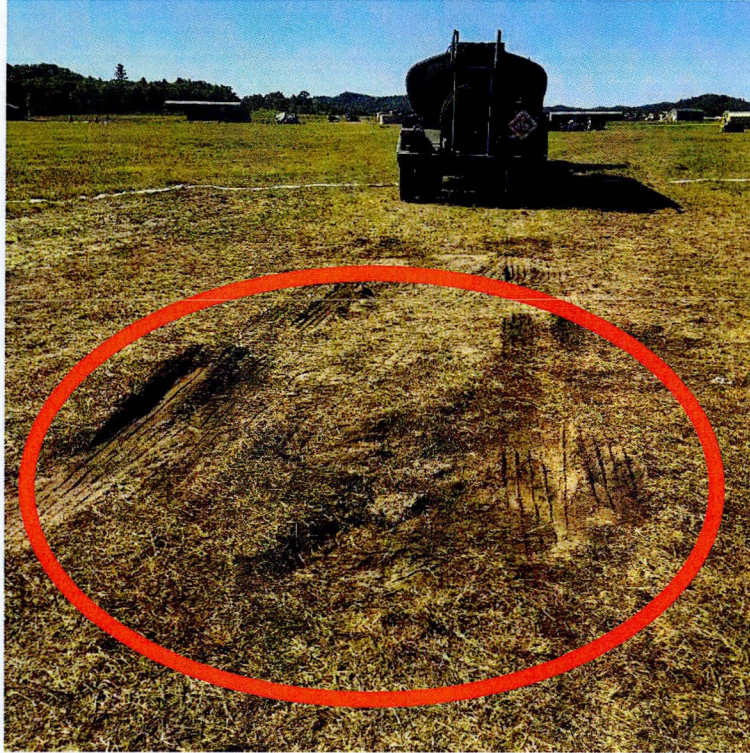
Figure 1: Facing South