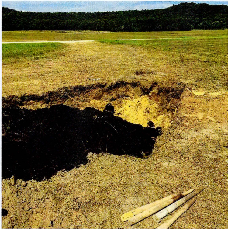
Figure 2: Hole getting back-filled