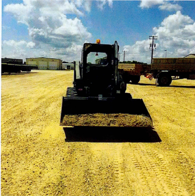
Figure 1: Excavated Soil