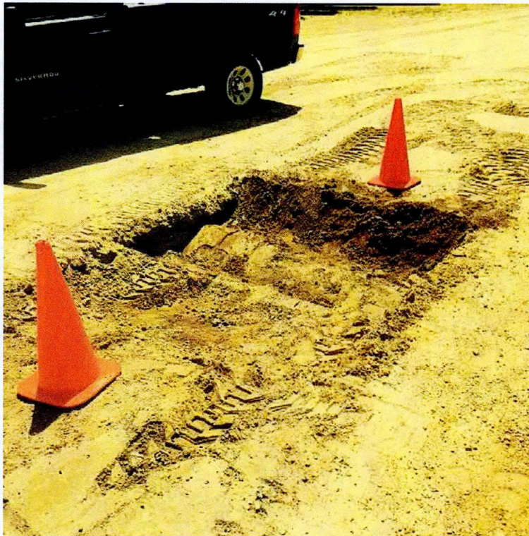
Figure 2: Hole from excavation awaiting to be back-filled: