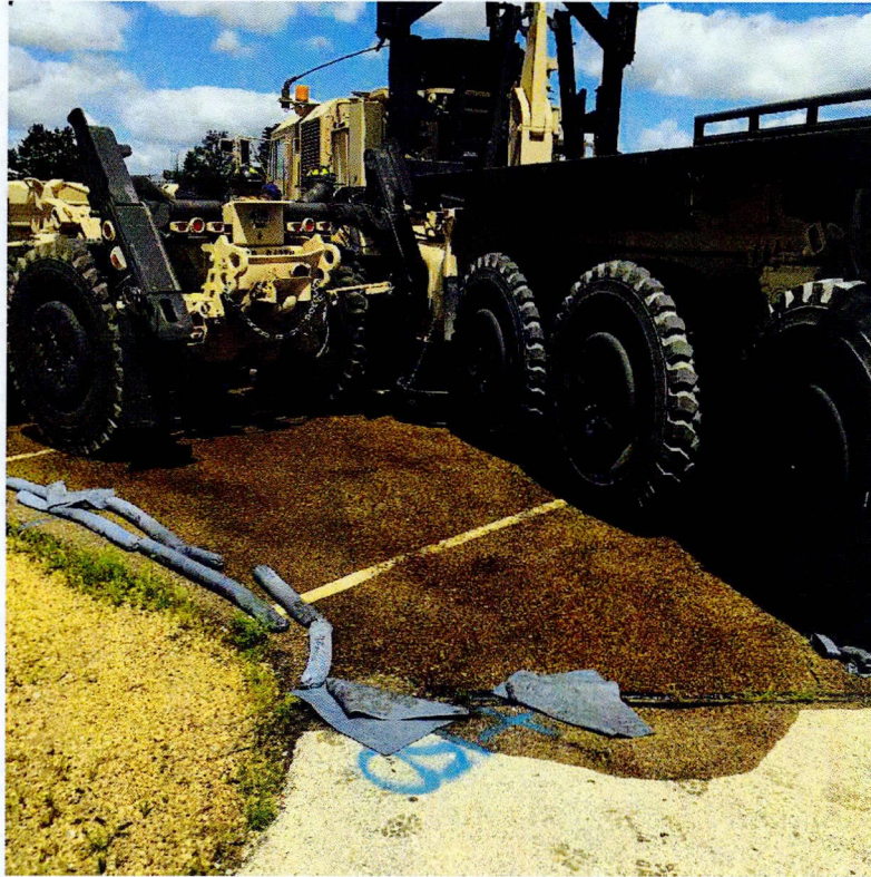
Figure 1: Facing North