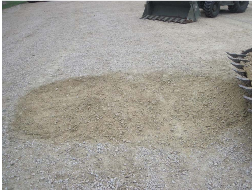
Figure 1: Facing West