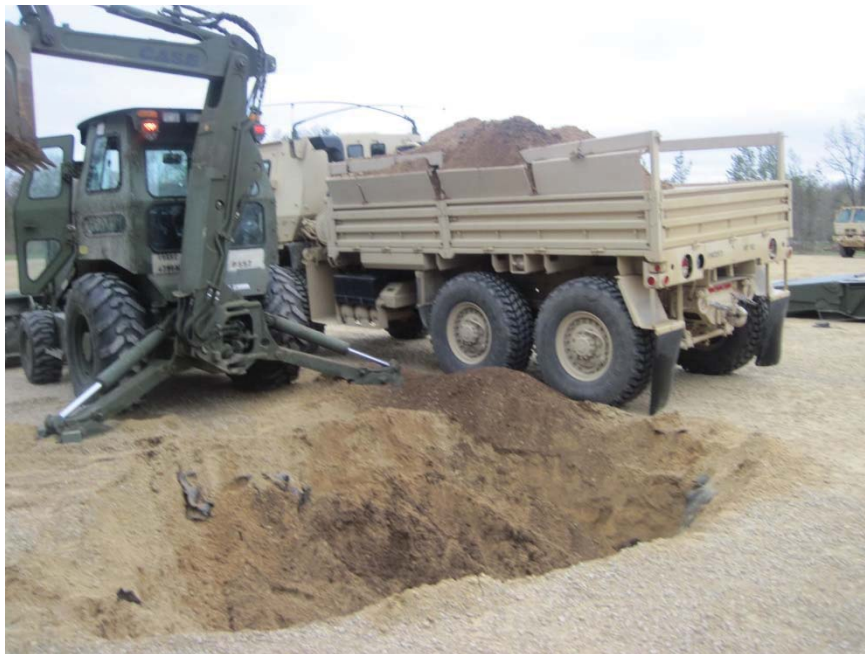
Figure 2: Facing Northwest