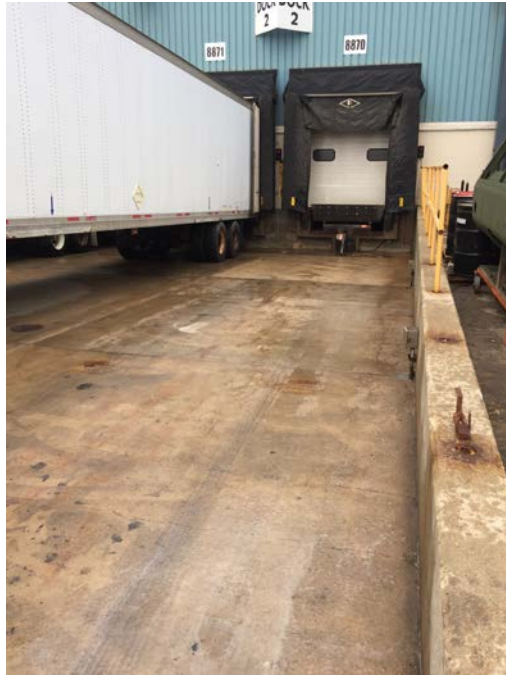
Figure 6. Cleaned concrete after the removal of contaminated stormwater.