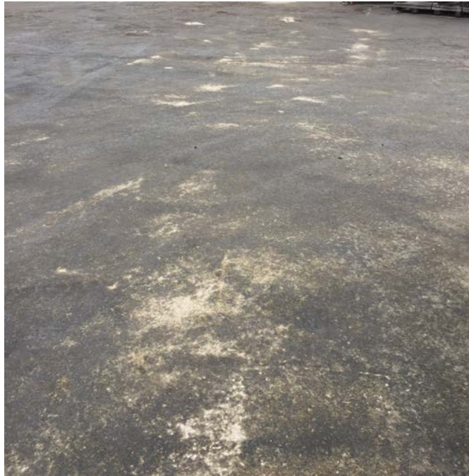
Figure 5. Cleaned asphalt after the used oil spill.