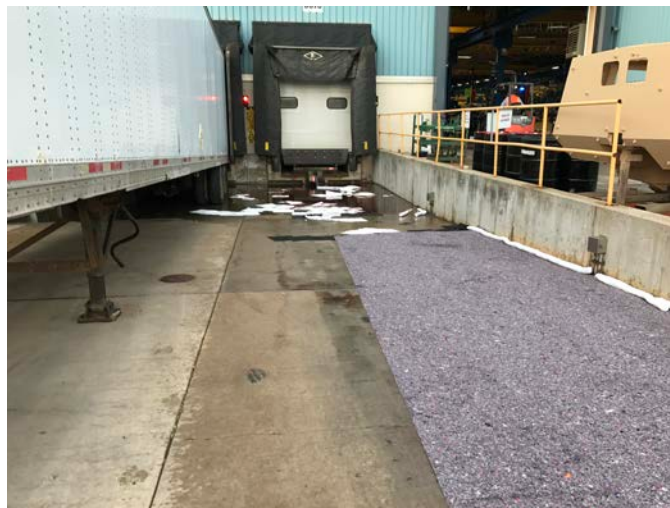
Figure 3. Used oil spill along concrete and stormwater at Dock 2.