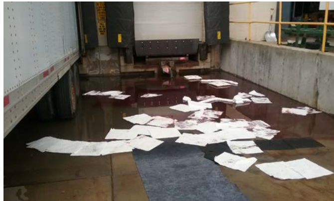
Figure 2. Contaminated stormwater in Dock 2 bay.