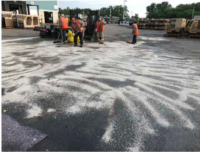
Figure 4. Distribution of granular oil absorbent at Dock 2.