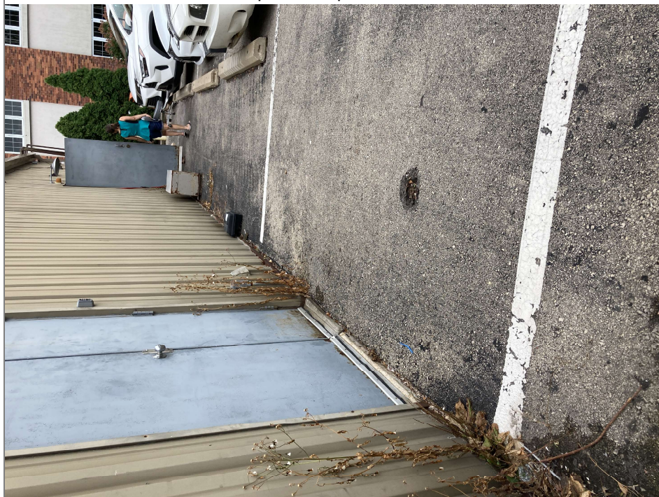
Title: Back of subject unit