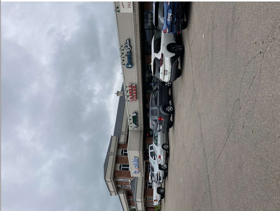
Title: Front view of subject property (current tenant is a vape & cigar shop)