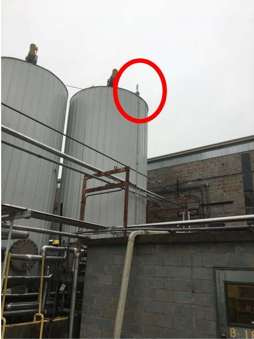
Photo showing vent pipe on blend tank 3.