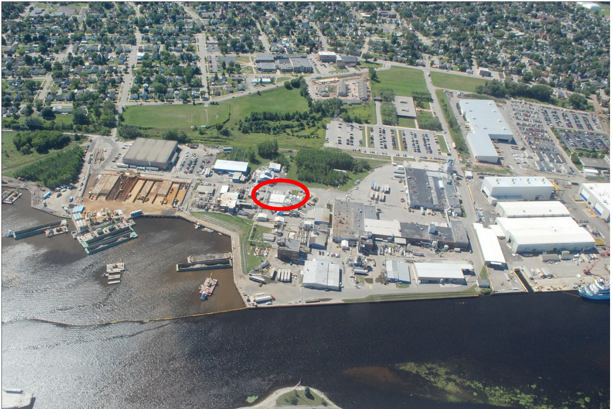
Site Figure showing location of tank overfill at One Stanton St, Marinette, WI.