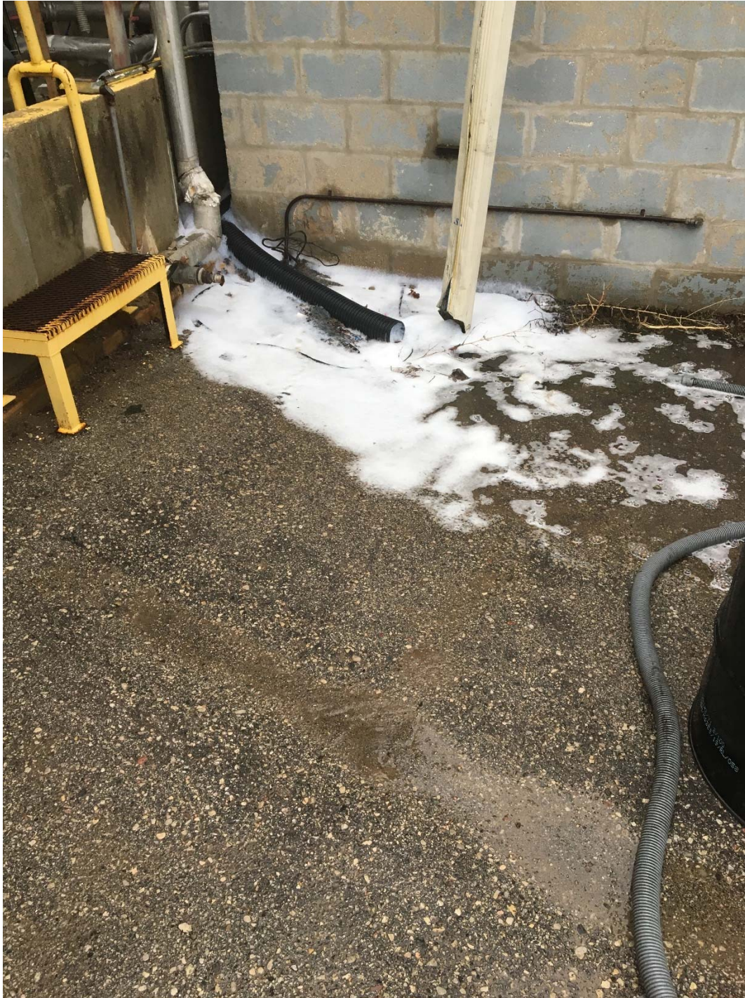
Photo showing roof drain from B18 into industrial sewer.