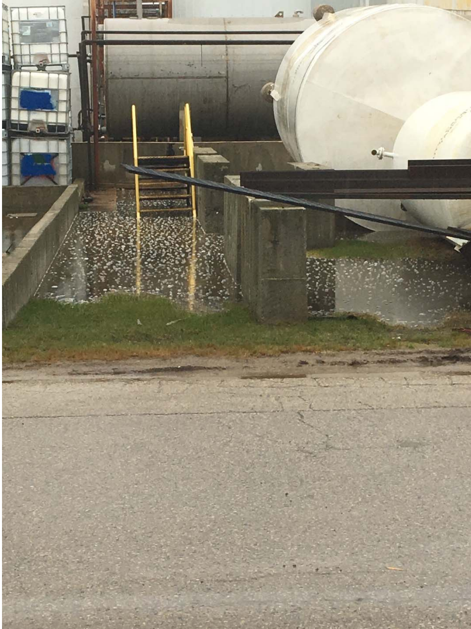
Photo showing grassy area south of containment which was impacted by spill.