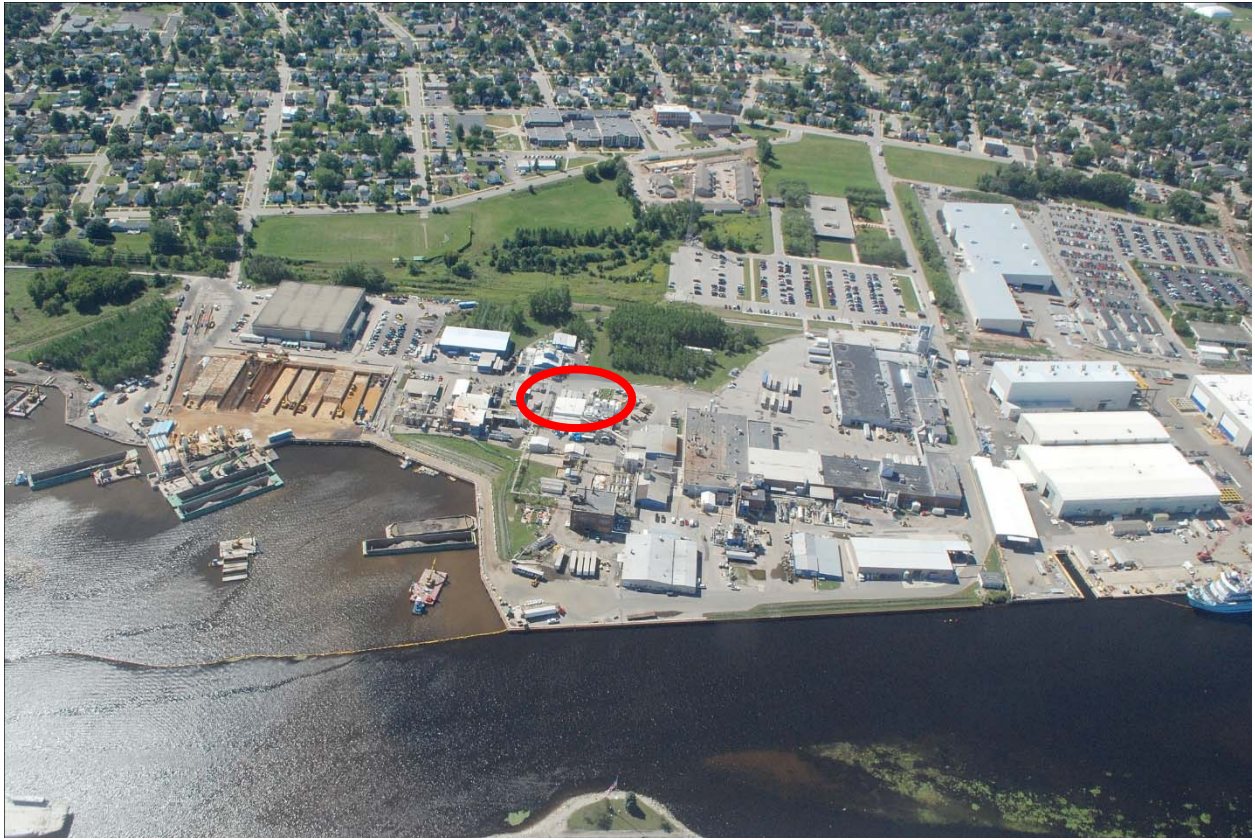
Site Figure showing location of tank overfill at One Stanton St, Marinette, WI.