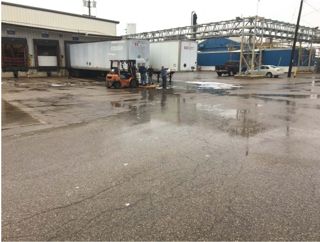
Photo showing material draining across B18 dock area to additional industrial sewer catch basin which was blocked off.