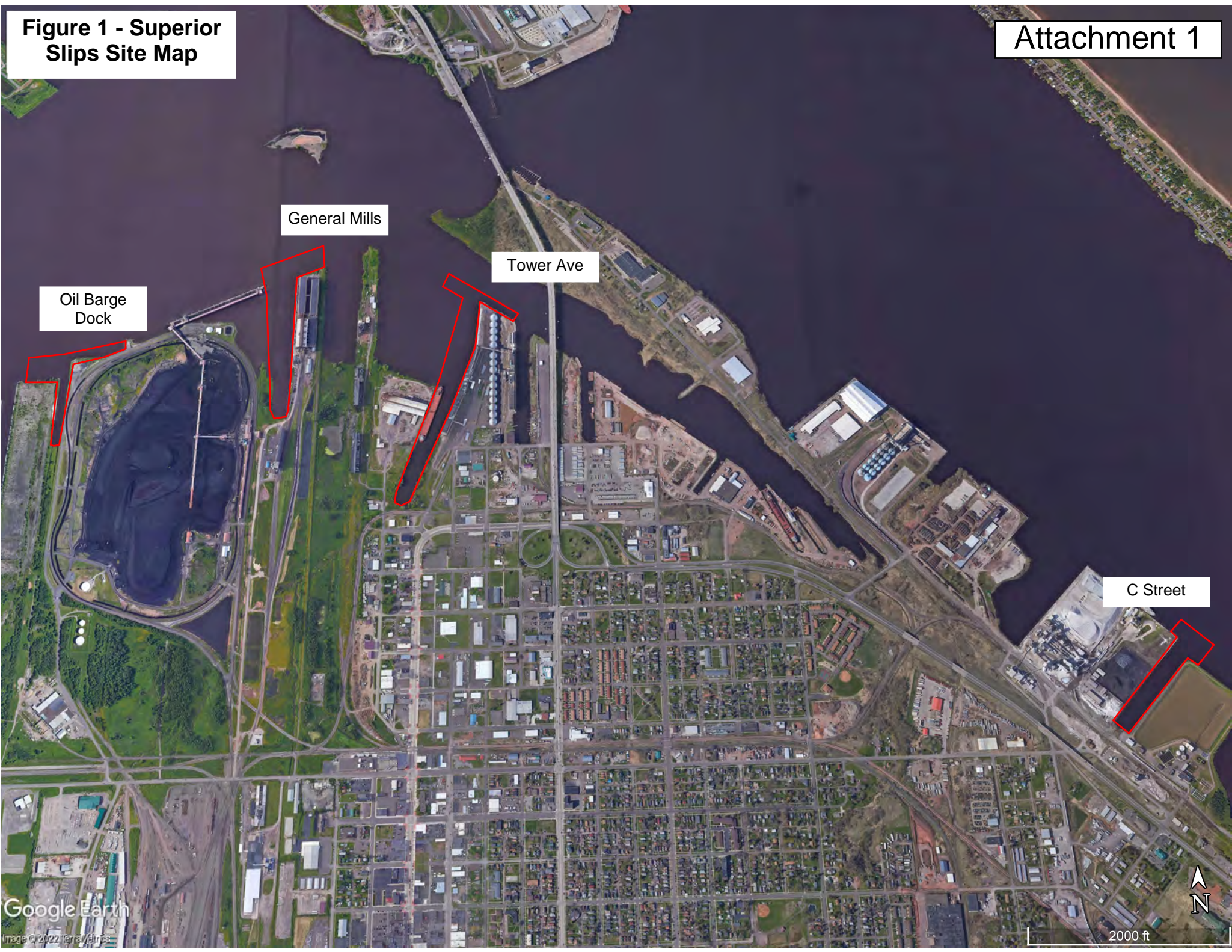
Figure 1 - Superior Slips Site Map