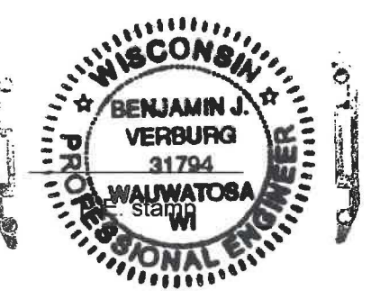
Signature, Title and P.E. Number