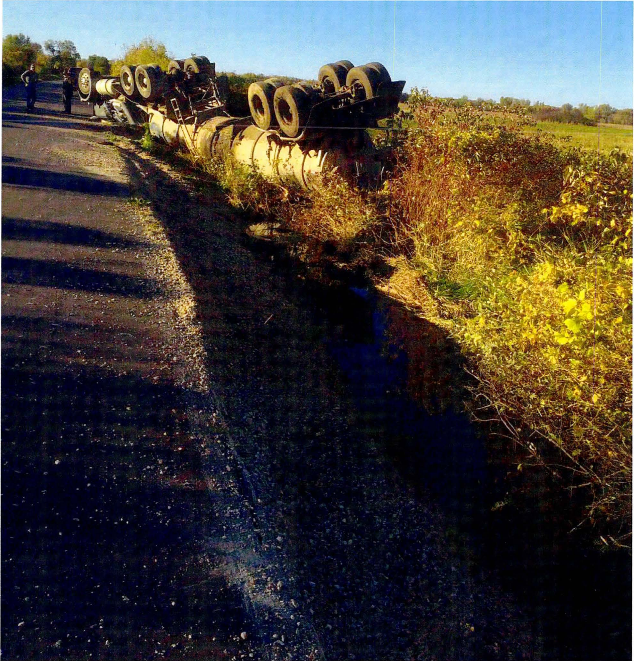
Spill before cleanup.