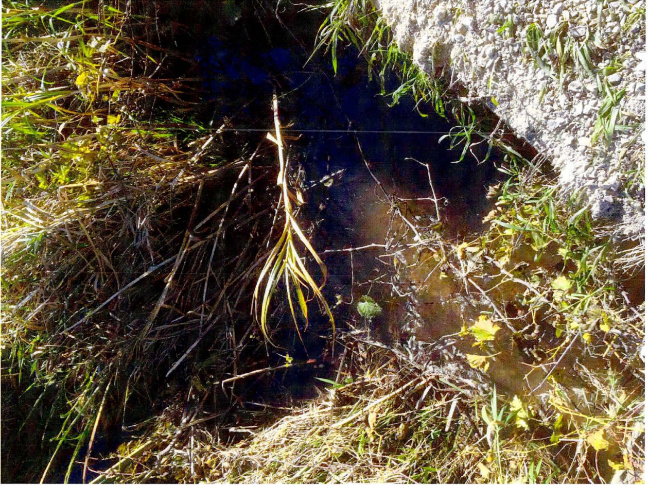
Clean water in ditch after second flush.