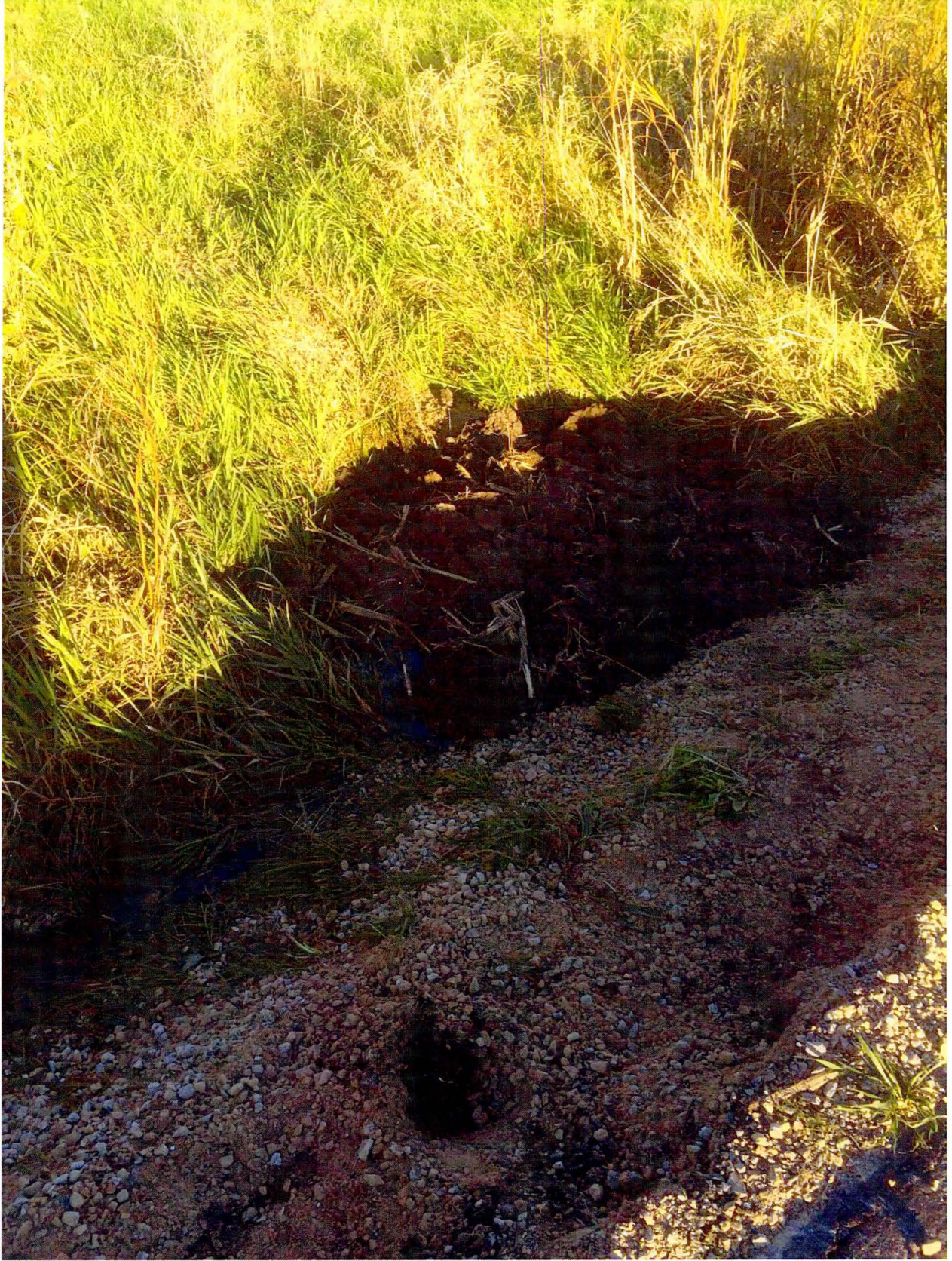
Earthen dam in ditch.