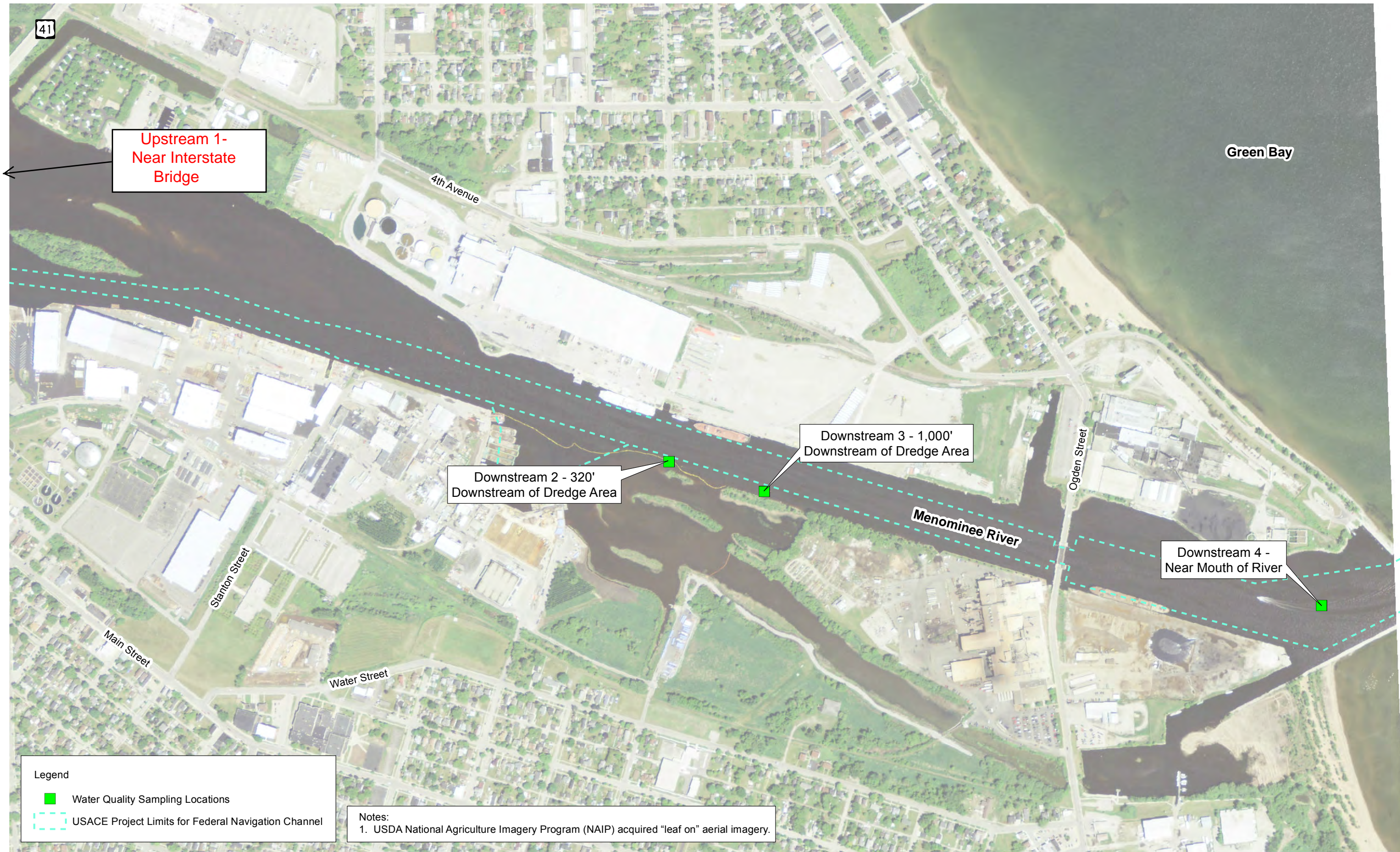
Figure 2 Water Quality Sampling Locations Tyco Fire Products LP Facility Marinette, WI