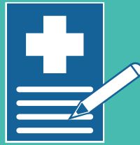
establishing PFAS health standards for drinking water, groundwater and surface water