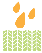
stain-resistant carpet & fabric

PFAS are a group of human-made chemicals used for decades in numerous products.