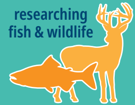
researching fish & wildlife