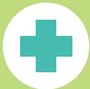
certain types of cancers

PFAS persist in the environment and the human body for long periods of time. Recent findings indicate that exposure to certain PFAS may have harmful health effects in people.