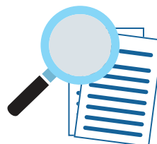
Learn More About PFAS Health Risks dnr.wi.gov/u/?q=175