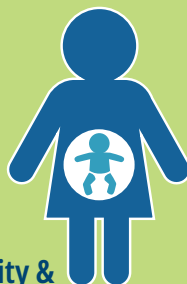
infertility & low birth weight