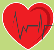
thyroid & heart issues