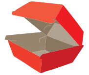
fast food packaging