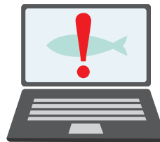
Check State Fish Advisories dnr.wi.gov/u/?q=176