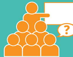
listening & feedback sessions