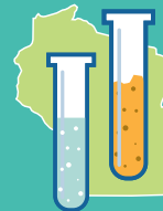
soil & water testing