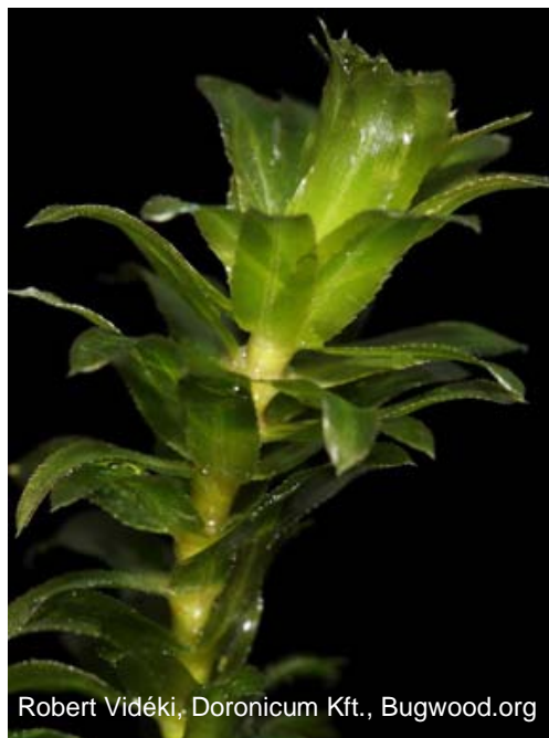
Close up of Hydrilla stem