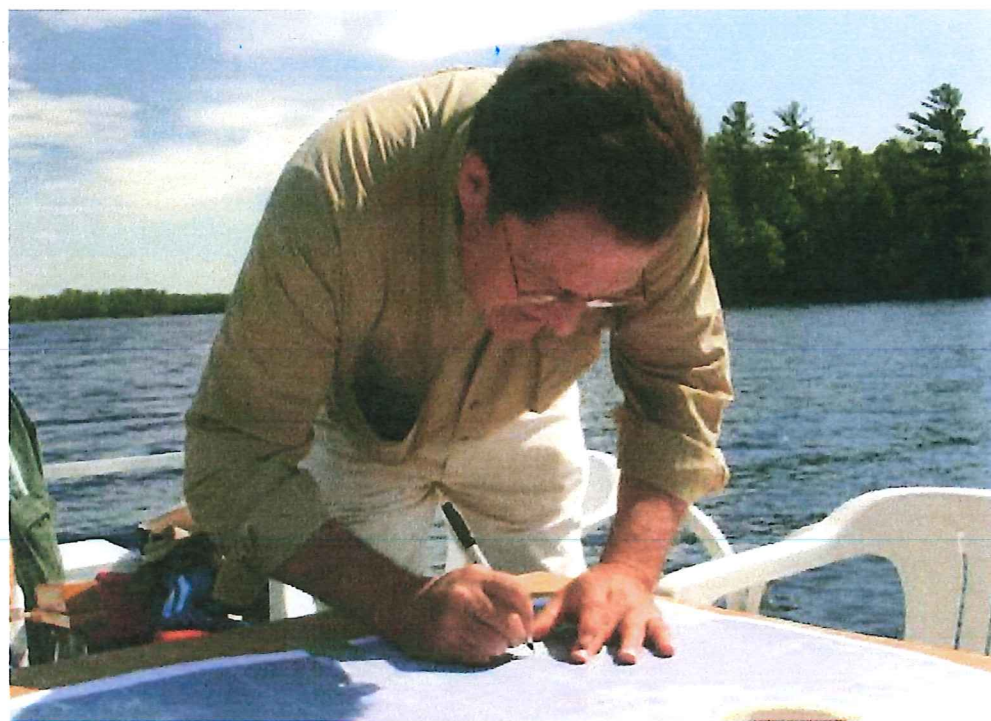
Figure 3. Citizen scientists document the ecological and aesthetic indicators of Moose Lake on hard copy maps and note books.

the map on pre-settlement vegetation and noting Wisconsin's forest cutover in the 1920s and '30s and the soil moisture conditions in the area. "The climax species for this area are sugar maple, yellow birch, and hemlock. The conditions of the forest are naturally allowing the transition from white birch, to white pine and ultimately the climax species for the