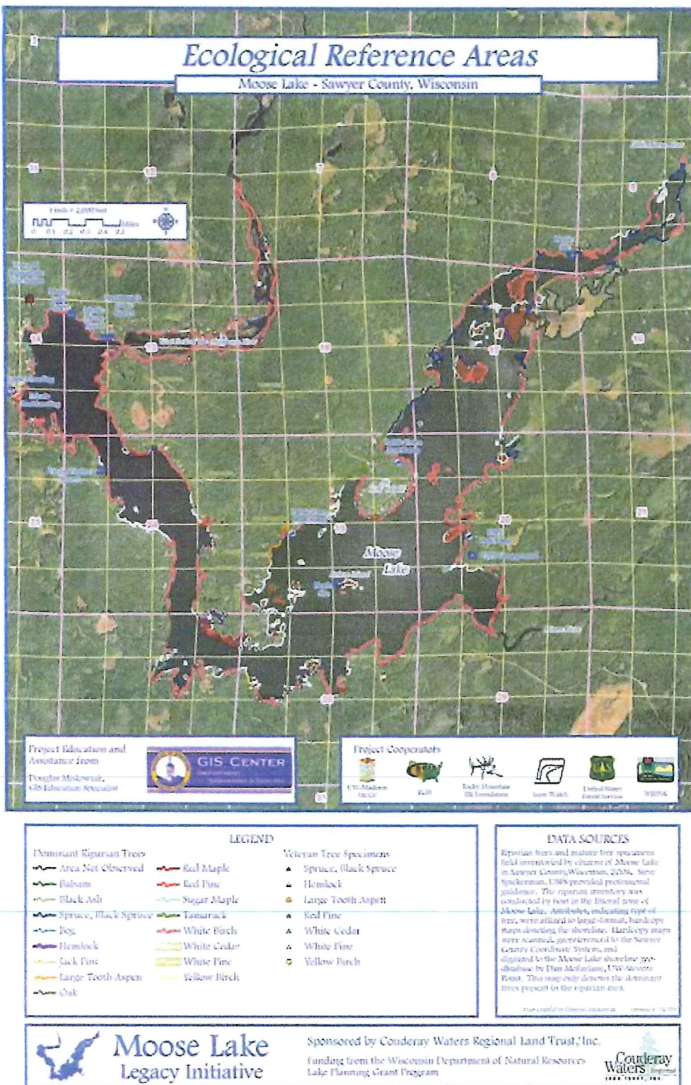
Figure 6. A finished inventory map documenting ecological reference areas.