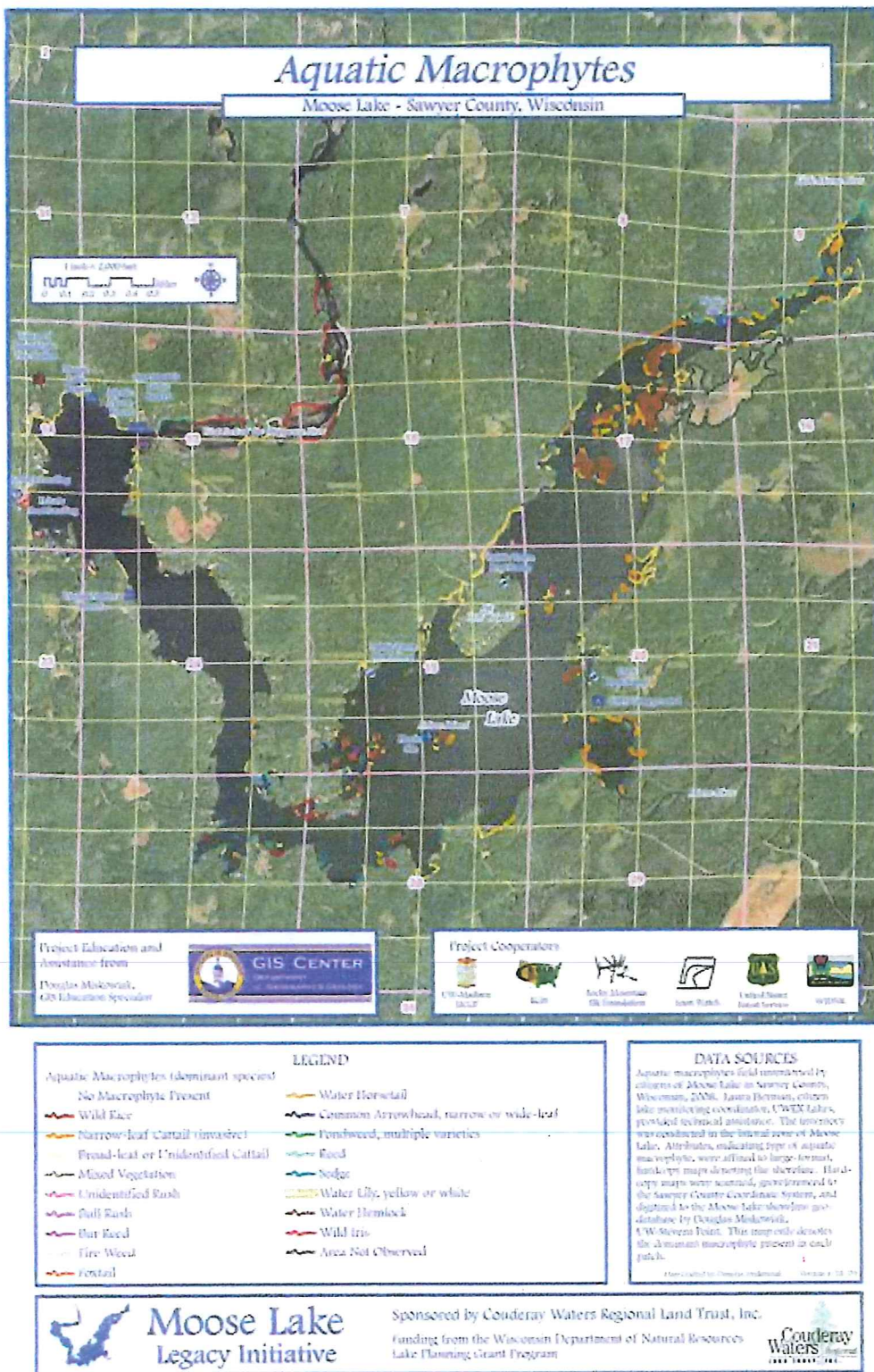
Figure 5. A finished inventory map documenting occurrences of aquatic macrophytes. Table 1 lists the various inventories and corresponding maps.

The conversation continued for almost two hours and was recorded on flip charts. Each shoreline was rated on a scale from absolute priority, high priority, moderate priority, low priority, to not considered for conservation , based