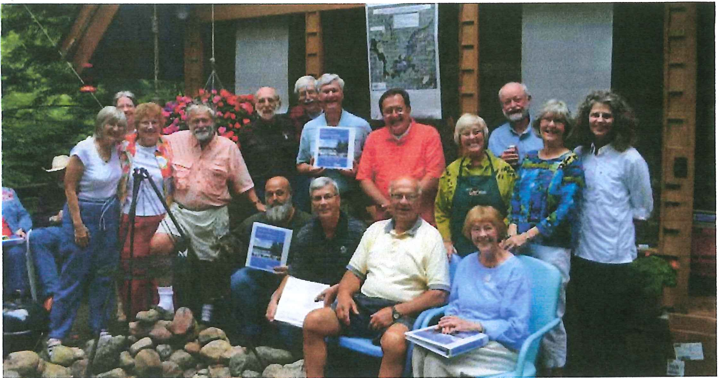
Figure 1. Citizen contributors of Moose Lake gather to celebrate completing the Moose Lake Legacy Initiative final report.

organizations were not actively aware that they owned, but were responsible for managing. Citizens also alerted managers to more reason for concern. Inventories were beginning to reveal the significance of Moose Lake for harboring unique, rare, and endangered species. Inventories noted the presence of white cedar, increasingly rare due to heavy browsing by white-tailed deer. They also noted competition between cattails and the culturally significant wild rice.