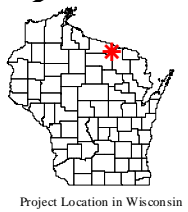
Project Location in Wisconsin

Sources: Roads & Hydro: WDNR Aquatic Plants: Onterra, 2015 Orthophotography: NAIP 2013 Bathymetry: Onterra, 2014 Map date: June 22, 2015