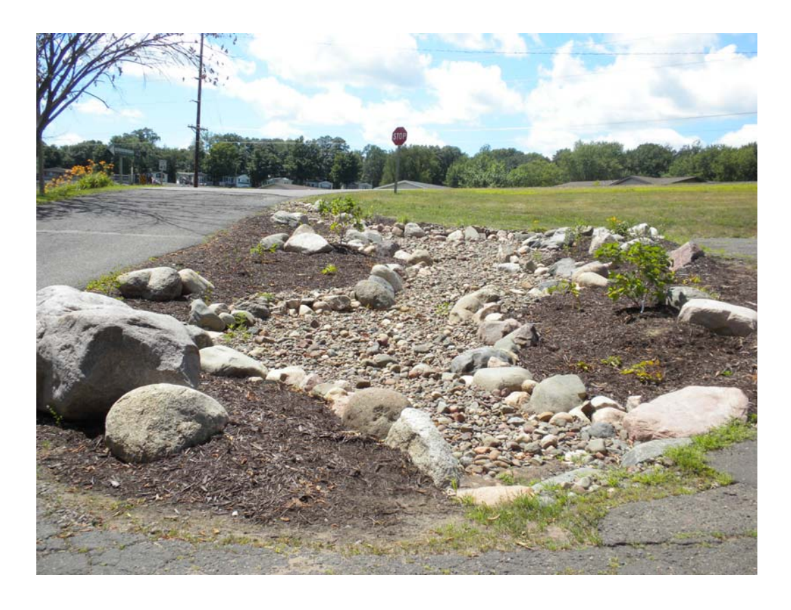
Balsam Lake Highway 46 Landing Rock Infiltration Pit. The diversion across the road was installed in 2013.

Many projects have been installed under the BLPRD waterfront runoff project. They include 5 shoreland buffers, 5 rain gardens, and 7 rock infiltration pits. All of these projects were installed from 2009-2013. An example project at the Village of Balsam Lake boat landing is a rock infiltration pit installed in 2012 shown in the photo below. ( Point G2 )