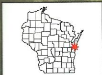
Project location shown in red.