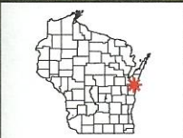
Project location shown in red.