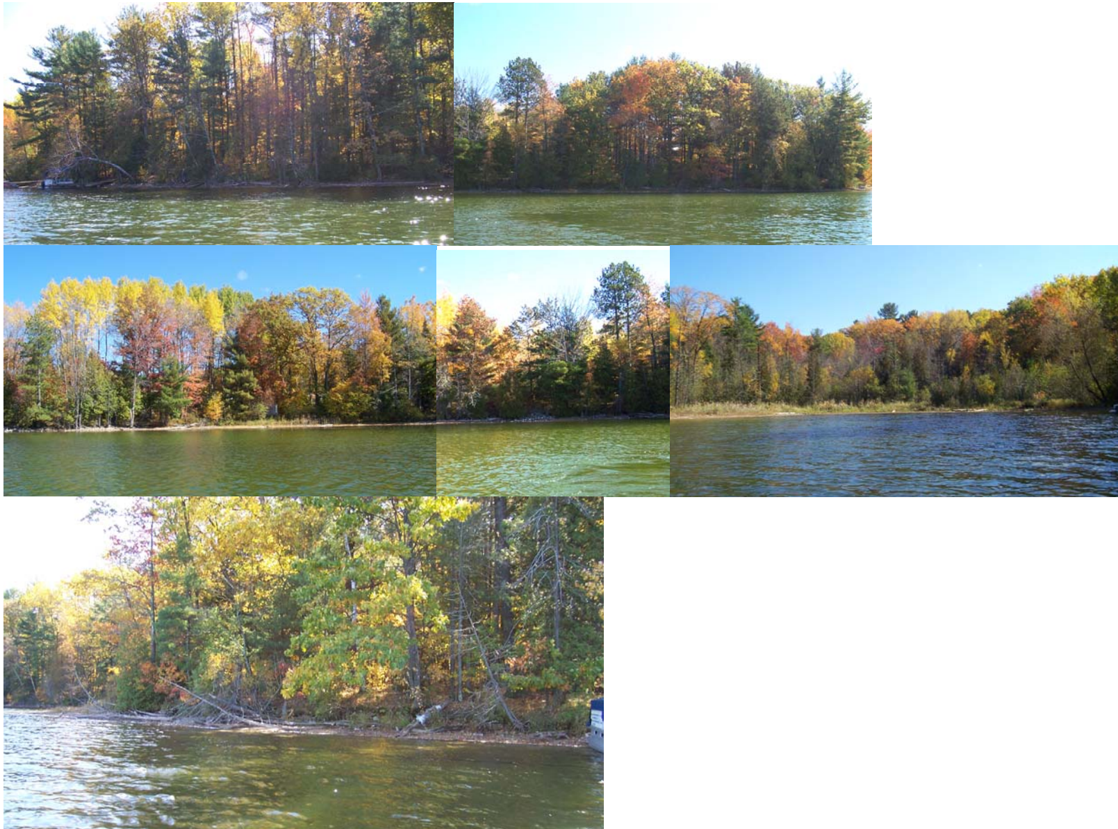
Figure 4. Wadley Lake Critical Habitat Area 2: Southeast Bay.