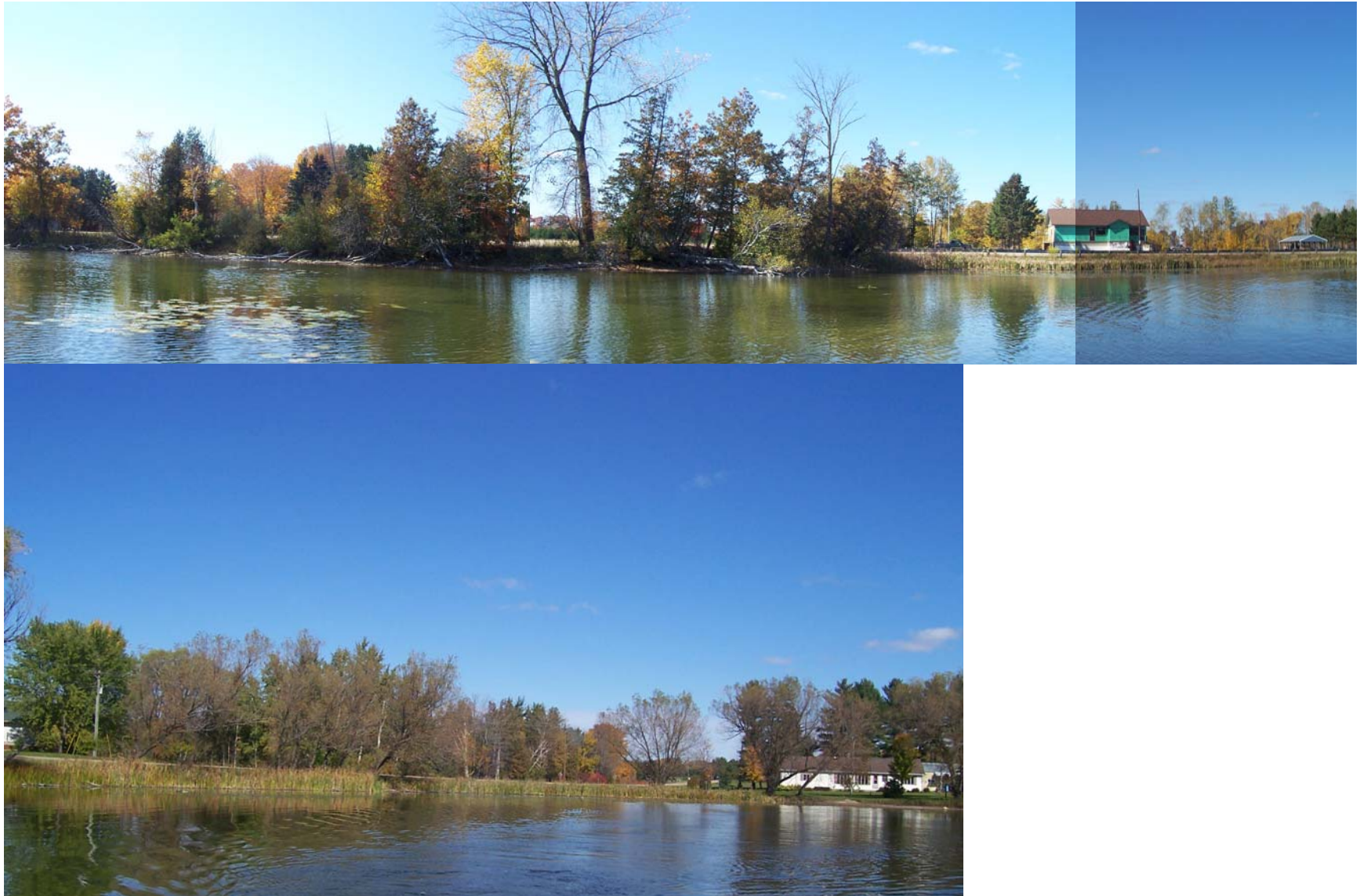
Figure 5. Wadley Lake Critical Habitat Area 3: West Shore