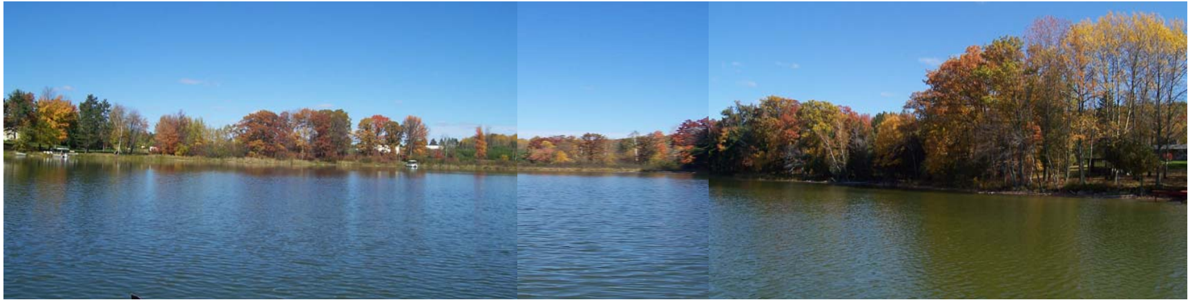
Figure 3. Wadley Lake Critical Habitat Area 1; Northeast Bay