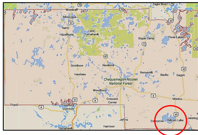
Figure 2. Map of Oneida County, WI with the approximate location of Pelican Lake circled in red.