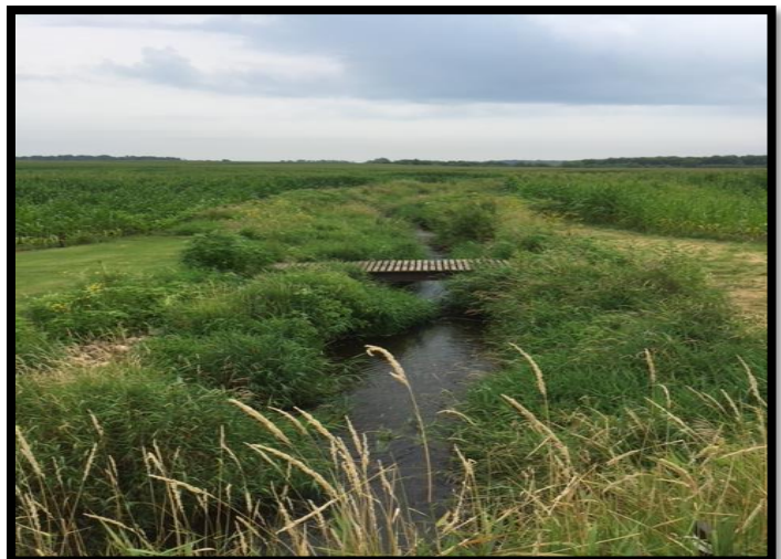
Unnamed Tributary to Beaver Creek (836550)