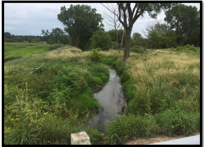
Beaver Creek at CTH A.

This tributary to Beaver Creek in the Beaver Dam River Watershed, Assessments during the 2020 listing cycle showed new bug sample data were in fair condition; however, a single fish sample was in poor condition. This water is currently considered in fair health and future monitoring is recommended.