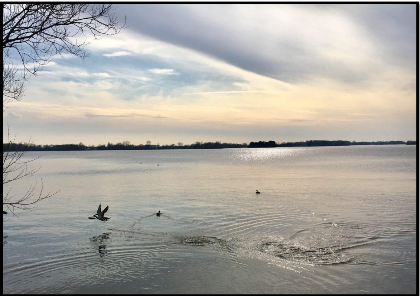
Beaver Dam Lake. Photo courtesy of Daily Dodge, May 6, 2019. Article, “Carp Removal Program Suspended on Beaver Dam Lake, Program’s Future Uncertain.”

https://dailydodge.com/carp-removal-program-suspended-on-beaver-dam-lake-programs-future-uncertain/