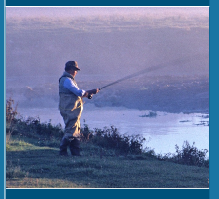
PUBLIC HEALTH & WELFARE