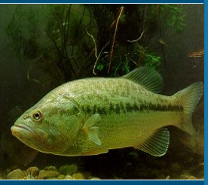
FISH & AQUATIC LIFE