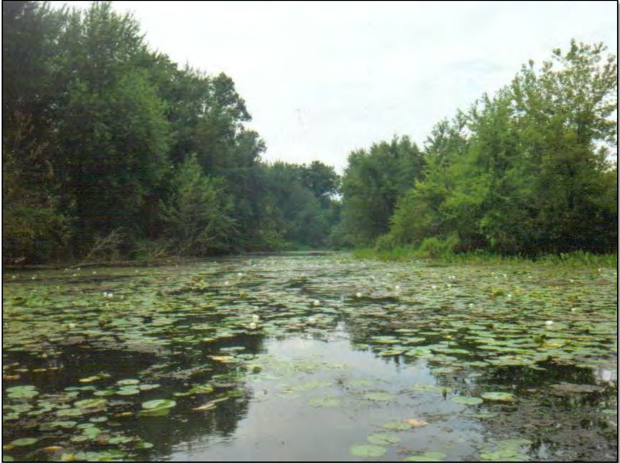
Norton Slough 2008

fish species distributions, particularly SGCN, and collect basic information on water quality and habitat. Through 2010 the vast majority of oxbows displayed the pristine conditions that we observed working at DNR through 2004. The 2008 Norton Slough photo below is an example of typical oxbow spring lakes found along the Lower Wisconsin Riverway at that time.