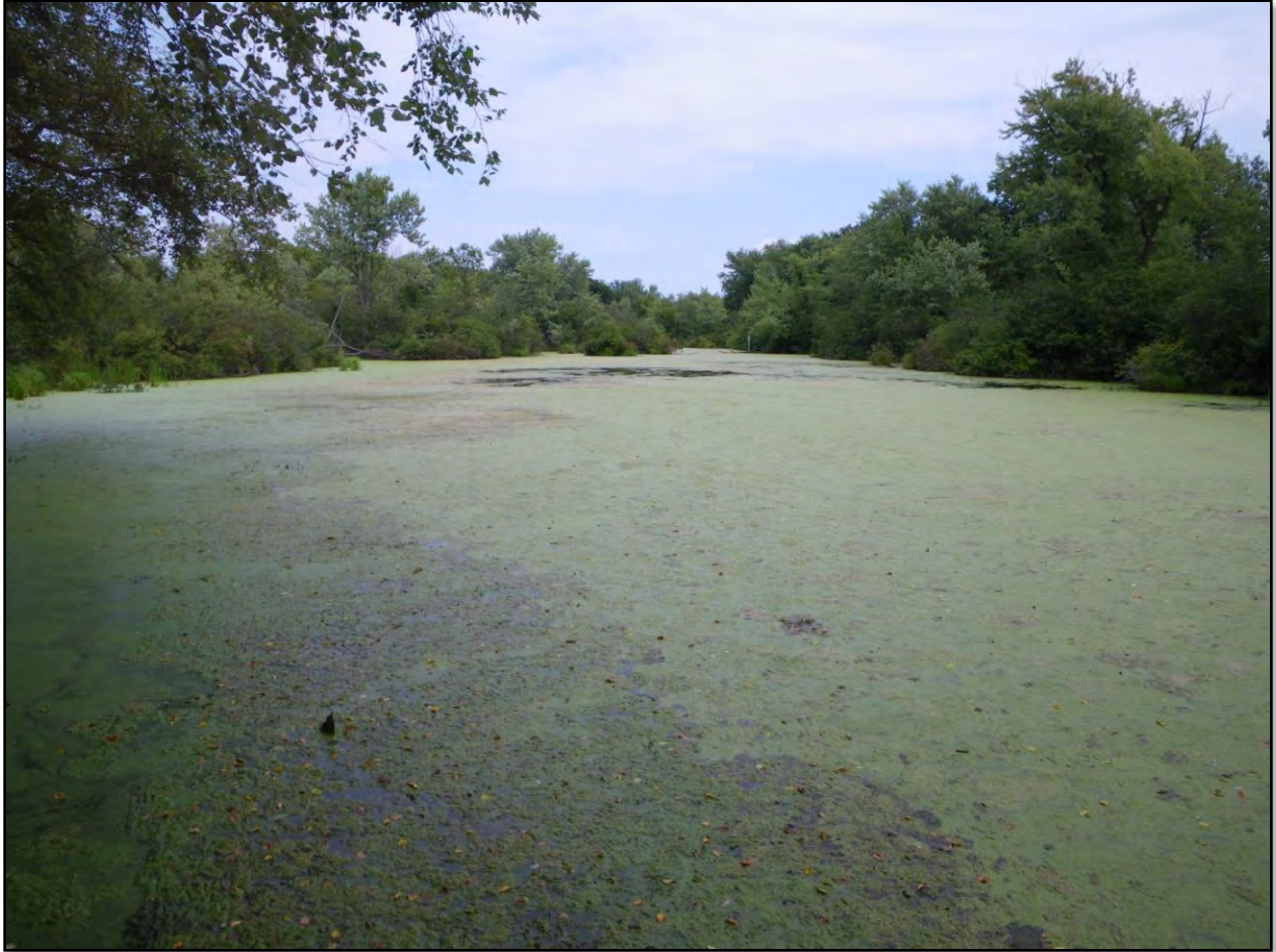
Norton Slough 2011

Several of us from WDNR Southern Region sampled fish populations in Jones Slough in 2003-04 for fish. We had found numerous State Endangered starhead topminnows, mud darters, Iowa darters, and lake chubsuckers in this oxbow lake that we considered pristine. However, by 2008 the oxbow was becoming more degraded and by 2011 completely covered with floating mats of duckweeds and filamentous algae. Vertical profiles demonstrated loss of photosynthesis and anoxia in the next photo with profile attached. The water temperature profile demonstrates the discharge of groundwater from the Pleistocene sand terrace with a small open water section visible in an otherwise oxbow choked by floating mats. No darter species have been found in the oxbow since 2004 that may have perished due to anoxia below the floating mats or direct nitrate nitrogen toxicity (Camargo et al. 2005).