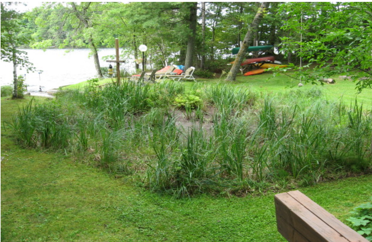
8/25/2017 property 4400 "before" – nearly 1000 square feet of mature YFI