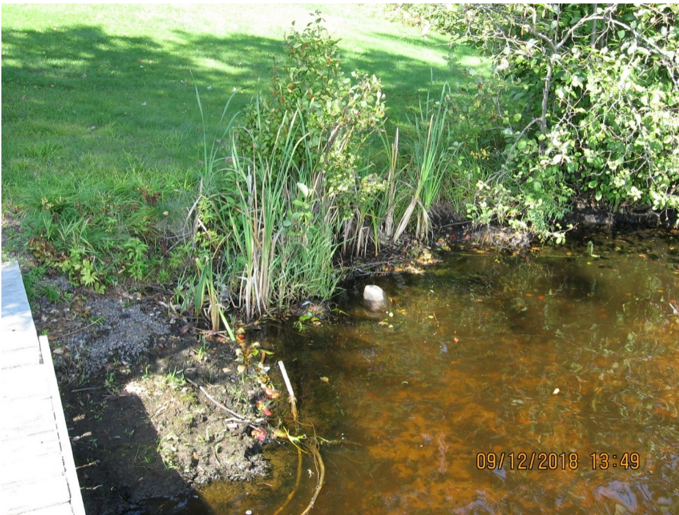
9/12/2018 Property 8900 north side of old dock prior to further spray treatment this date. Small YFI was still emerging from the rhizome mass.