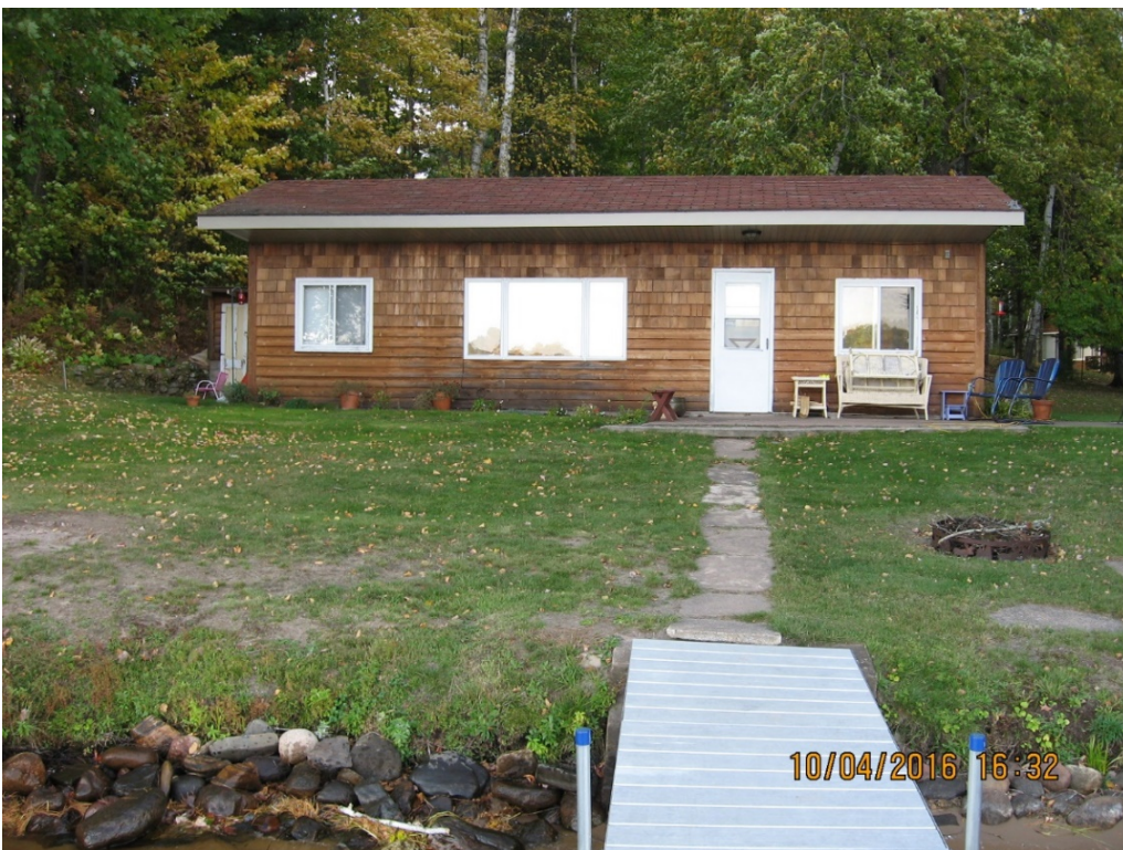
10/4/2016 Property 9200 "after" homeowner herbicide spraying