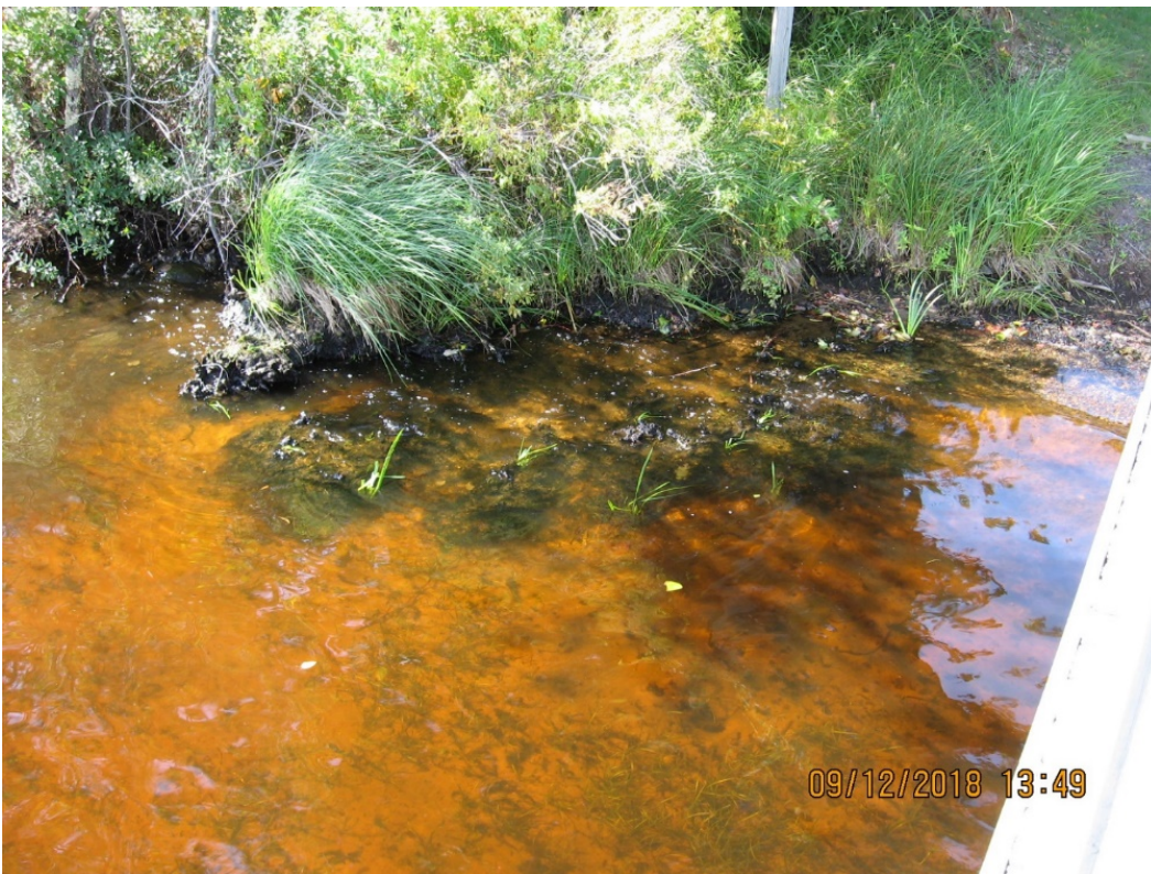
9/12/2018 Property 8900 south side of old dock prior to spray retreatment this date