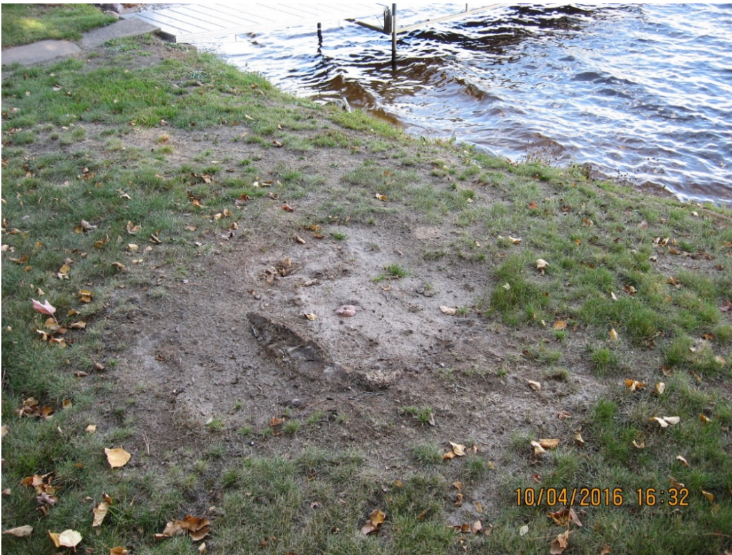
10/4/2016 Property 9200 “after” private herbicide spraying – YFI has been eradicated along with other vegetation