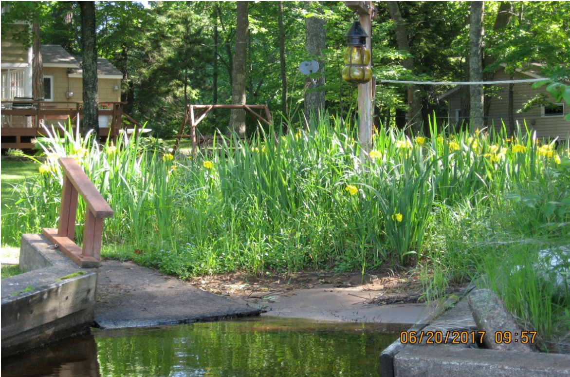
6/20/2017 Property 4400 "before"