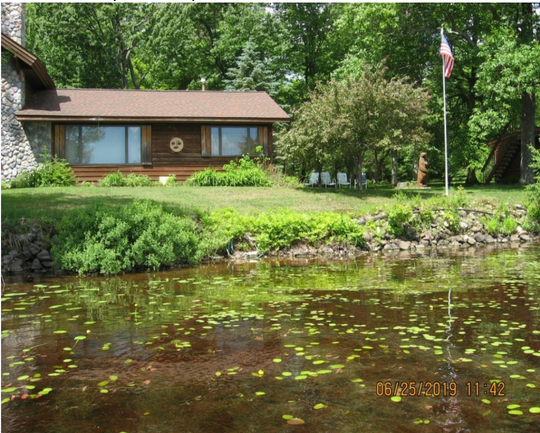
6/25/2019 Property 0200 “after” spraying in 2016 and respray in 2017– YFI has been largely eliminated and remained so in 2020.