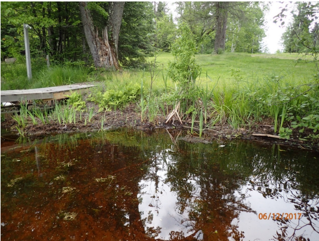
6/12/2017 Property 8900 north side of old dock "after" wipe on glove treatment 9/14/2016