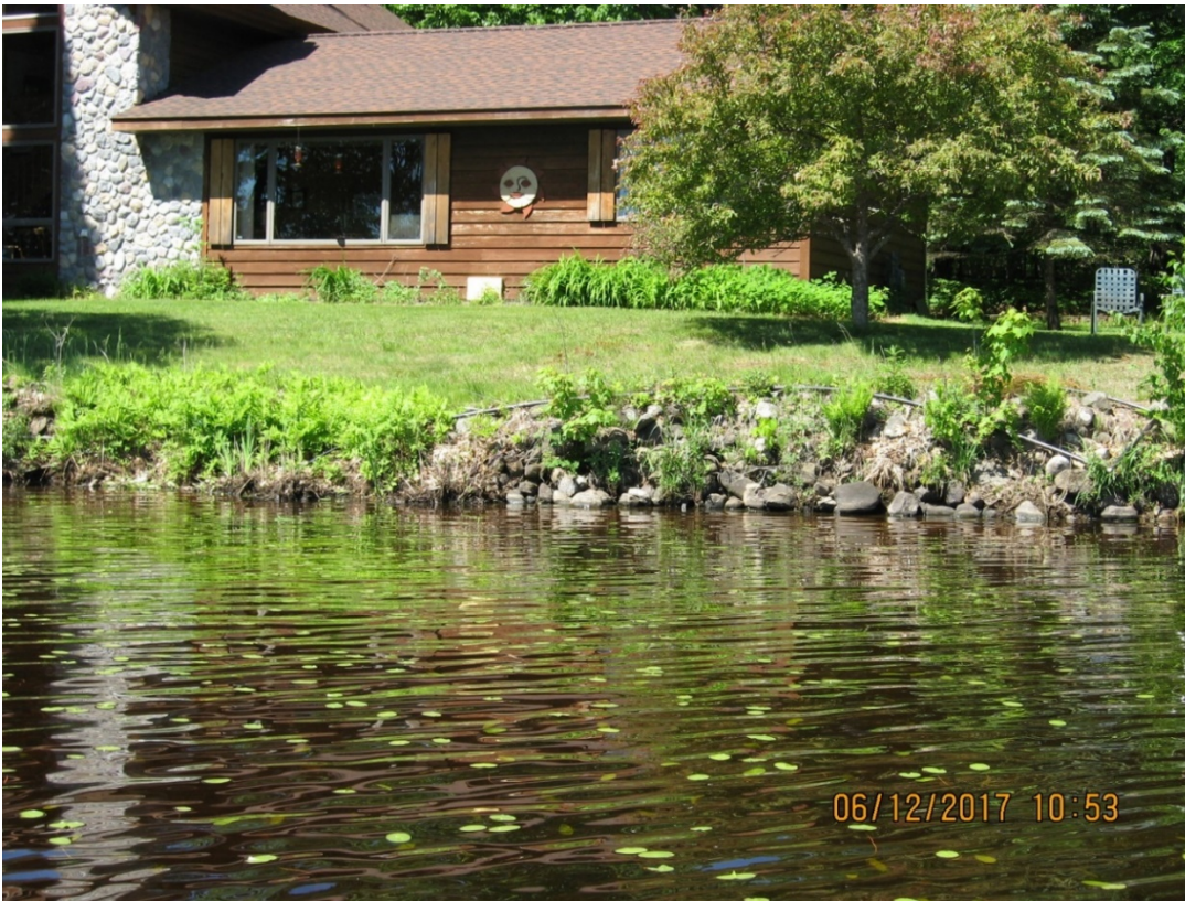
6/12/2017 Property 0200 south “after” – much improved with some small plants remaining later treated by cut stump