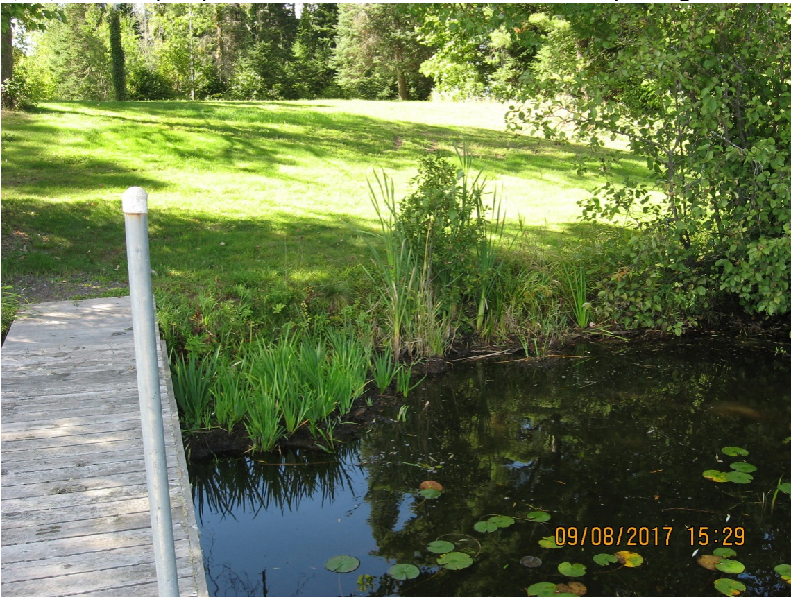
9/8/2017 Property 8900 north side of old dock prior to spray retreatment this date. YFI was growing back after the wipe on glove treatment. Spray retreat this date.