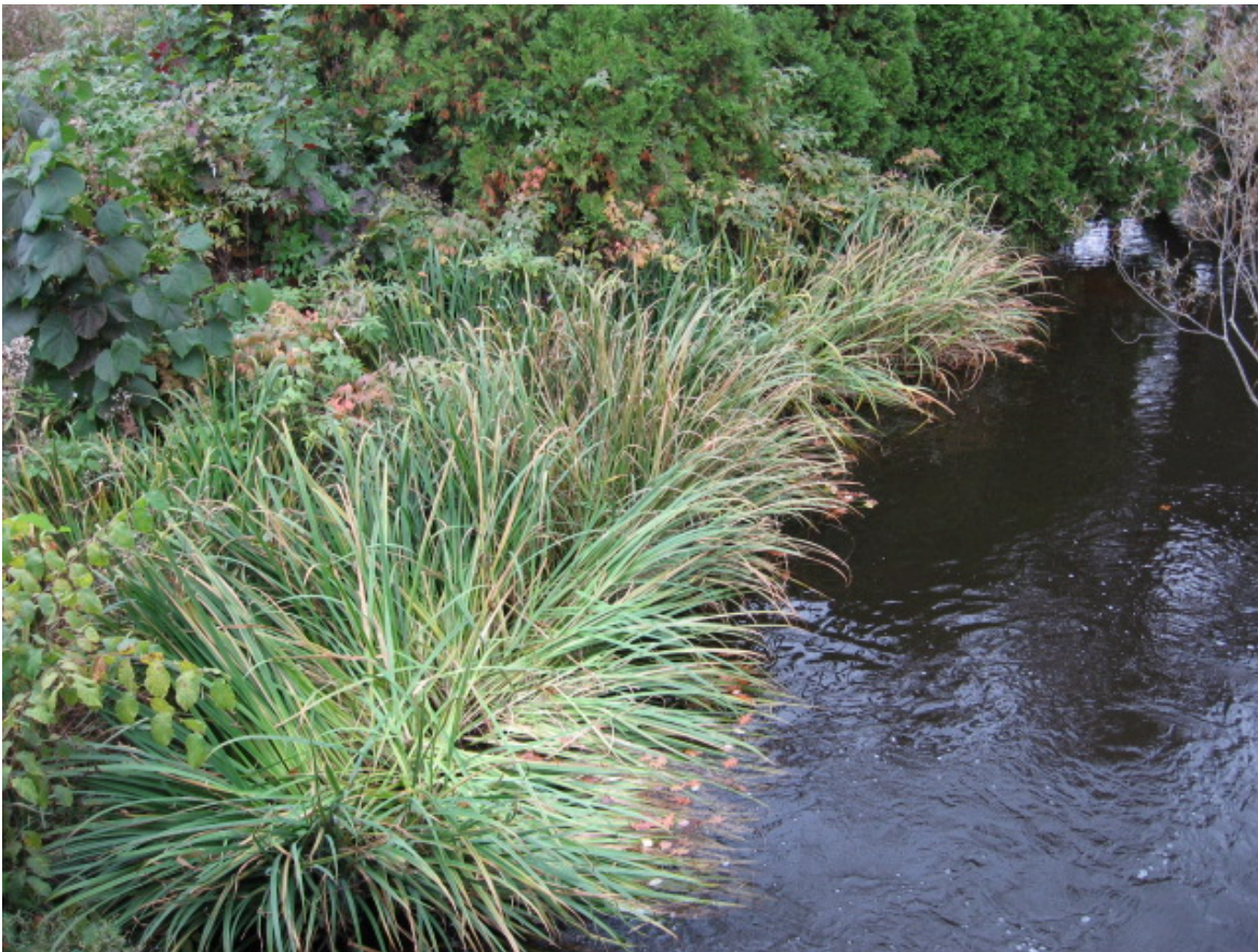
10/12/2016 Minnesuing Creek north side "after" – 34 days after spraying