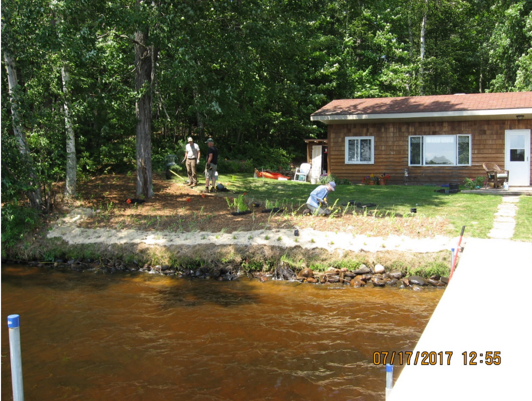
7/17/2017 Property 9200 Healthy Lakes restoration underway