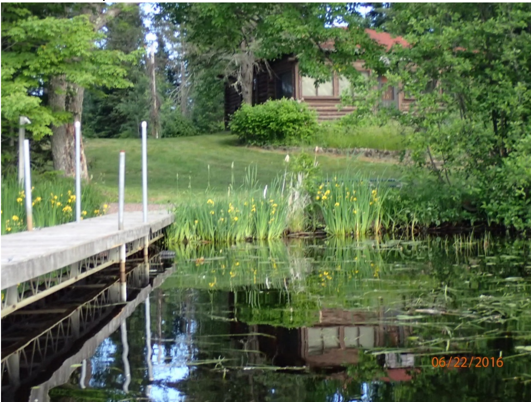
6/22/2016 Property 8900 north side of old dock "before"