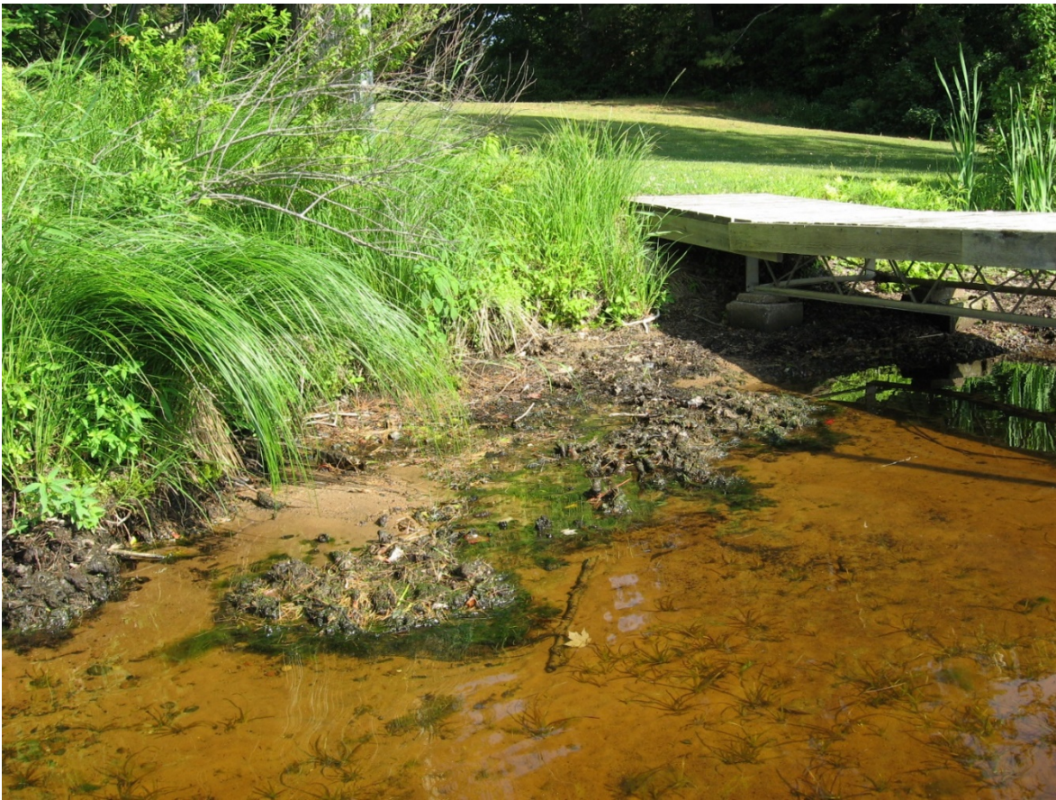
7/2/2020 Property 8900 south side of old dock "after" final spraying 9/12/18, only inert rhizome clumps remain