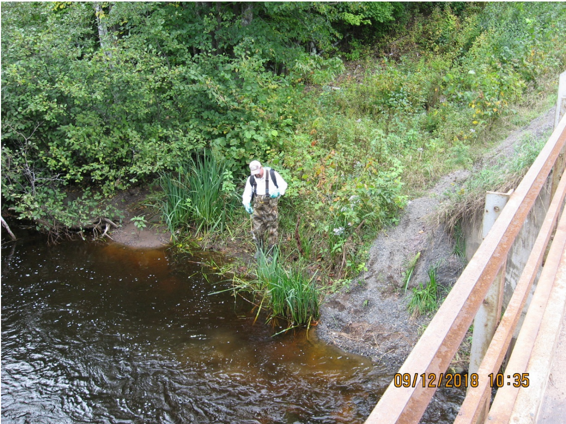
9/12/2018 Minnesuing Creek south side being sprayed after exemption was received