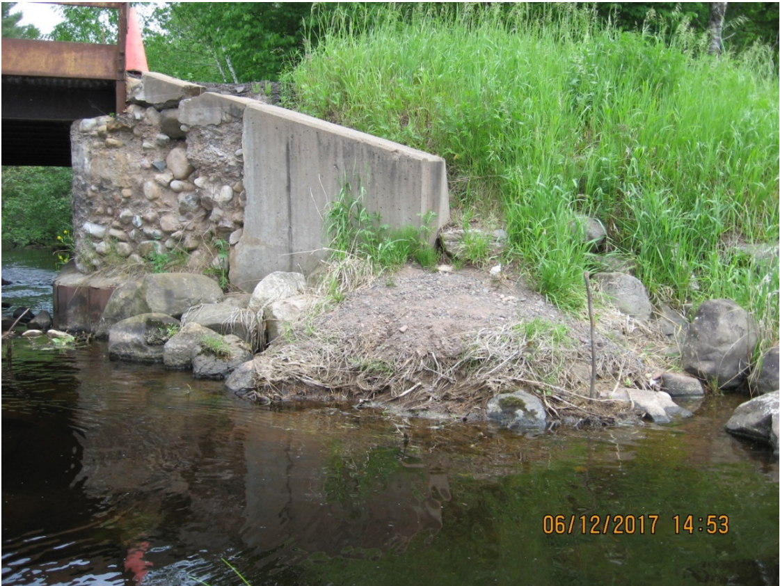
6/12/2017 Minnesuing Creek S side bridge abutment 9 months “after” spraying