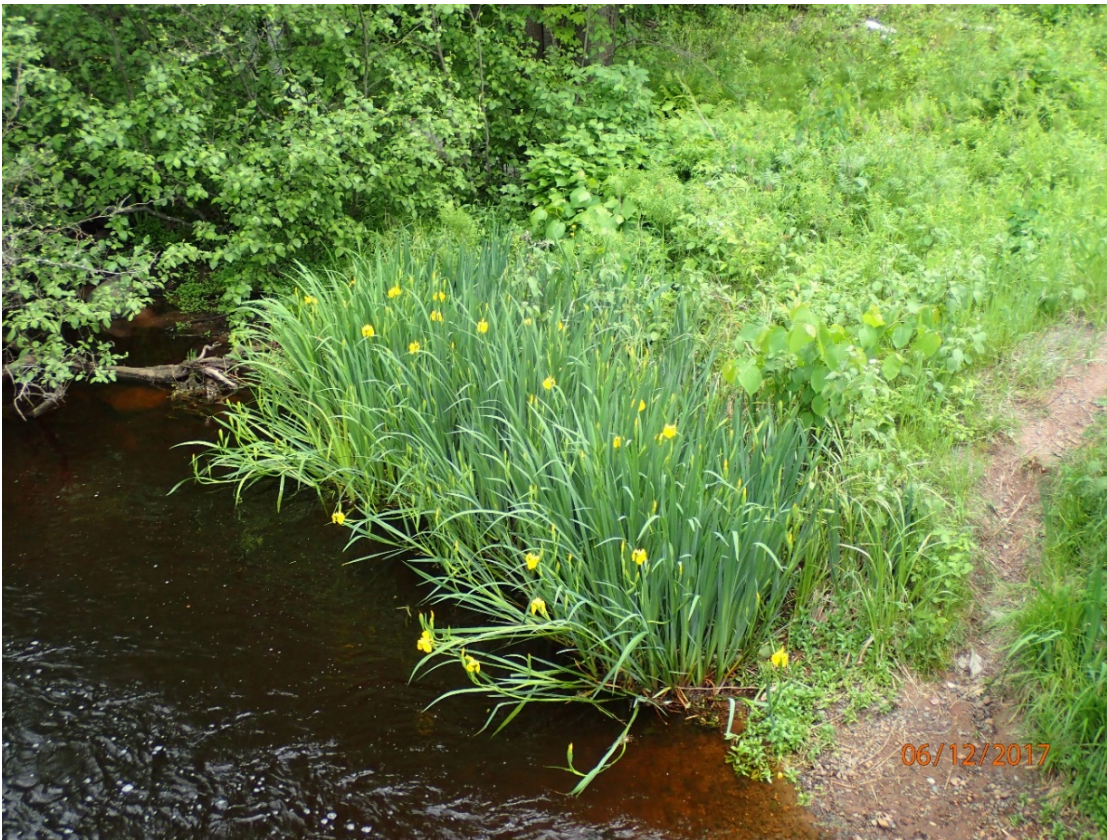
6/12/2017 Comparison - Minnesuing Creek south side not sprayed (Douglas County bans use of herbicides on county property). This is directly across the creek from the north side photos. The creek is about 15' wide.