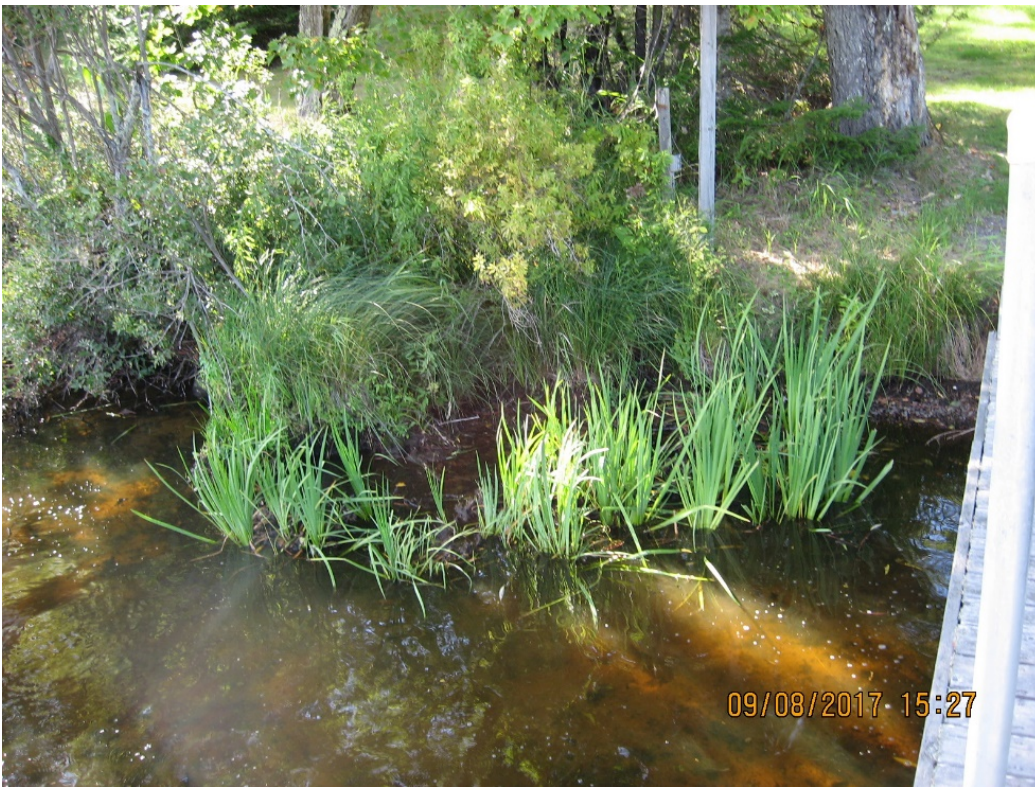
9/8/2017 Property 8900 south side of old dock "prior" to spray retreatment this date