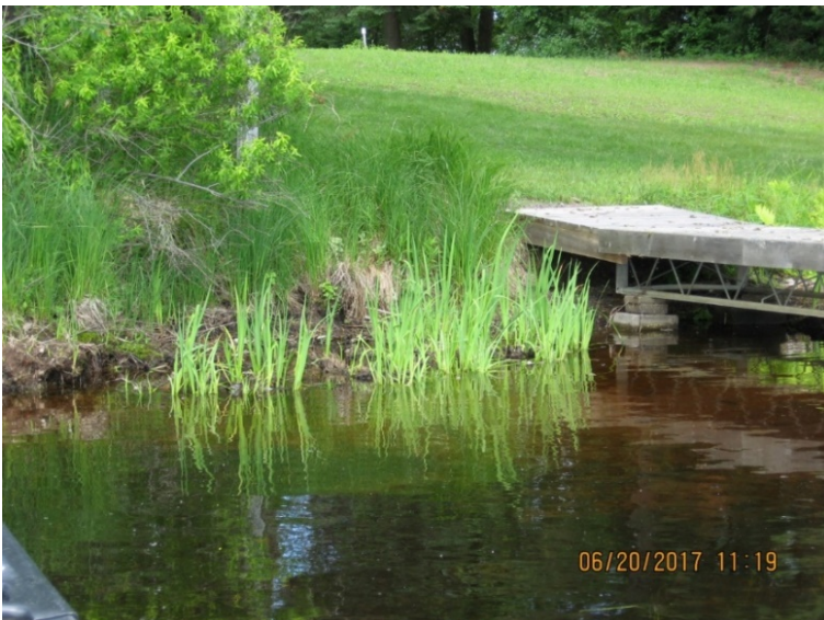
6/20/2017 Property 8900 south side of old dock "after" wipe on glove treatment 9/14/2016