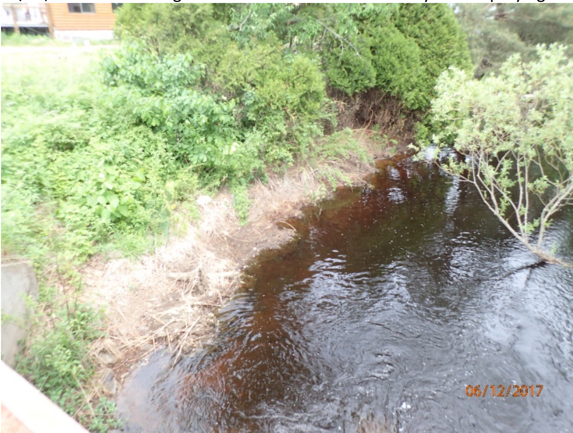
6/12/2017 Minnesuing Creek north side "after" – the year after spraying