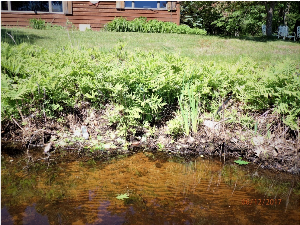
6/12/2017 Property 0200 south “after” 9/8/2016 spraying (photos above and below) – several smaller YFI plants remain though YFI has been largely eliminated.