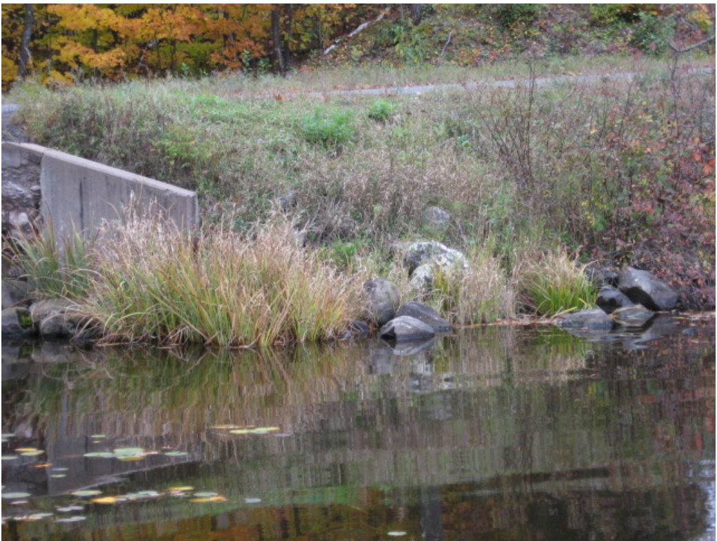
10/12/2016 Minnesuing Creek S side bridge abutment 34 days “after” spraying