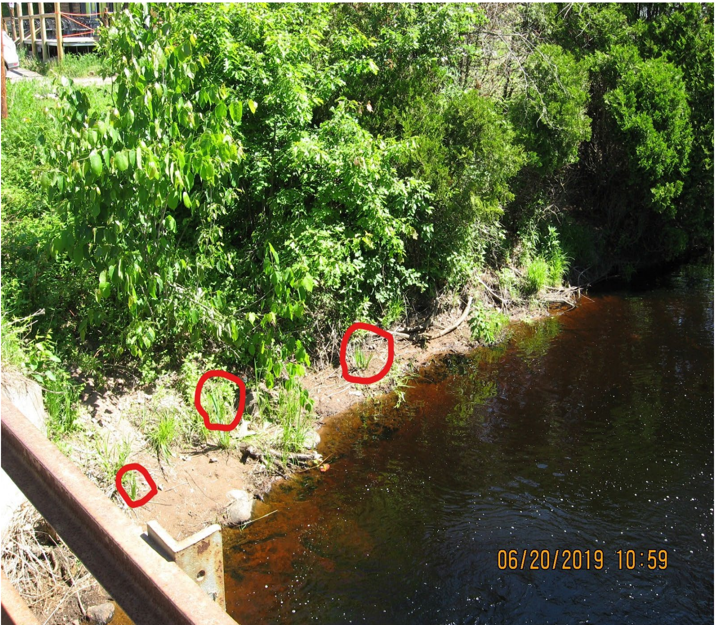
6/20/2019 Minnesuing Creek north side “after” – 3 years after spraying. Only 3 small YFI plants remain. Easy targets for cut stump or butcher knife digging treatment.