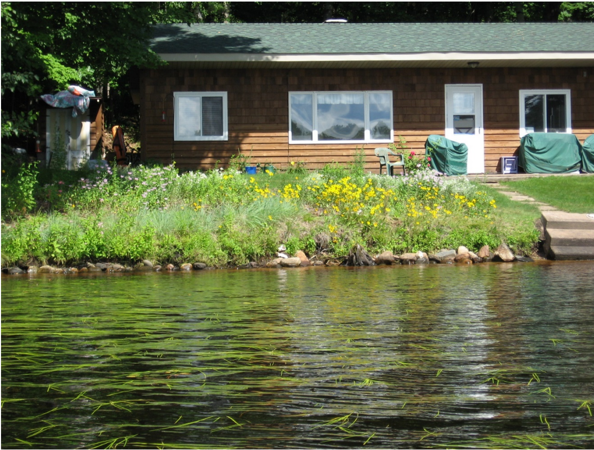
7/30/2020 Property 9200 "after" homeowner spraying and 2017 Healthy Lakes restoration