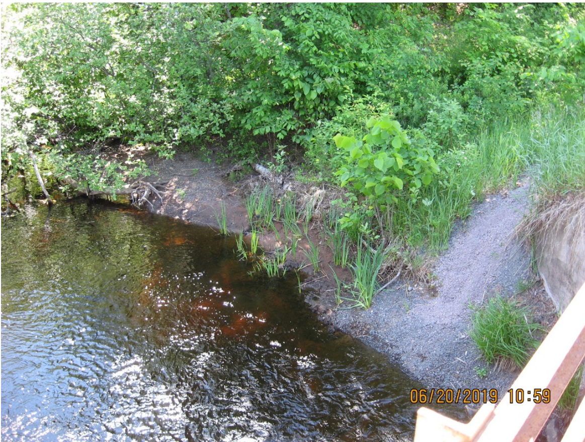
6/20/2019 Minnesuing Creek south side – 9 months “after” spraying. Exemption approved by Douglas County. These re-emerging plants were cut stump treated 9/17/2019.