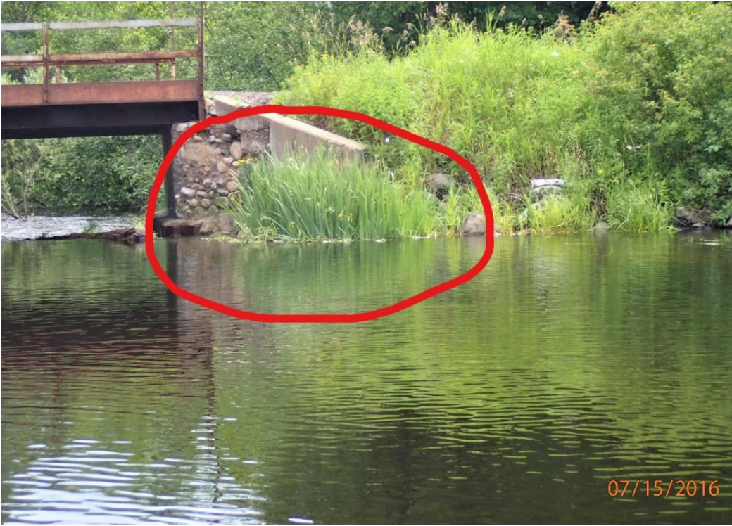
7/15/2016 Minnesuing Creek S side bridge abutment “before”

Minnesuing Creek is the only outflow from Lake Minnesuing.