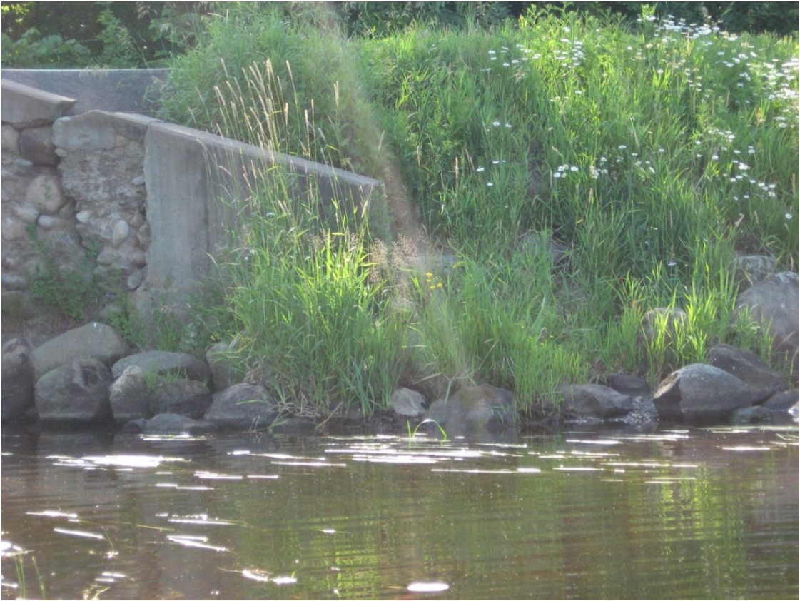
7/3/2020 Minnesuing Creek S side bridge abutment 4 years “after” spraying – native plants have regrown