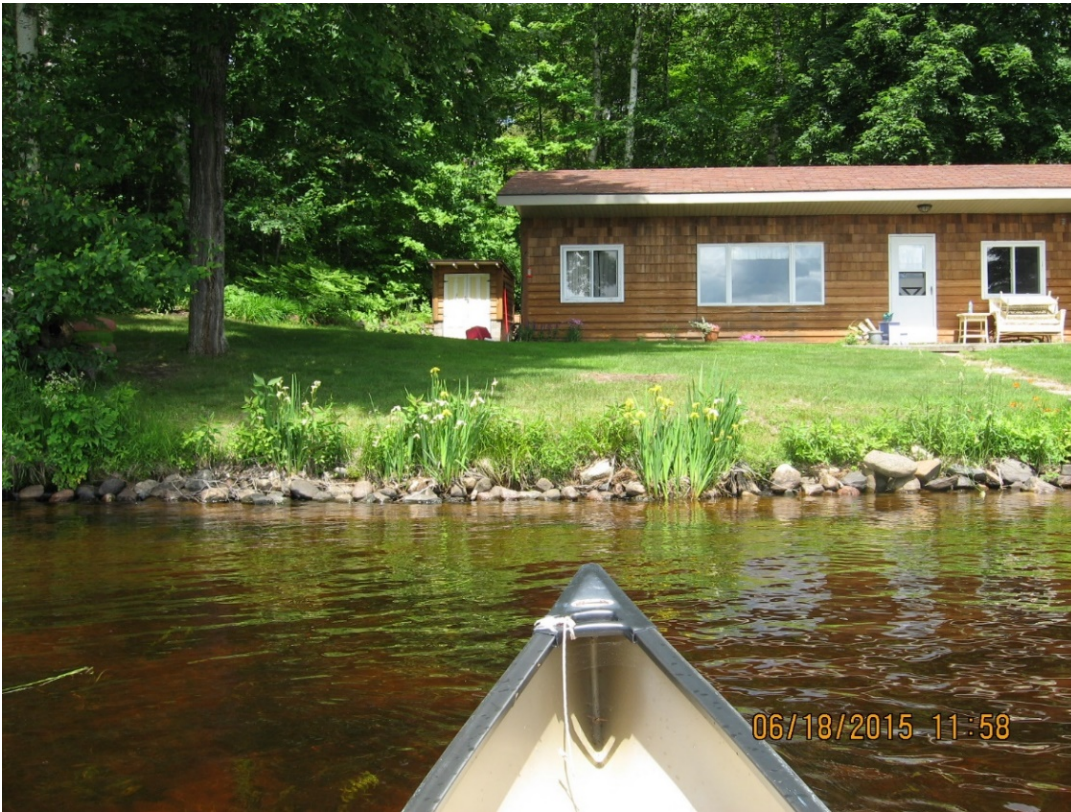
6/18/2015 Property 9200 "before"