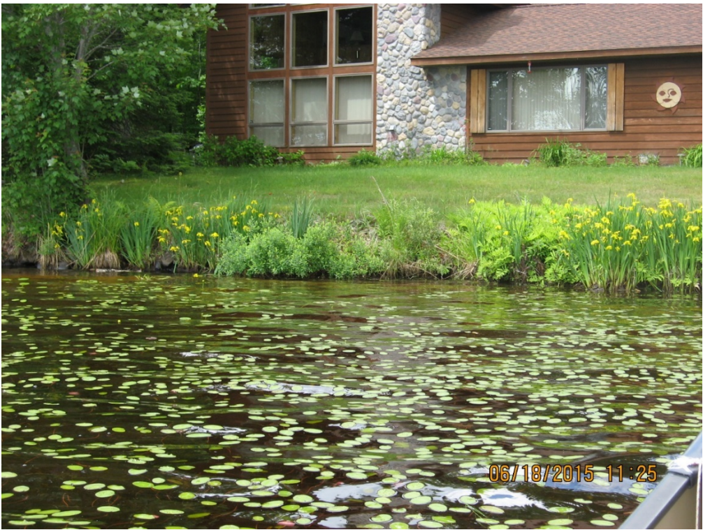
6/18/2015 Property 0200 south “before”