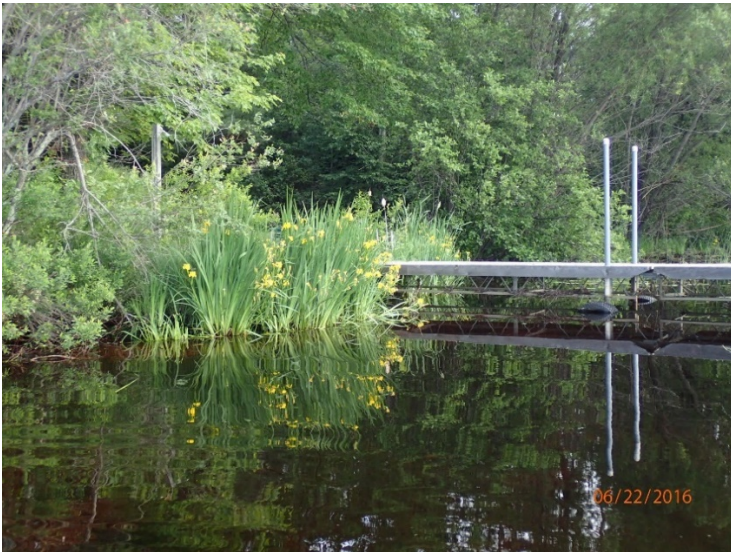
6/22/2016 Property 8900 south side of old dock "before". Mature YFI with heavy rhizome structure

In retrospect, this property should have received a spray treatment initially rather than the initial wipe on glove treatment and then the final treatment in 2018 could very likely have been reduced to a more targeted cut stump treatment. The rhizome structure was just too dense for the initial wipe on treatment to be very successful.