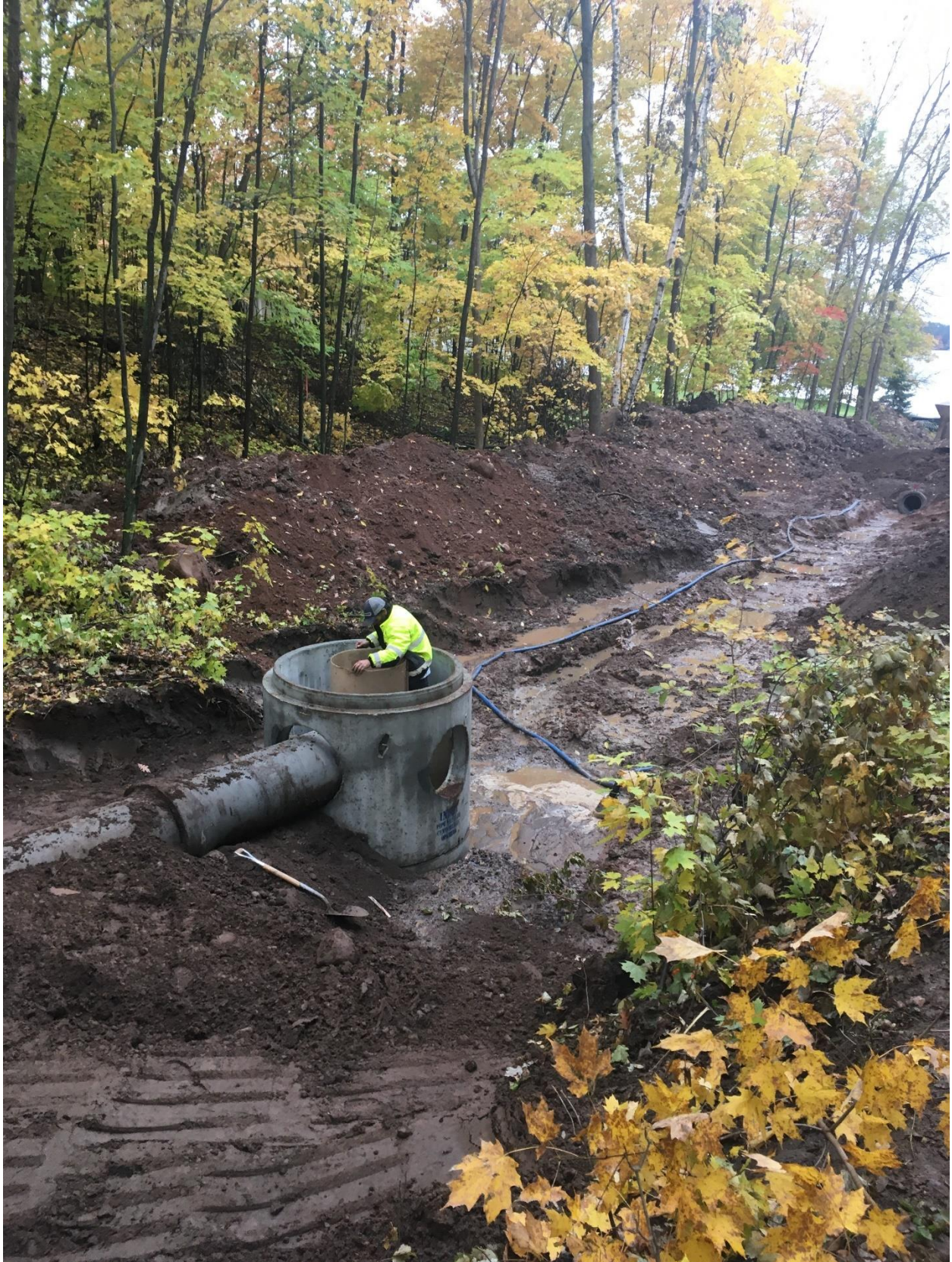
Photo 9. Installing hydrodynamic separator unit at Goldsmith site on Jeffery Boulevard