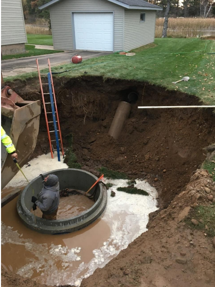
Photo 2. Installing hydrodynamic separator manhole at 3 rd Avenue