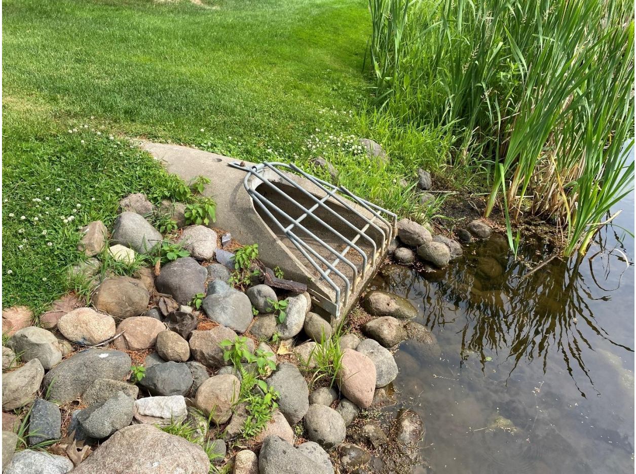
Photo 4. Outlet to Rabbit Island Bay