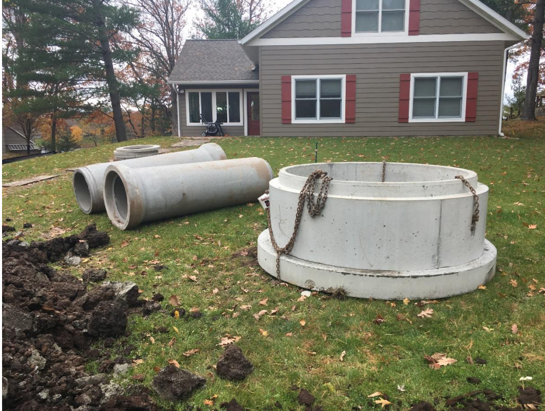
Photo 5. Materials delivered to Cifaldi site on Jeffery Boulevard