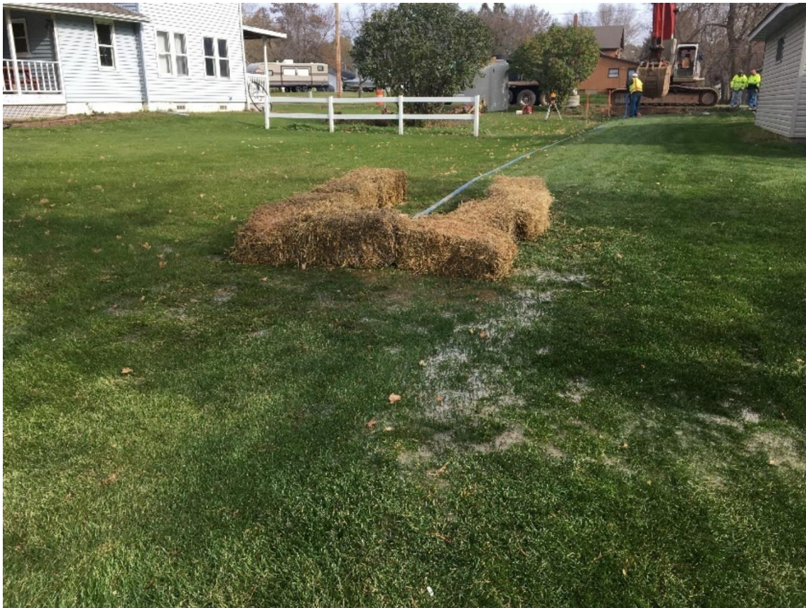
Photo 1. Dewatering at 3 rd Avenue project site during excavation

See below for images of each project site during and after construction.