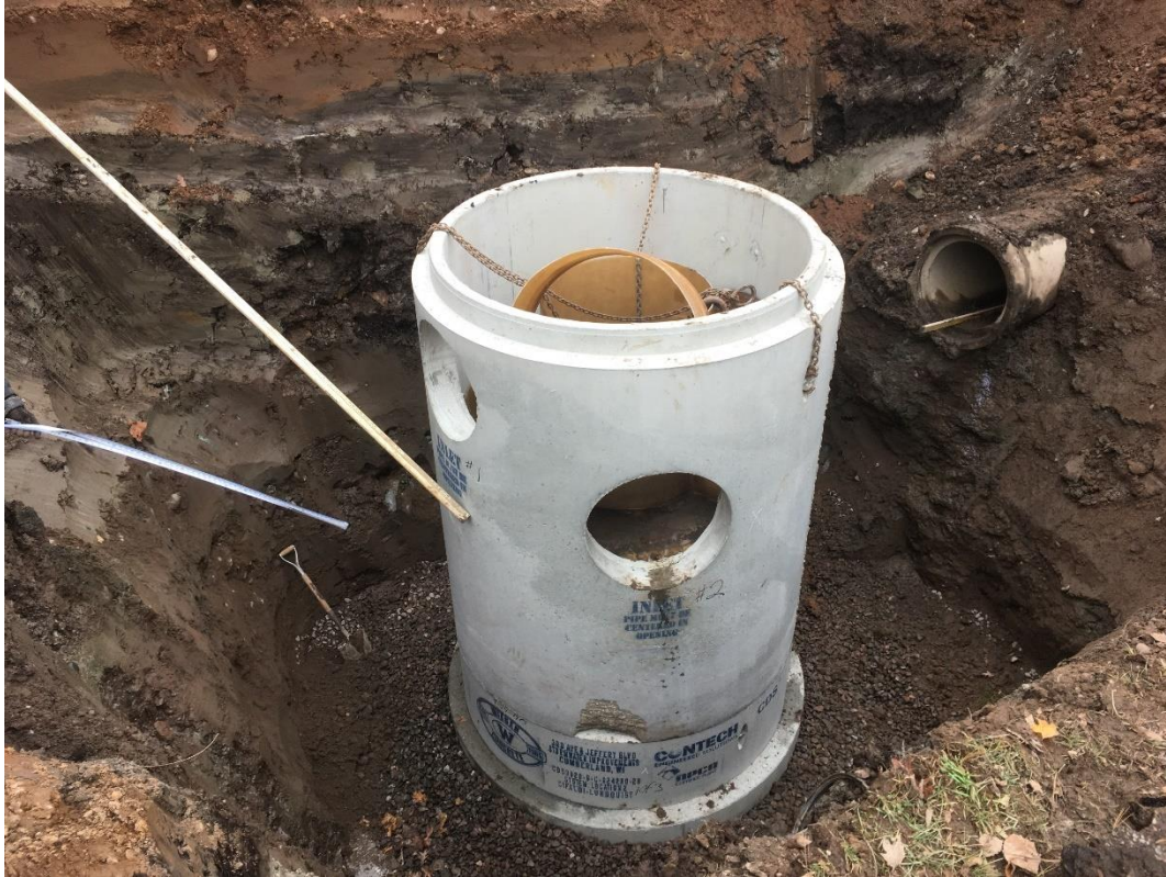
Photo 7. Installing hydrodynamic separator unit