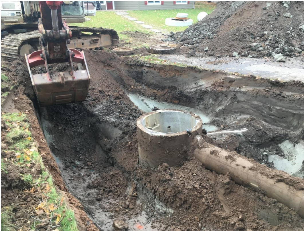
Photo 6. Excavation at Cifaldi site