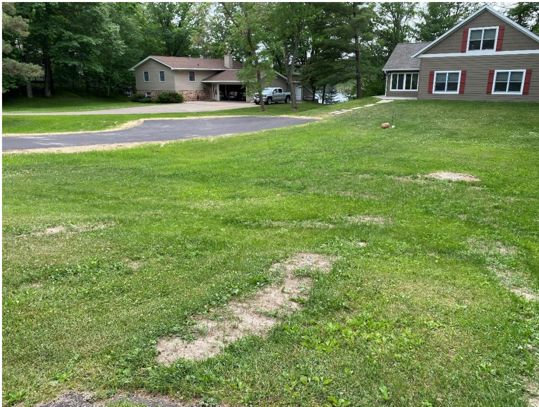
Photo 8. The restored site at Cifaldi residence, along Jeffery Boulevard