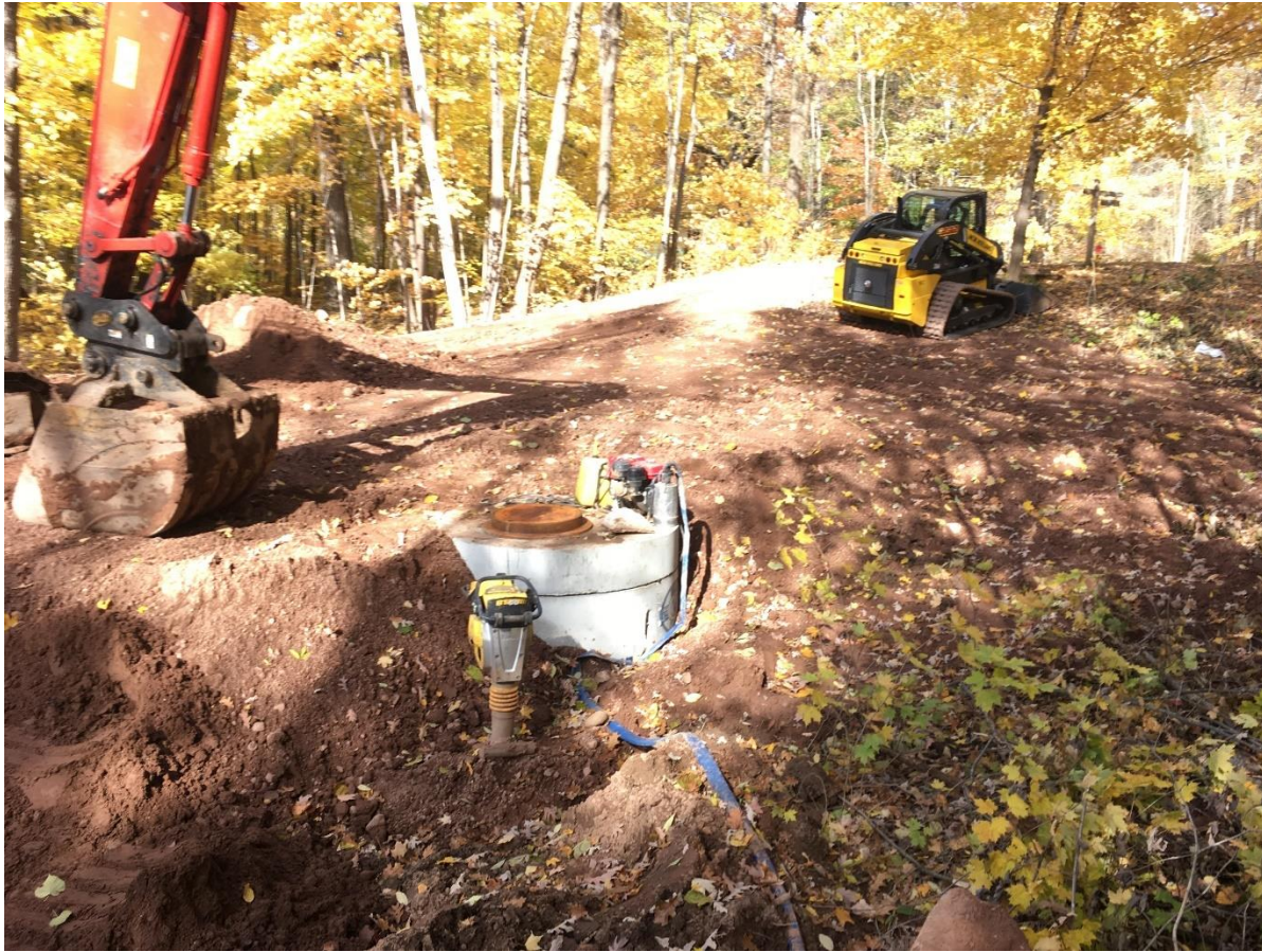
Photo 10. Final grading at Goldsmith site on Jeffery Boulevard