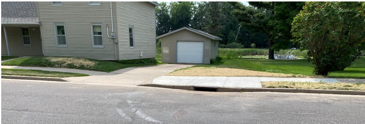
Photo 3. Completed site restoration at 3 rd Avenue, including seeding and concrete sidewalk