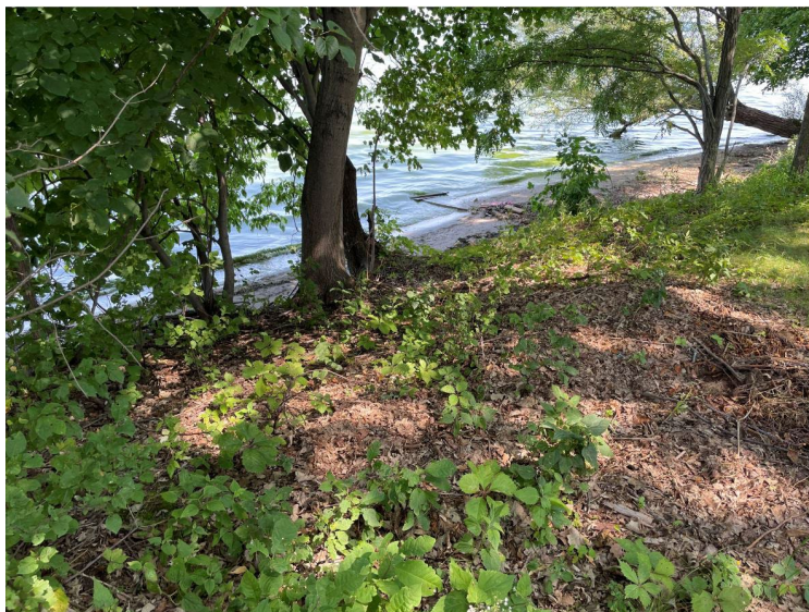
“Before”, April 2024