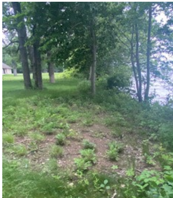
“After”, June 2025