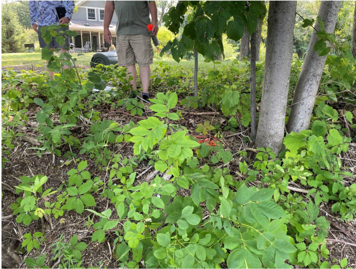
“Before”, April 2024