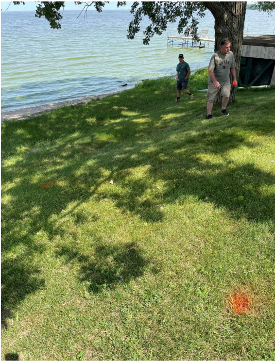
“Before”, April 2024