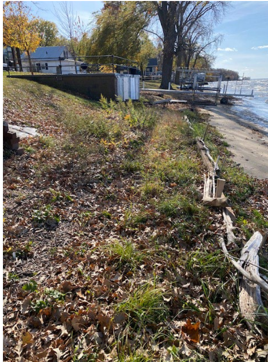
“During”, June 2024