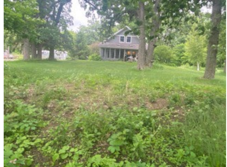
“After”, June 2025