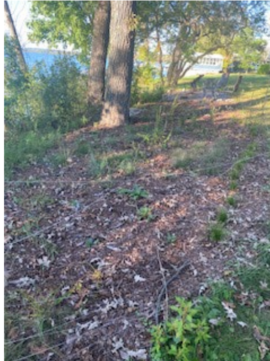
“During”, June 2024