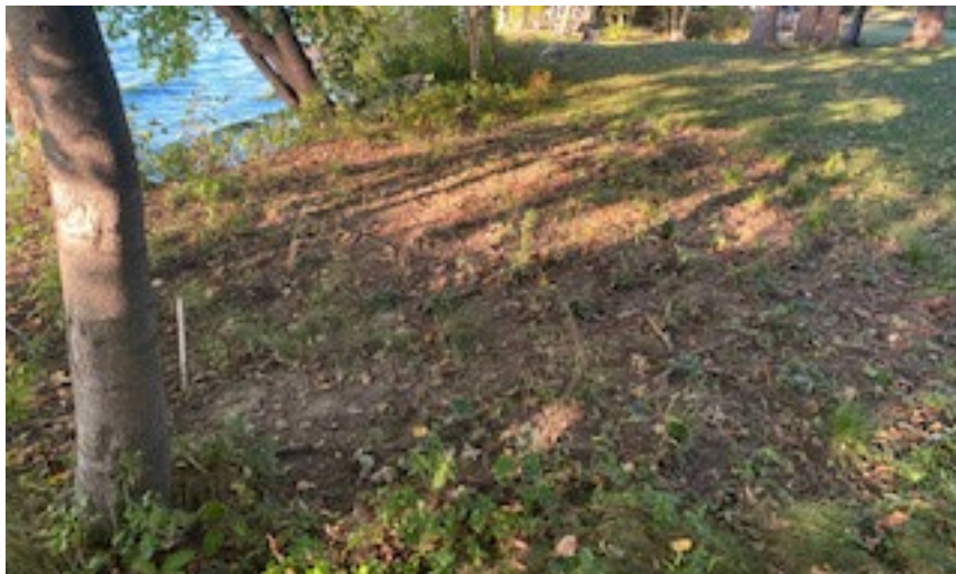
“During”, June 2024