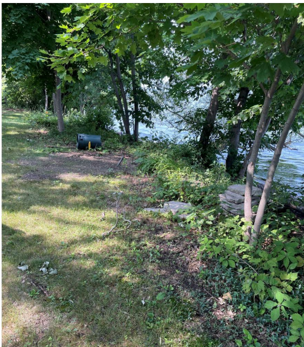
“Before”, April 2024