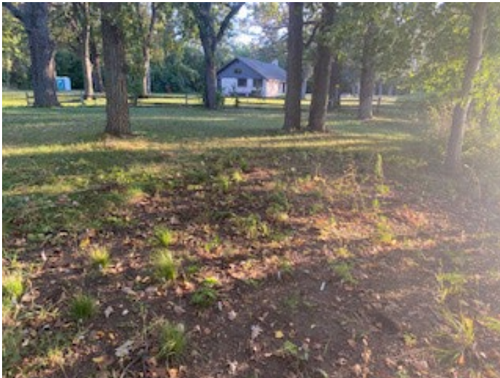
“During”, June 2024