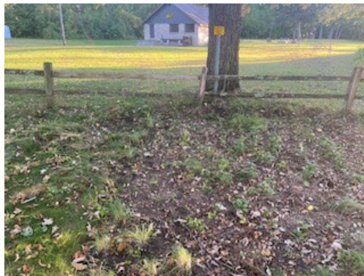
“After”, June 2025