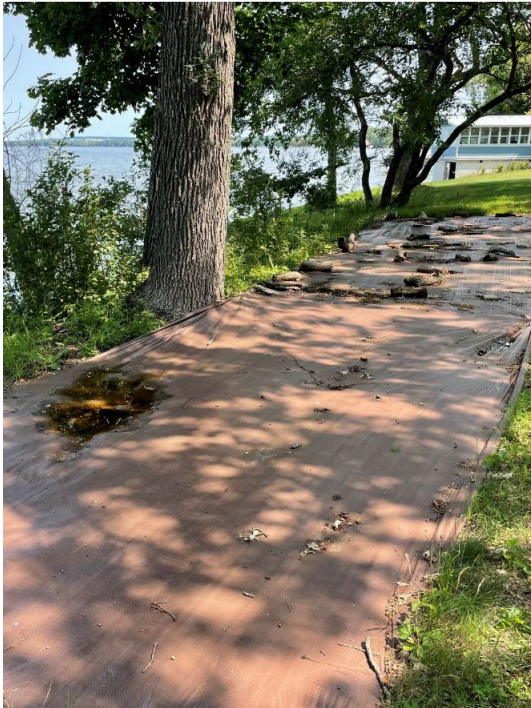
“Before”, April 2024