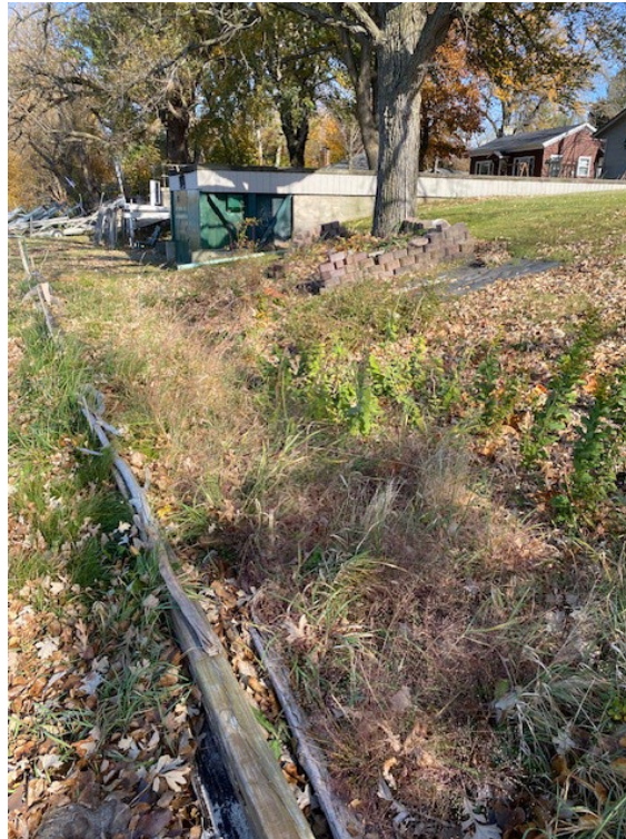
“During”, June 2024