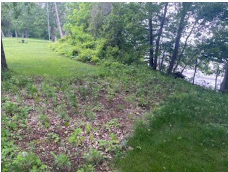
“During”, June 2024