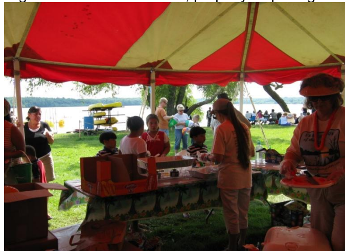
Food was purchased, prepared and served to over 250 participants.

Beach goers were educated on the concepts of watersheds and on the ways that people, wildlife and environmental conditions, such as excessive precipitation and flooding affect water quality. Citizens were encouraged to implement practices that reduce contamination at the beaches, including not feeding waterfowl, properly disposing diapers, using the beach house toilets, properly disposing litter and other practices.