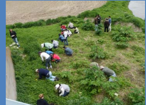
International students assist the Friends of the Platte control Japanese hops along the banks of the Little Platte River.

Friends of Badfish Creek board member, Lynne Diebel, teaches volunteers about the threat of Japanese knotweed.